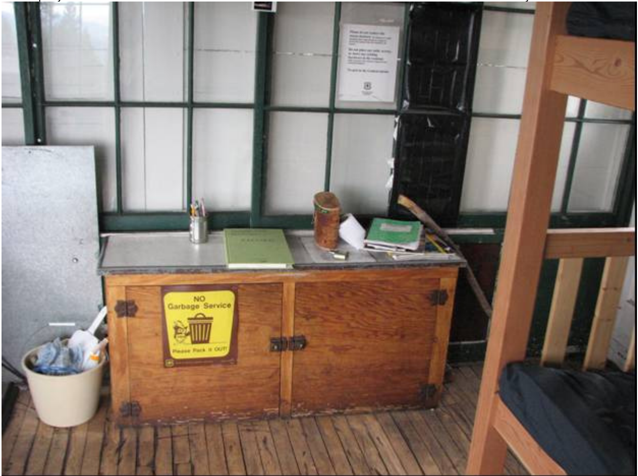
MT_MissoulaCounty_WestForkButteLookout_0005. Interior view: west wall with storage box.

Missoula County, Montana County and State