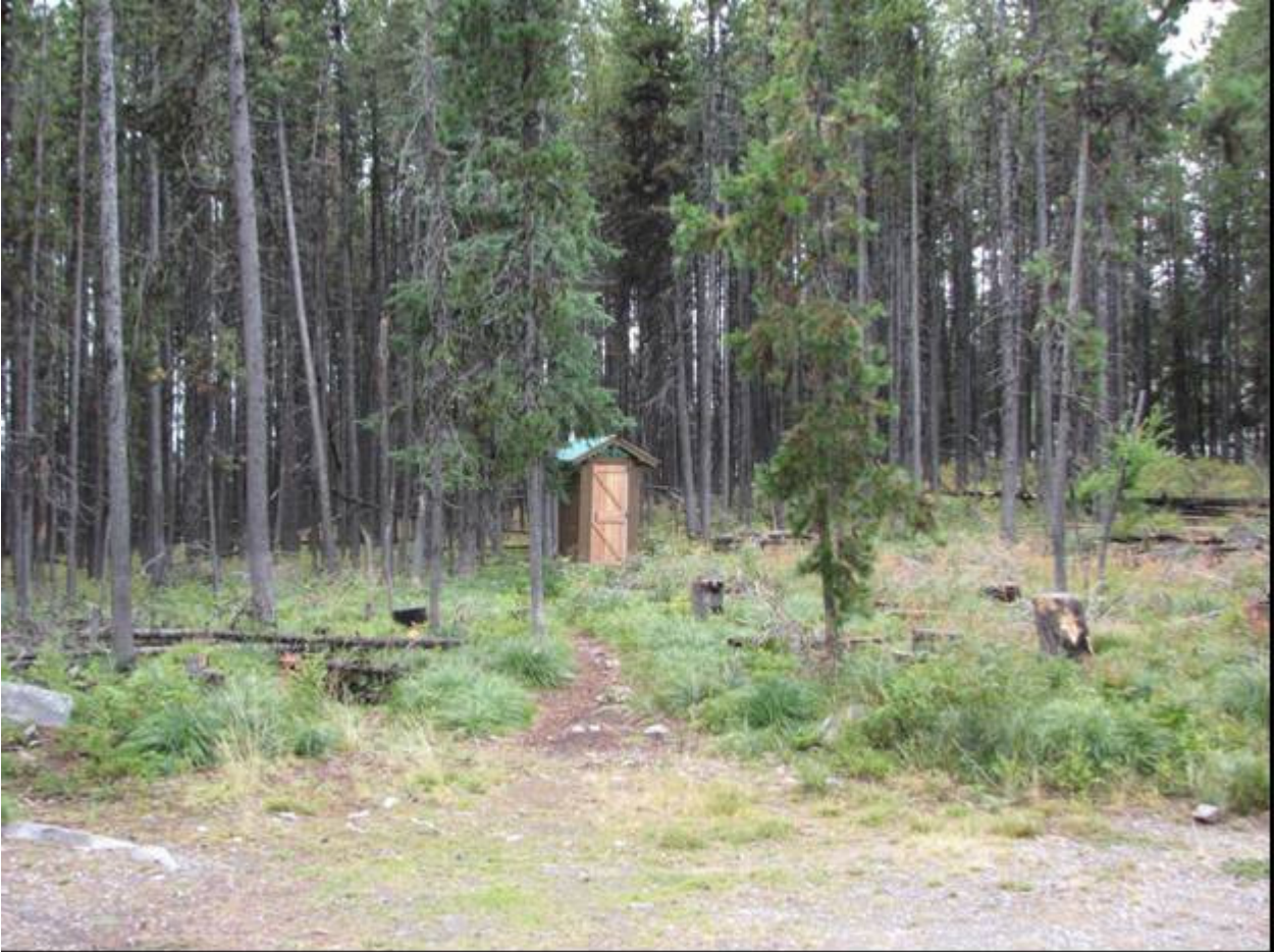
MT_MissoulaCounty_WestForkButteLookout_0008. Looking south to the modern pit toilet.

Missoula County, Montana County and State