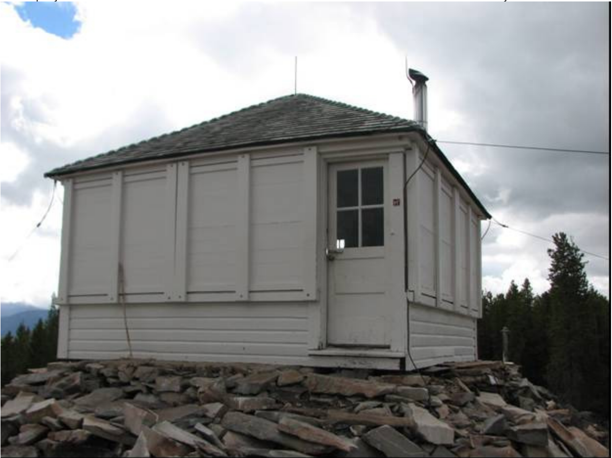
MT_MissoulaCounty_WestForkButteLookout_0002. Looking east-southeast to the north (front) and west walls of the lookout.

Missoula County, Montana County and State