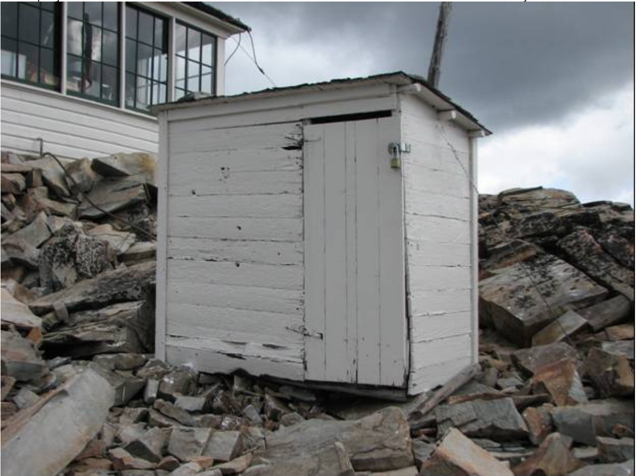
MT_MissoulaCounty_WestForkButteLookout_0006. Looking northeast at the west (front) and south sides of the storage shed.

Missoula County, Montana County and State