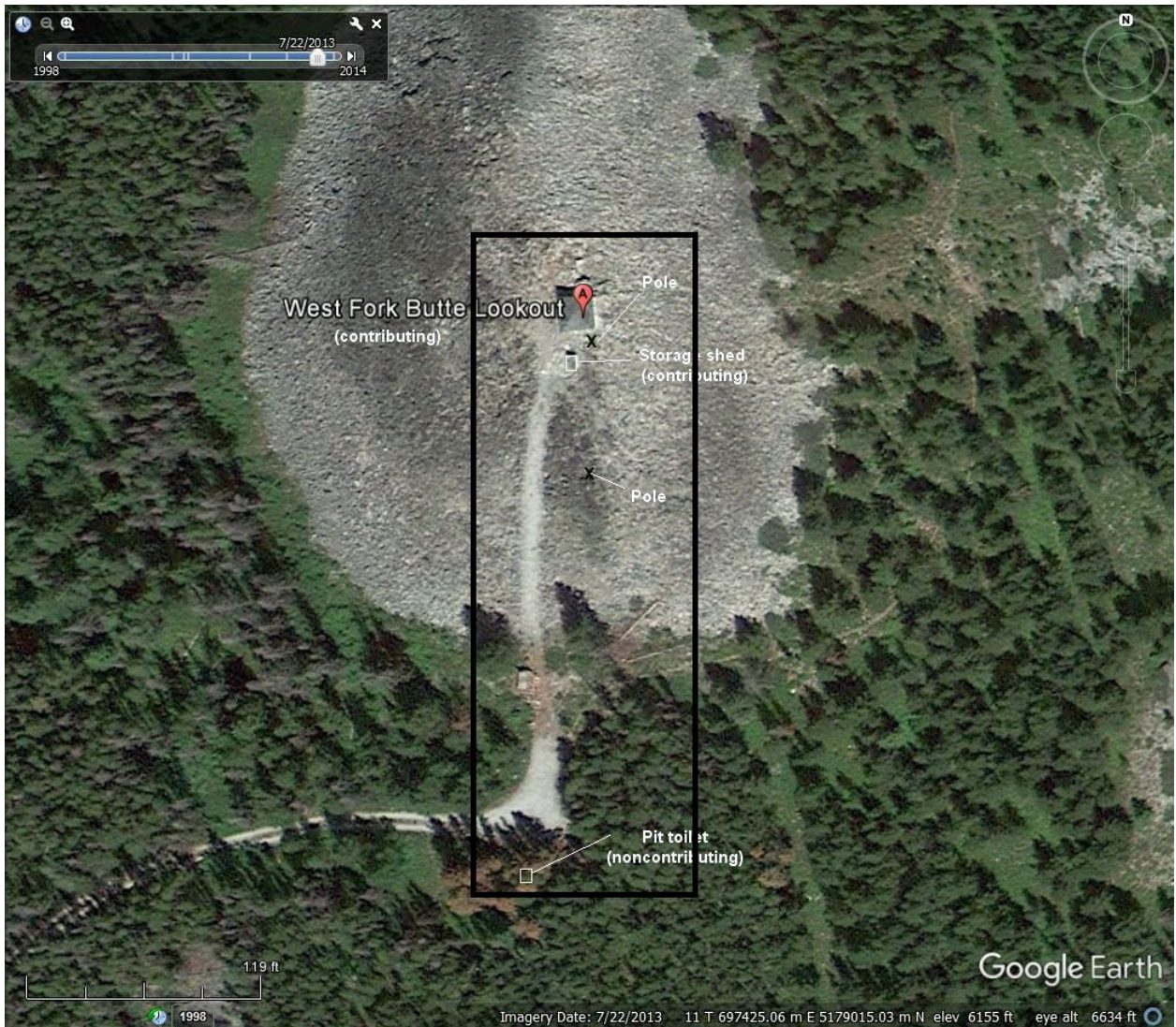
2013 Aerial image of West Fork Butte Lookout Site

Missoula County, Montana County and State