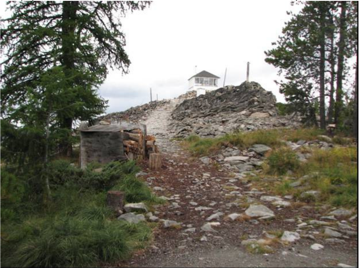
MT_MissoulaCounty_WestForkButteLookout_0001. Looking north from the end of the lookout spur road along the path to the lookout.

Missoula County, Montana County and State