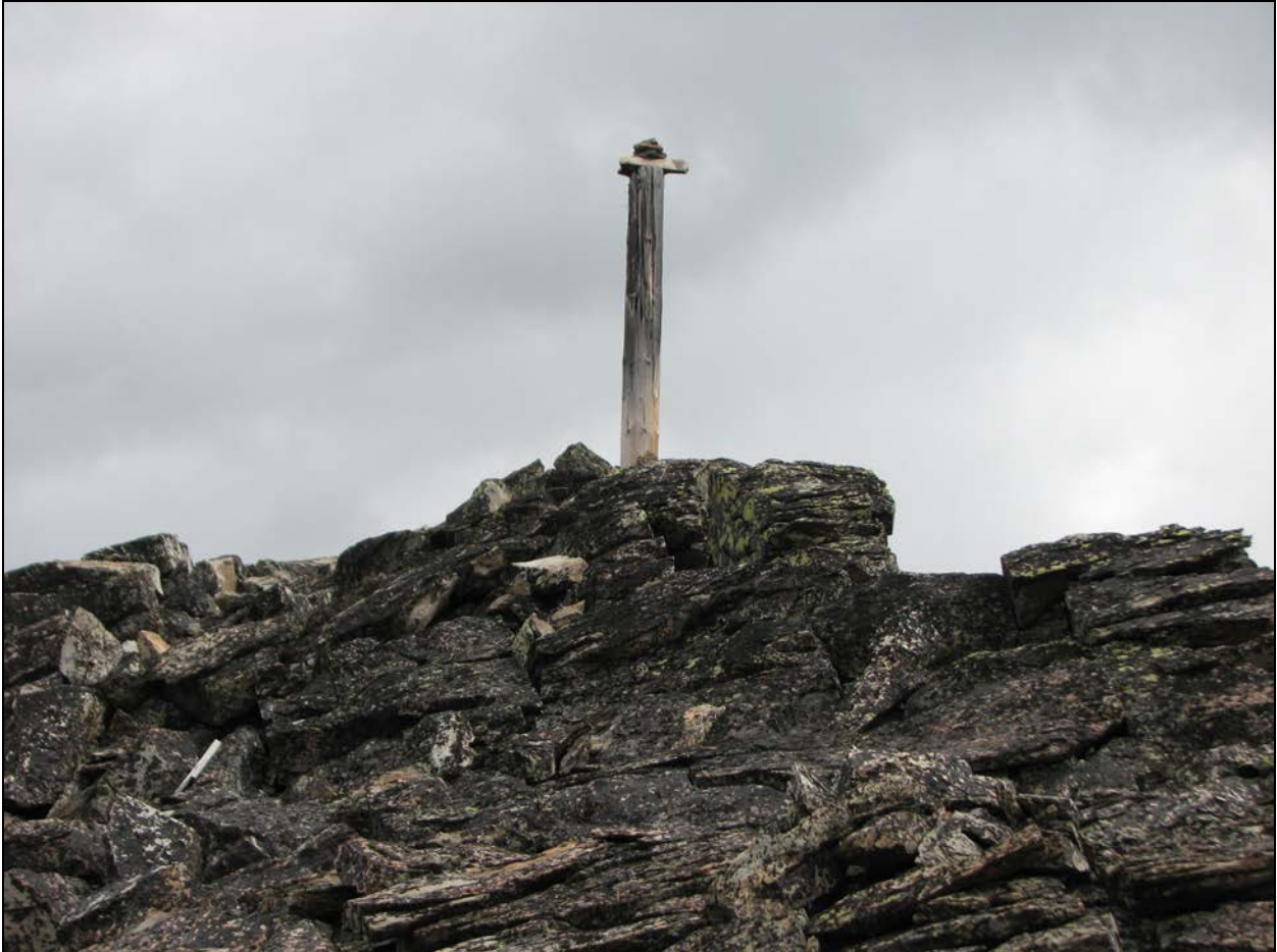
MT_MissoulaCounty_WestForkButteLookout_0009. Looking northeast to the base of a telephone pole, east side of the trail about 70 ft. south of the lookout house.

Missoula County, Montana County and State