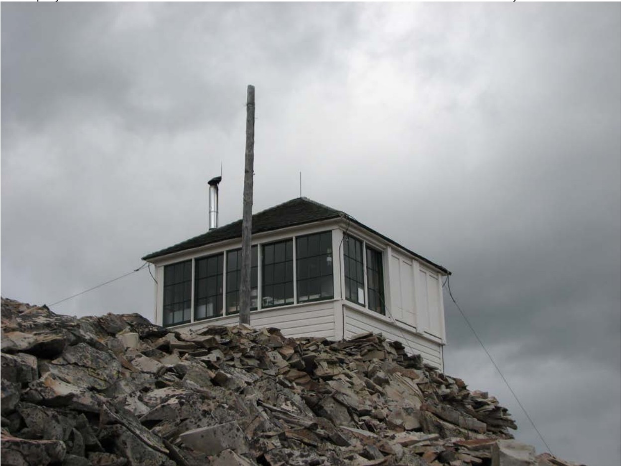
MT_MissoulaCounty_WestForkButteLookout_0003. Looking northwest to the south (rear) and east walls of the lookout. Note the full-height telephone pole near the southeast corner of the building.

Missoula County, Montana County and State