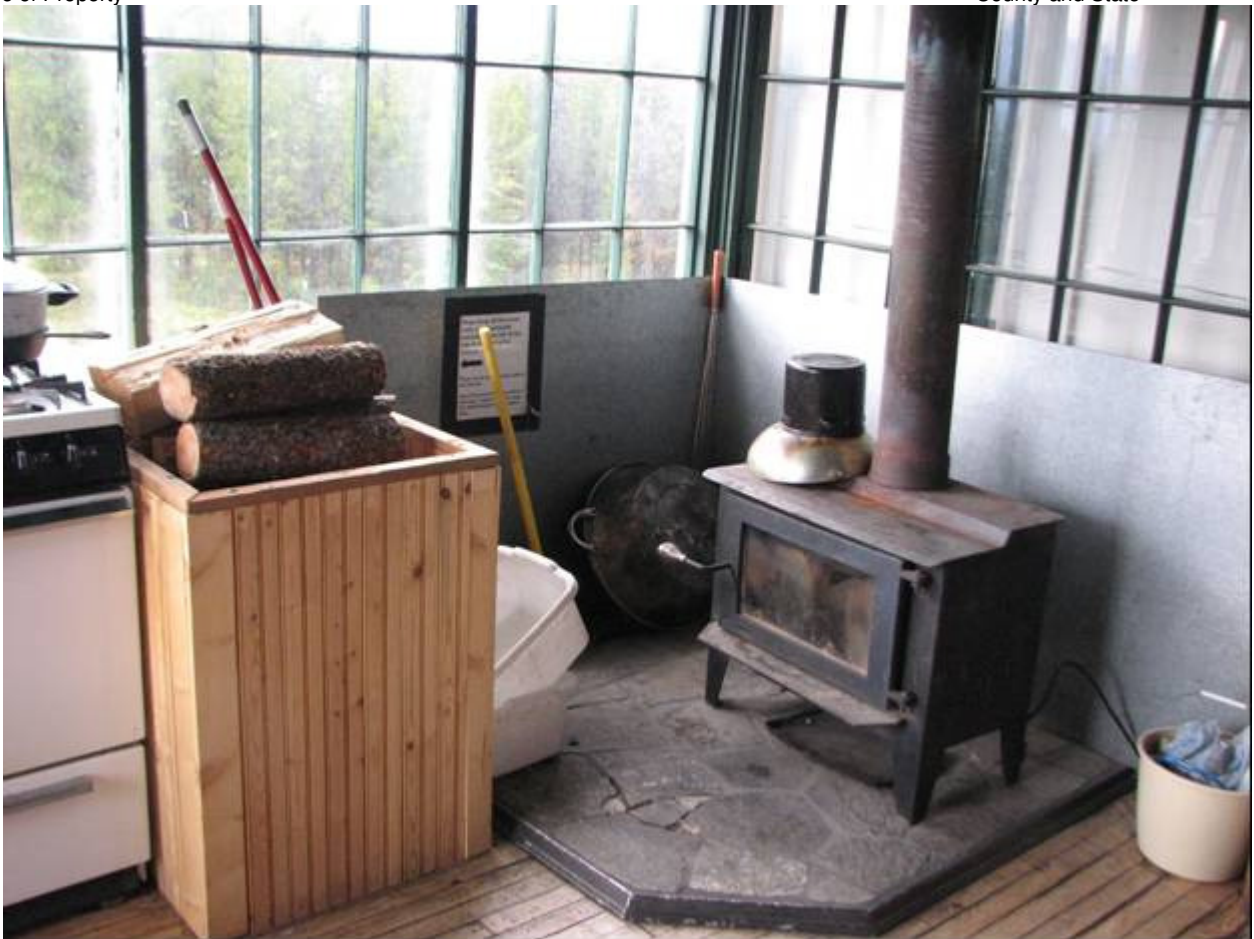
MT_MissoulaCounty_WestForkButteLookout_0004. Interior: southeast corner with hearth and wood stove, firewood box and cook stove.

Missoula County, Montana County and State