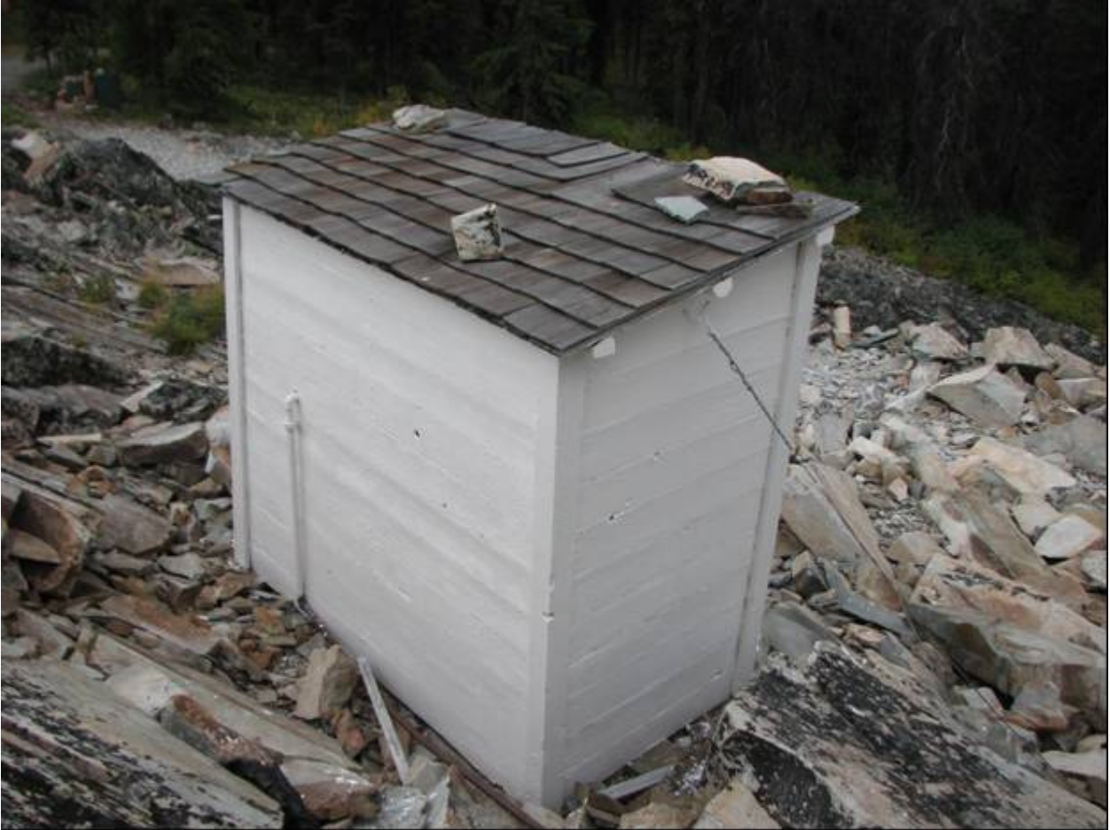
MT_MissoulaCounty_WestForkButteLookout_0007. Looking southwest to the east (rear) and north walls of the storage shed.

Missoula County, Montana County and State