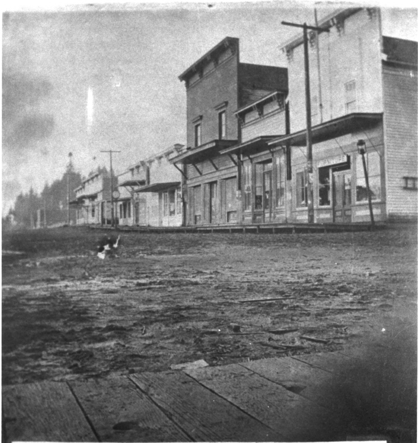
Main St. (looking South)