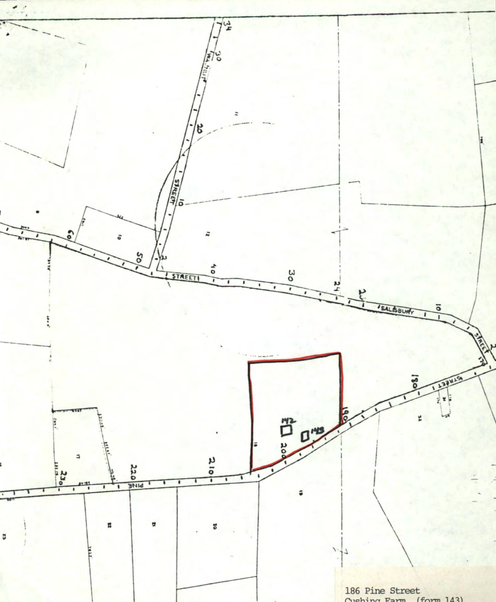
186 Pine Street Cushing Farm (form 143) Town of Rehoboth Property Map scale 1"=200' 1978