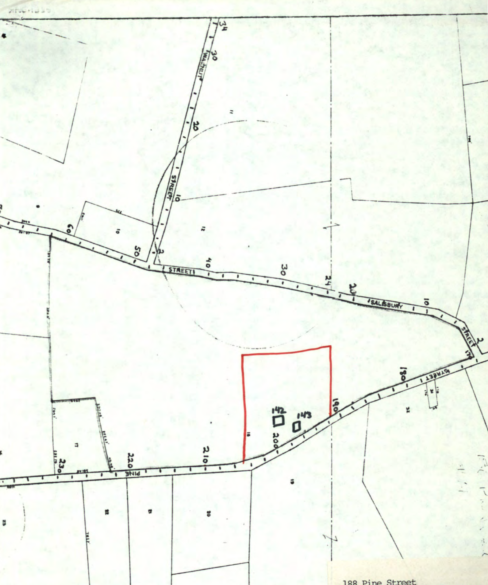
188 Pine Street Caleb Cushing Farm (form 142) Town of Rehoboth Property Map scale 1"=200' 1978