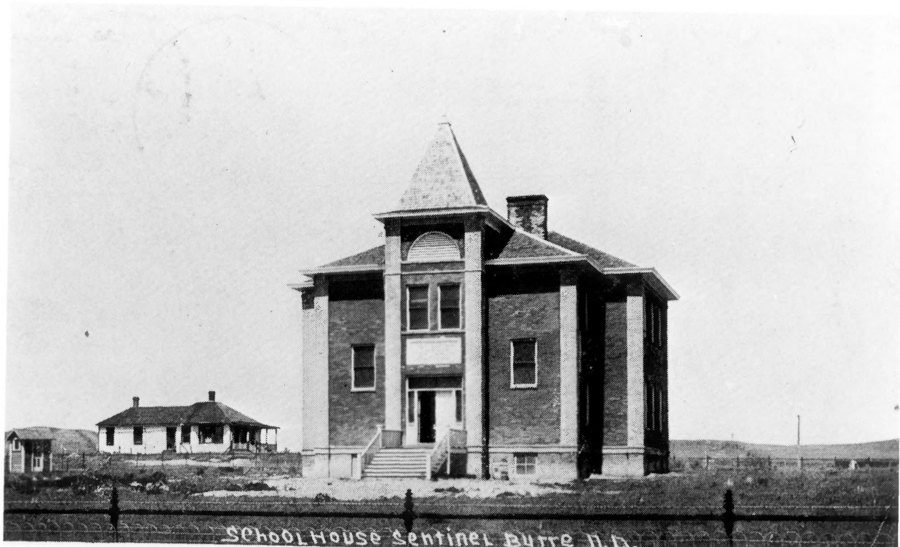
SCHOOL HOUSE SENTINEL BUTTE N. D.