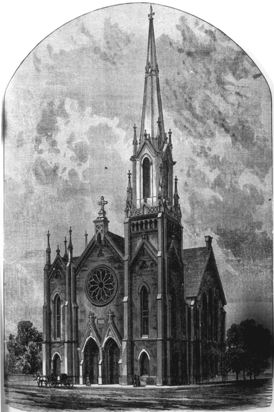
SALEM M. E. CHURCH.