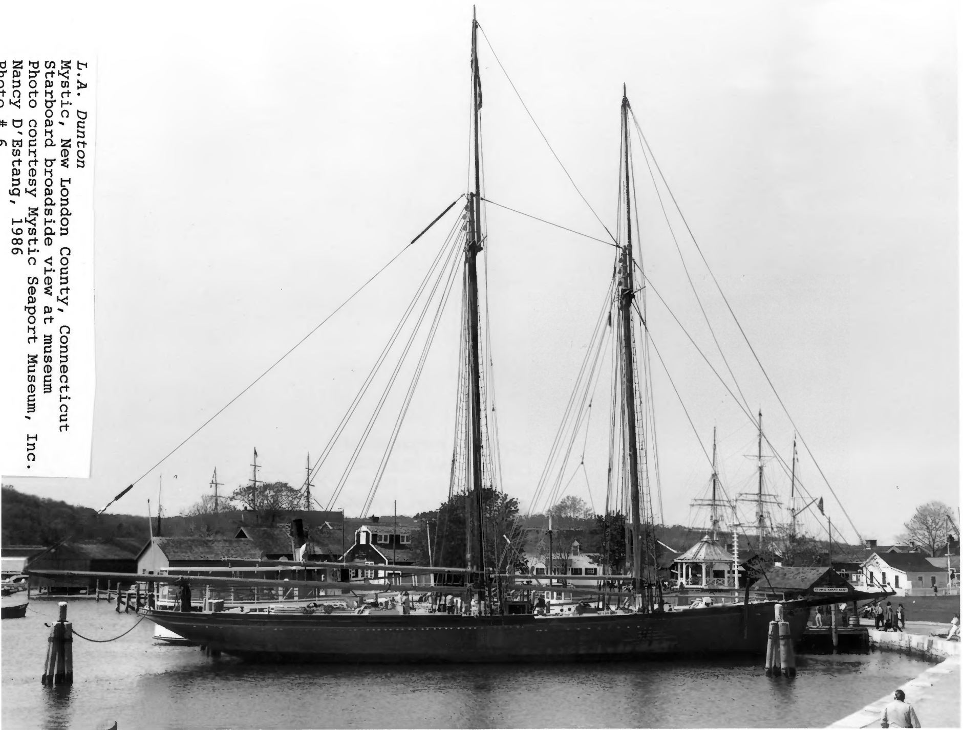
L.A. Dunton Mystic, New London County, Connecticut Starboard broadside view at museum Photo courtesy Mystic Seaport Museum, Inc. Nancy D'Estang, 1986 Photo # 6