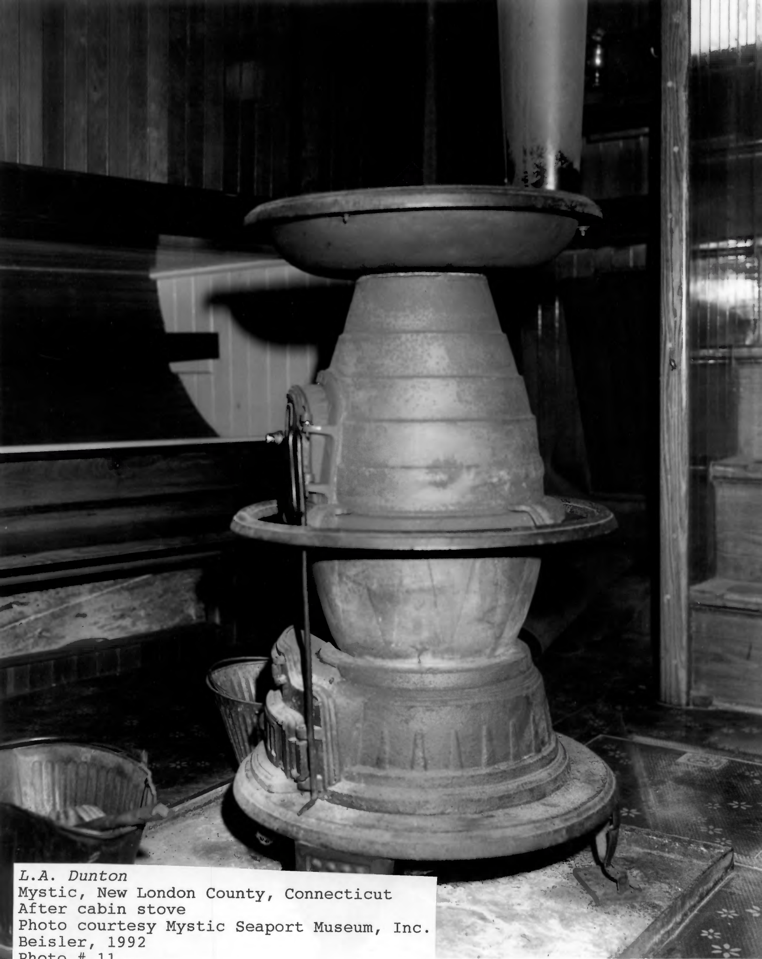
L.A. Dunton Mystic, New London County, Connecticut After cabin stove Photo # 11