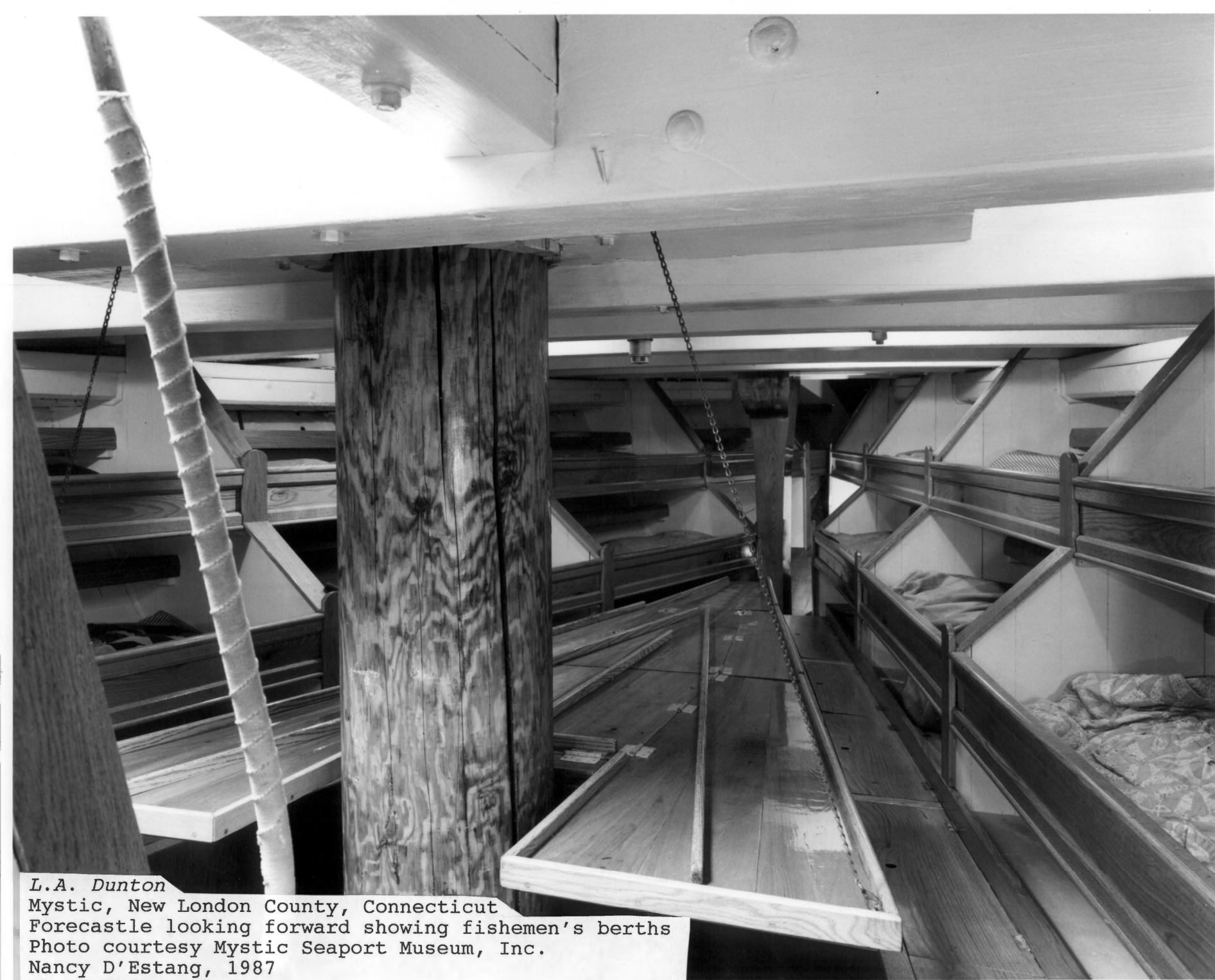
L.A. Dunton Mystic, New London County, Connecticut Forecabin looking forward showing fishermen's berths Photo courtesy Mystic Seaport Museum, Inc. Nancy D'Estang, 1987 Photo # 8