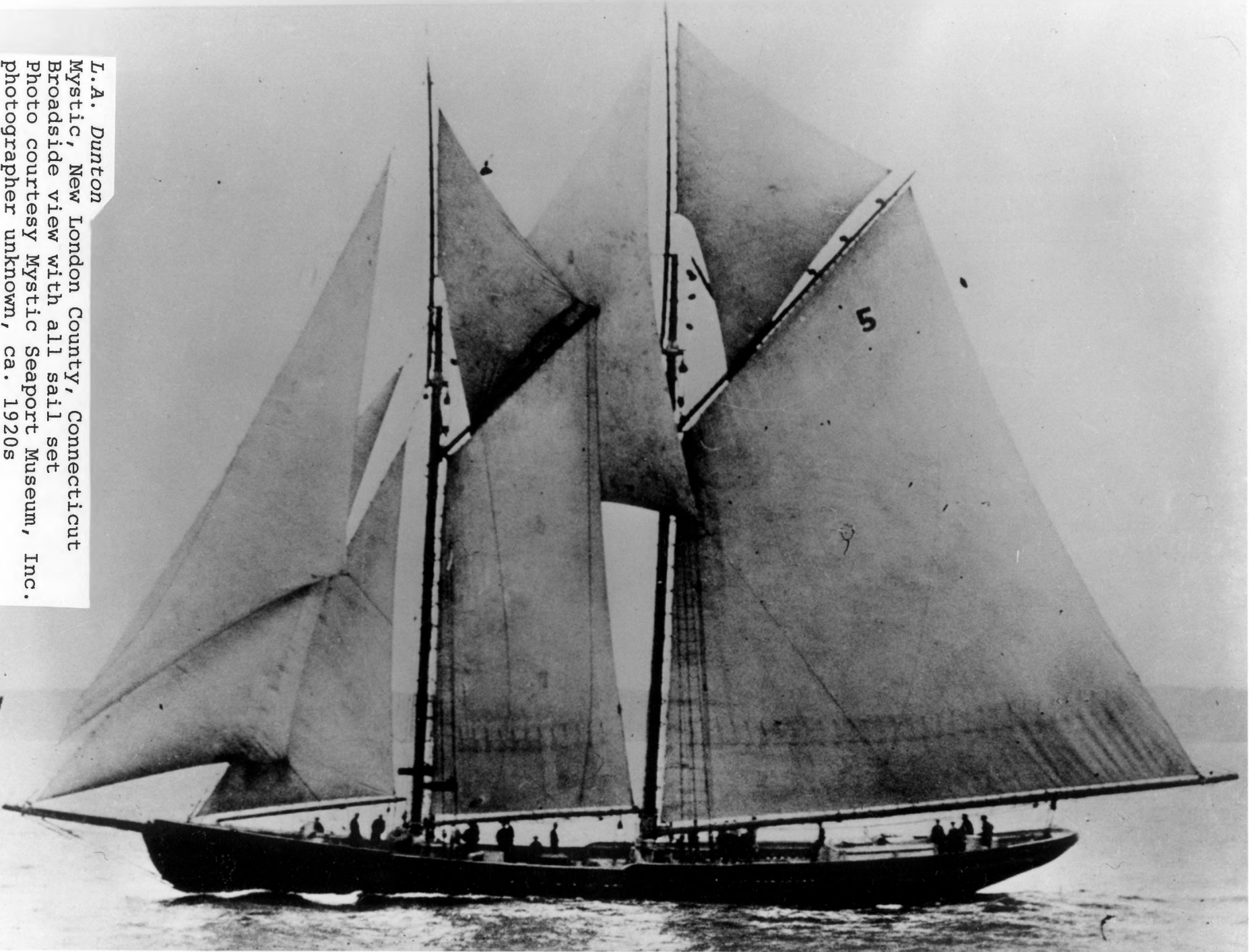
L.A. Dunton Mystic, New London County, Connecticut Broadside view with all sail set Photo courtesy Mystic Seaport Museum, Inc. photographer unknown, ca. 1920s Photo # 2