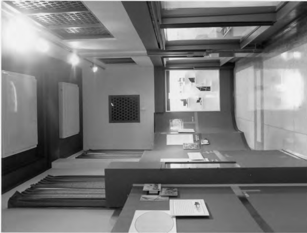
6. Conway Post Office Conway, Horry County, S.C.