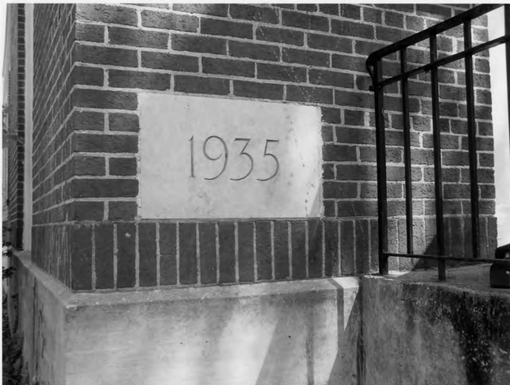
5. Conway Post Office Conway, Horry County, S.C.