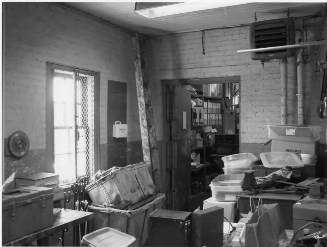
7. Conway Post Office Conway, Horry County, S.C.