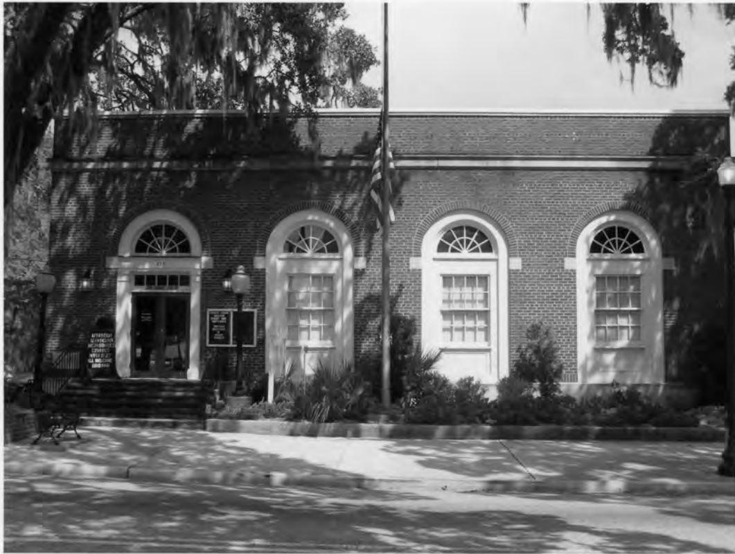
2. Conway Post Office Conway, Horry County, S.C.