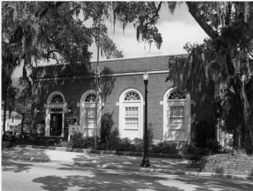
1. Conway Post Office Conway, Horry County, S.C.