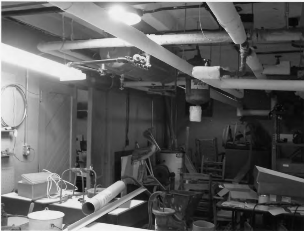
8. Conway Post Office Conway, Horry County, S.C.