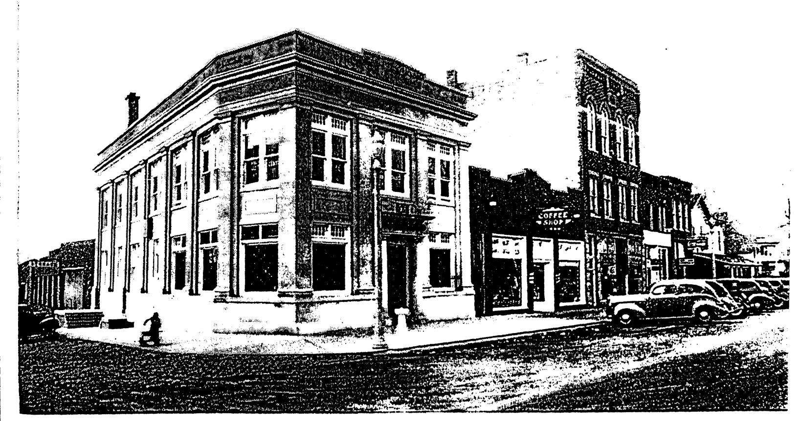
STATE EXCHANGE BANK BLOCK, ARGOS, IND.

ARGOS DOWNTOWN HISTORIC DISTRICT Marshall County, IN West side, 100 block North Michigan St. c. 1920