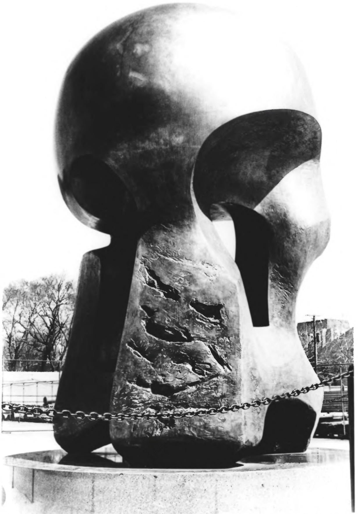
"NUCLEAR ENERGY", BY HENRY MOORE, COMMEMORATING THE 25TH ANNIVERSARY OF THE FIRST CONTROLLED NUCLEAR CHAIN REACTION AT THE UNIVERSITY OF CHICAGO.