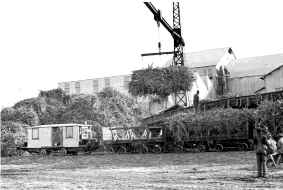
Figure 5: Unloading sugar cane from railroad cars, Fellsmere Sugar Mill, 1937.

FRANK AND STELLA HEISER HOUSE FELLSMERE, INDIAN RIVER COUNTY GEOGRAPHICAL DATA