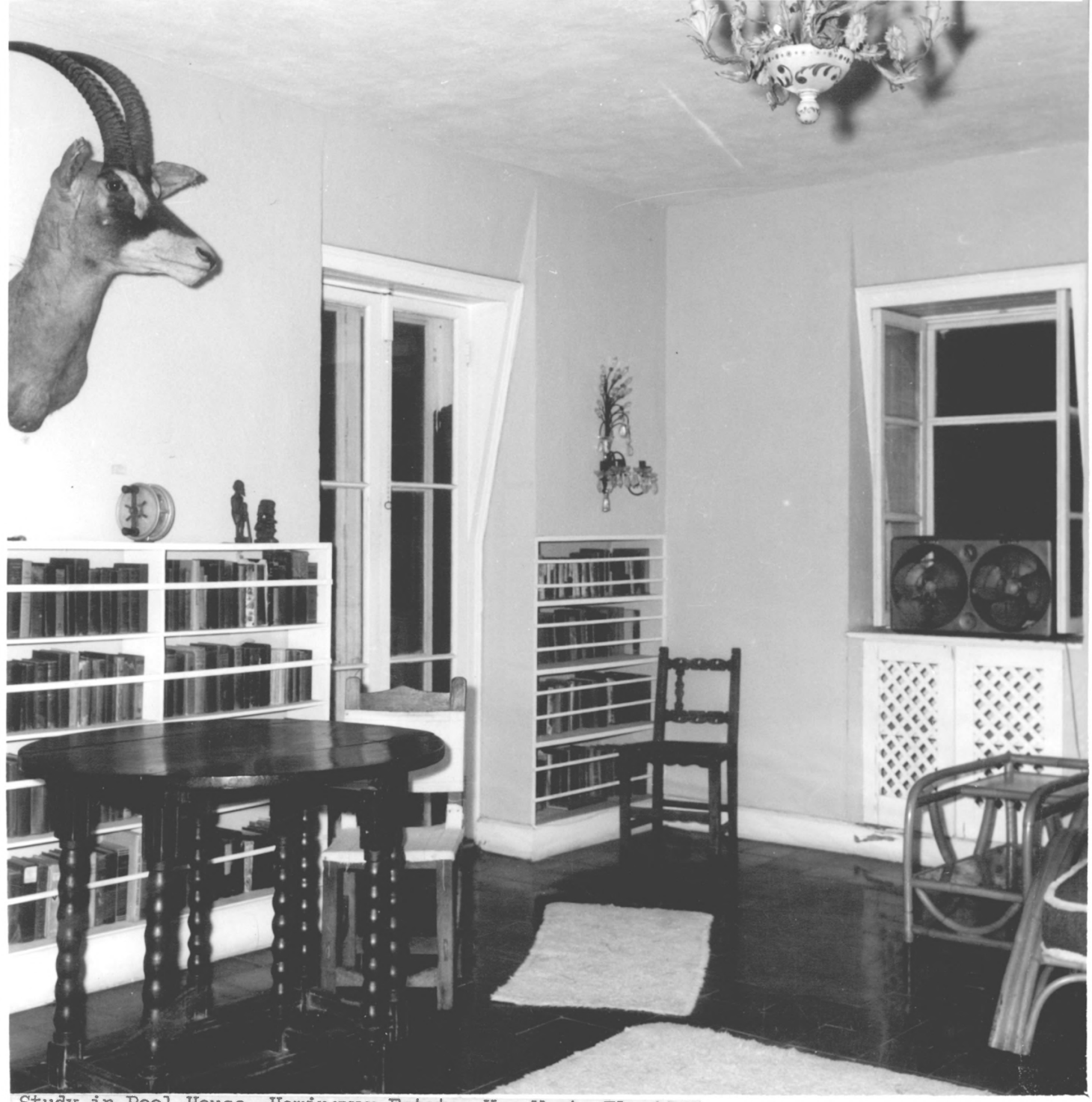
Study in Pool House, Hemingway Estate, Key West, Florida