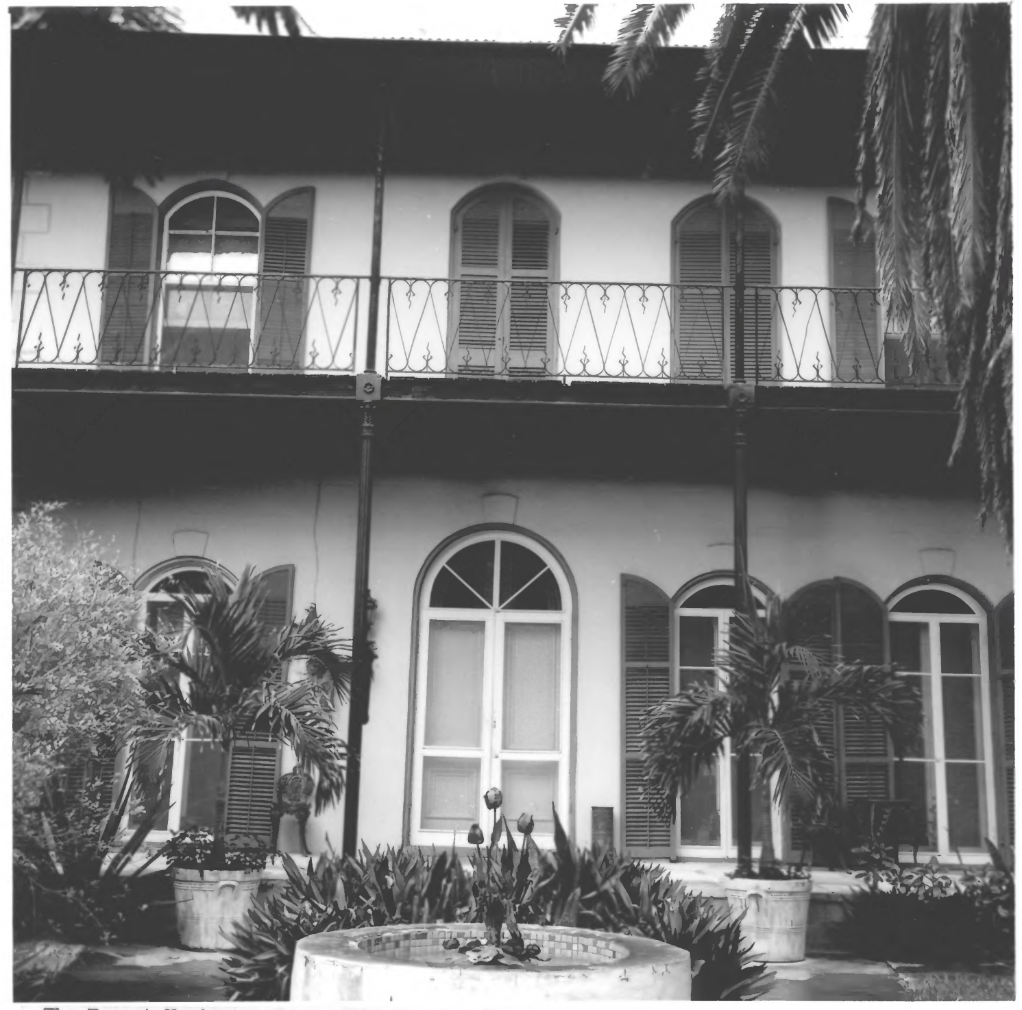
The Ernest Hemingway House, Key West, Entrance