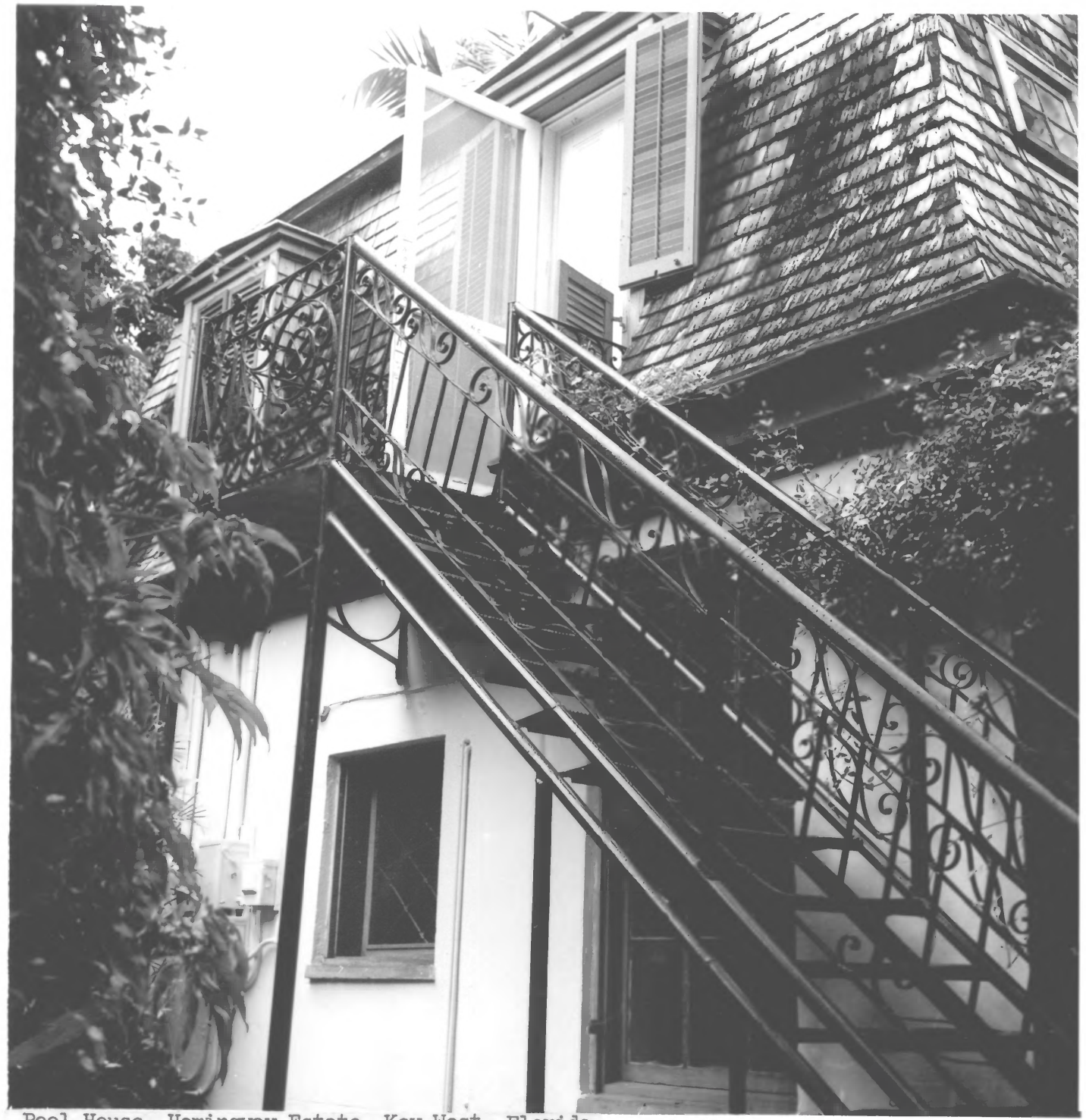
Pool House, Hemingway Estate, Key West, Florida