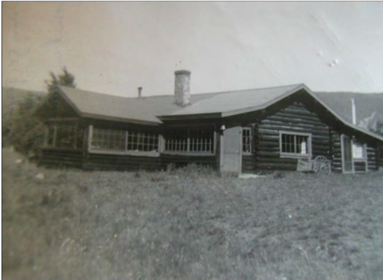
The Itter/Savage Cabin, ca. 1950.

Section number Maps and Additional Documentation Page 36