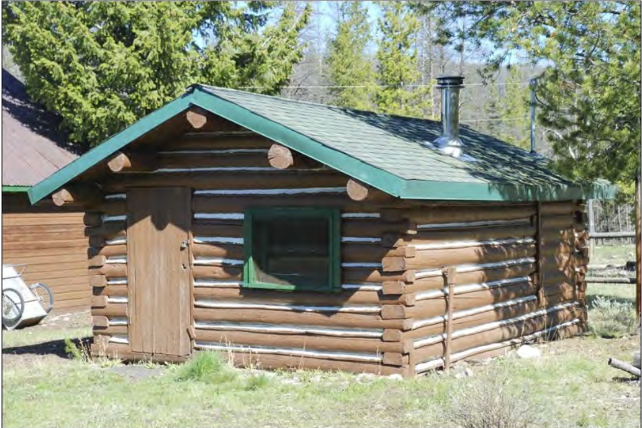
Photo MT_GraniteCounty_MooseLakeCampHD_#0013: The Moose Lake Camp Historic District. Studio. Front (south) and east side. View to the north-northeast. Photo date: May 2017.

Section number National Register Photographs Page 50