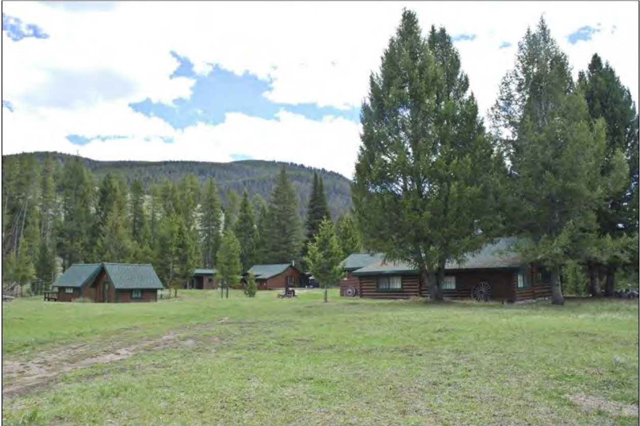
Photo MT_GraniteCounty_MooseLakeCampHD_#0002: The Moose Lake Camp Historic District. Overview. View to the east-southeast. Photo date: May 2017.

Section number National Register Photographs Page 39