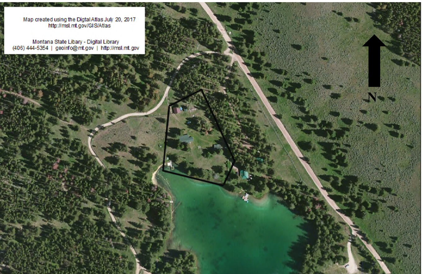
Aerial Photograph of the Moose Lake Camp Historic District.

Section number Maps and Additional Documentation Page 28