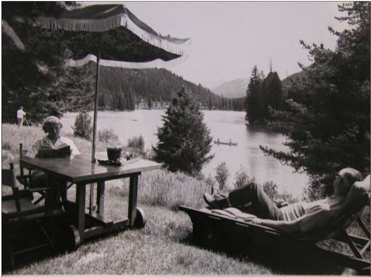
Idyll at the Moose Lake Camp Historic District, 1960s.

Section number Maps and Additional Documentation Page 37