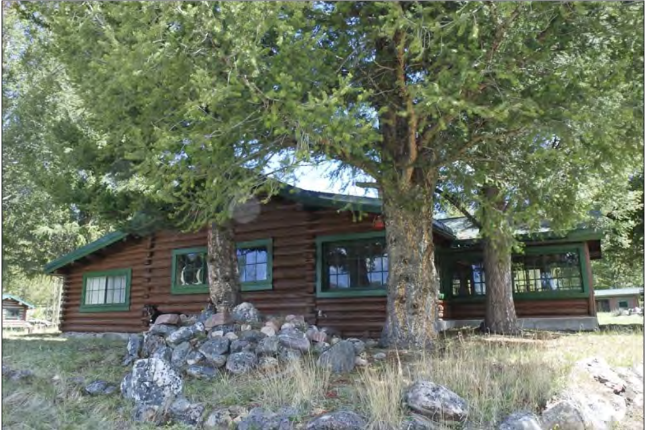
Photo MT_GraniteCounty_MooseLakeCampHD_#0007: The Moose Lake Camp Historic District. Itter/Savage Cabin. West side. View to the east. Photo date: May 2017.

Section number National Register Photographs Page 44