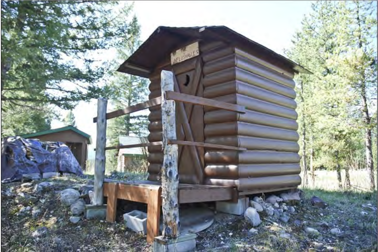
Photo MT_GraniteCounty_MooseLakeCampHD_#0008: The Moose Lake Camp Historic District. Outhouse. North and east side. View to the southwest. Photo date: May 2017.

Section number National Register Photographs Page 45