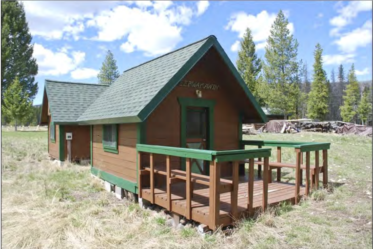
Photo MT_GraniteCounty_MooseLakeCampHD_#0011: The Moose Lake Camp Historic District. Sleeping (Maid's) Cabin 1. Front (east) and south side. View to the northwest. Photo date: May 2017.

Section number National Register Photographs Page 48