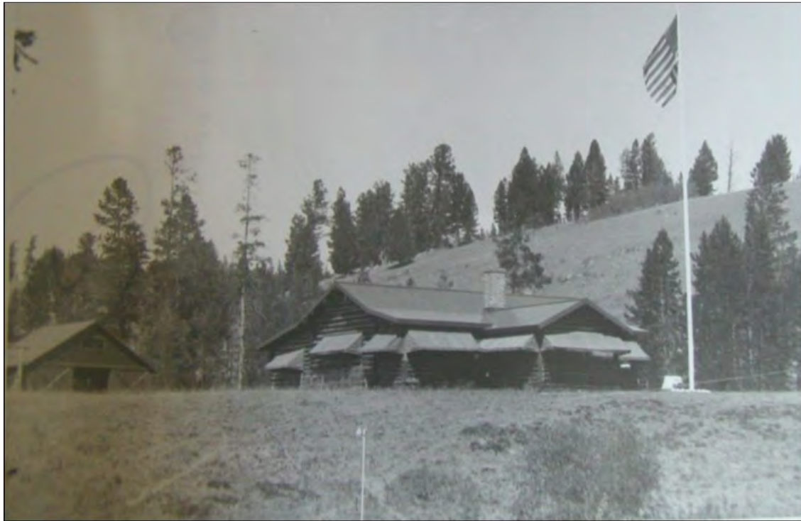
The Itter/Savage Cabin with Barn on left, ca. 1936.

Section number Maps and Additional Documentation Page 35