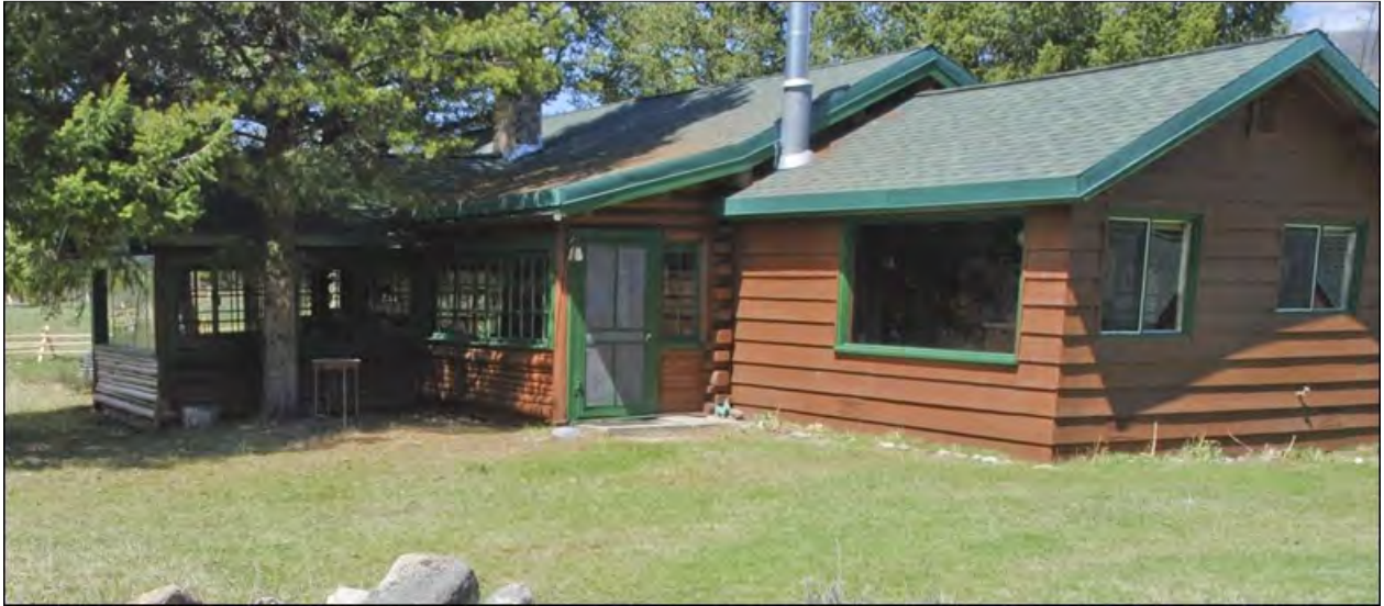
Photo MT_GraniteCounty_MooseLakeCampHD_#0003: The Moose Lake Camp Historic District. Itter/Savage Cabin. Front (south) and east addition. View to northwest. Photo date: May 2017.

Section number National Register Photographs Page 40