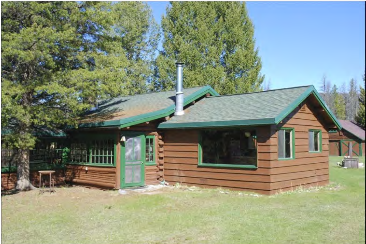
Photo MT_GraniteCounty_MooseLakeCampHD_#0004: The Moose Lake Camp Historic District. Itter/Savage Cabin. Front (south) and east side. View to northwest. Photo date: May 2017.

Section number National Register Photographs Page 41