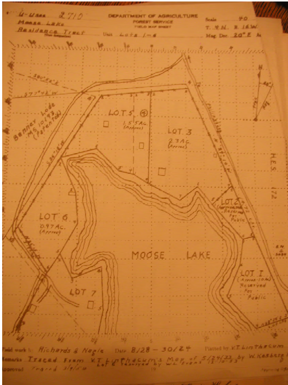
Department of Agriculture, Forest Service Field Map Showing the Moose Lake Residence Tract, Lots 1-5. From the V.T. Linthacum Map of 5/24/1933 (March 9, 1954).

Section number Maps and Additional Documentation Page 30