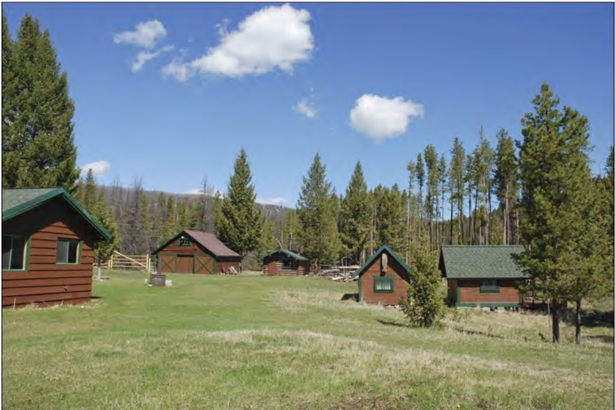
Photo MT_GraniteCounty_MooseLakeCampHD_#0001: The Moose Lake Camp Historic District. Overview. View to the north-northwest. Photo date: May 2017.

Section number National Register Photographs Page 38