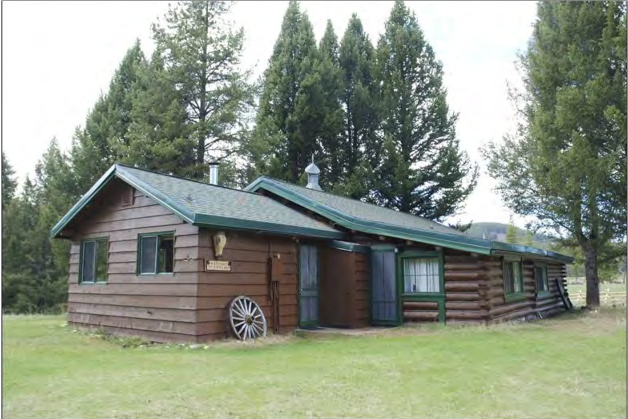
Photo MT_GraniteCounty_MooseLakeCampHD_#0005: The Moose Lake Camp Historic District. Itter/Savage Cabin. East and rear (north) sides. View to southwest. Photo date: May 2017.

Section number National Register Photographs Page 42