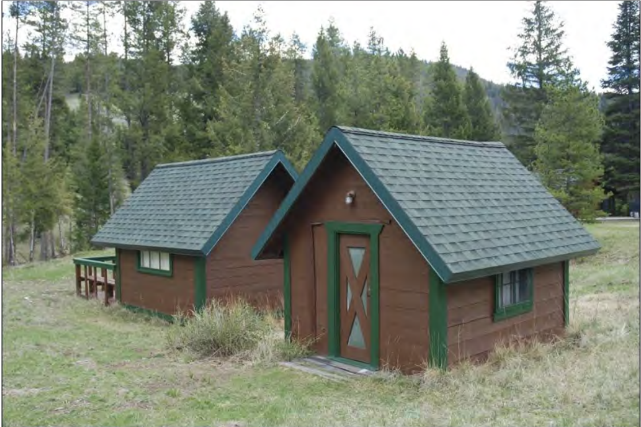
Photo MT_GraniteCounty_MooseLakeCampHD_#0012: The Moose Lake Camp Historic District. Sleeping (Maid's) Cabin 2. Front (north) and west side. View to the southeast. Photo date: May 2017.

Section number National Register Photographs Page 49