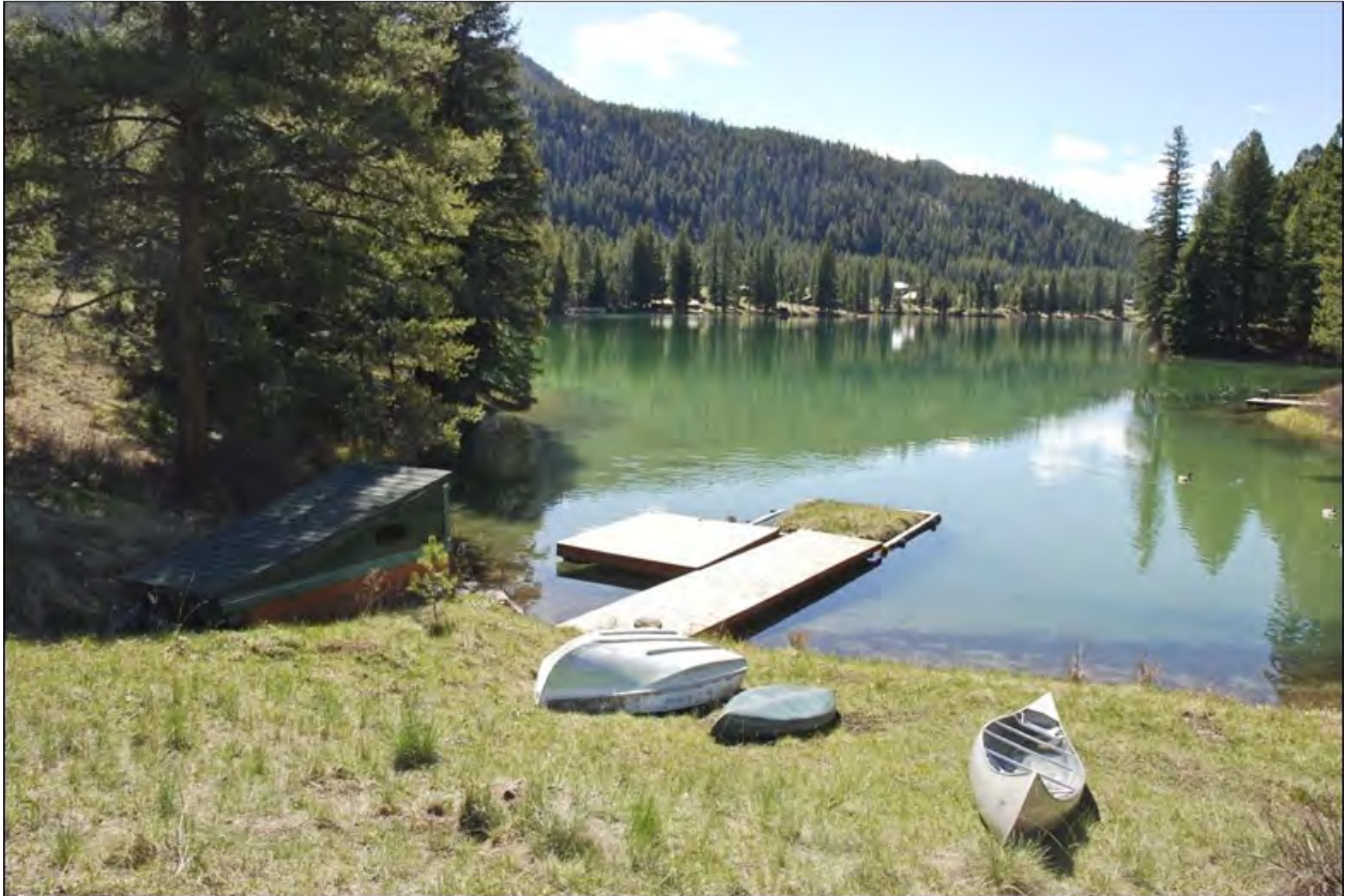
Photo MT_GraniteCounty_MooseLakeCampHD_#0018: The Moose Lake Camp Historic District. Dock. View to the south. Photo date: May 2017.

Section number National Register Photographs Page 55