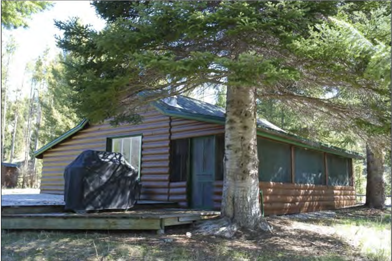
Photo MT_GraniteCounty_MooseLakeCampHD_#0010: The Moose Lake Camp Historic District. Cookhouse. South (rear) and west sides. View to the east. Photo date: May 2017.

Section number National Register Photographs Page 47