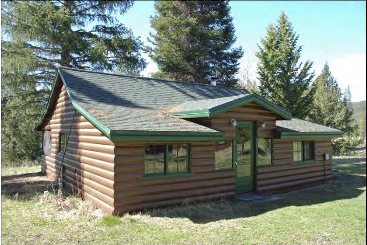
Photo MT_GraniteCounty_MooseLakeCampHD_#0009: The Moose Lake Camp Historic District. Cookhouse. Front (north) and east side. View to the southwest. Photo date: May 2017.

Section number National Register Photographs Page 46