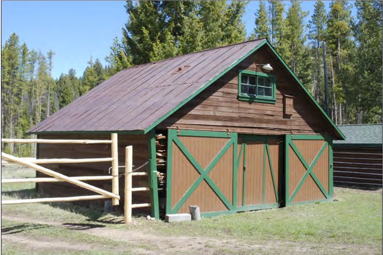
Photo MT_GraniteCounty_MooseLakeCampHD_#0014: The Moose Lake Camp Historic District. Barn/Garage. Front (south) and west side. View to the northeast. Photo date: May 2017.

Section number National Register Photographs Page 51