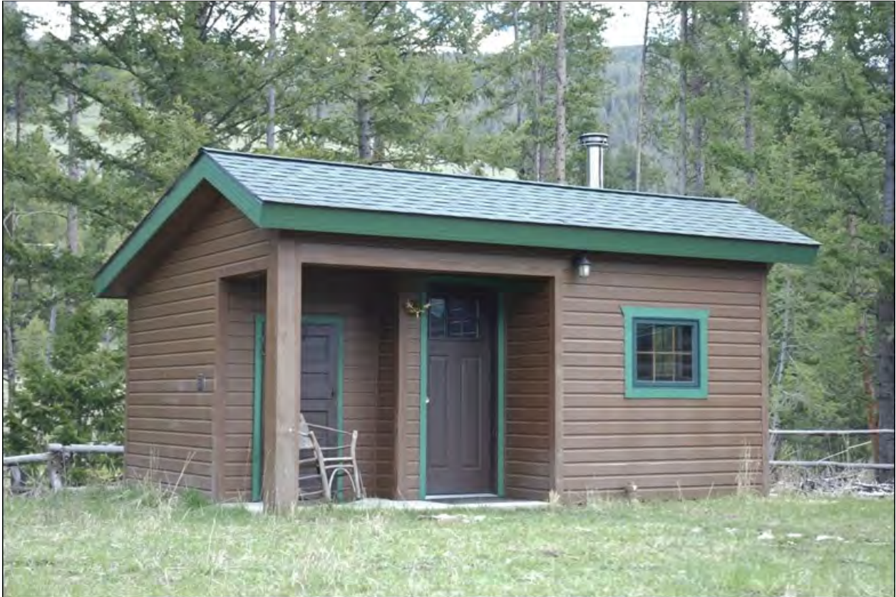
Photo MT_GraniteCounty_MooseLakeCampHD_#0016: The Moose Lake Camp Historic District. Icehouse/Woodshed. Front (west) and north side. View to the east. Photo date: May 2017.

Section number National Register Photographs Page 53