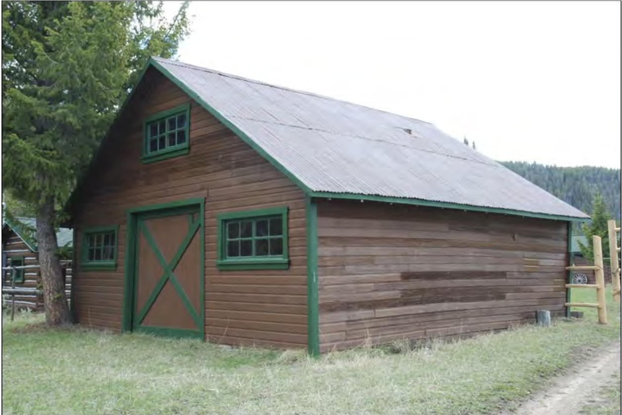
Photo MT_GraniteCounty_MooseLakeCampHD_#0015: The Moose Lake Camp Historic District. Barn/Garage. Rear (north) and west side. View to the southeast. Photo date: May 2017.

Section number National Register Photographs Page 52