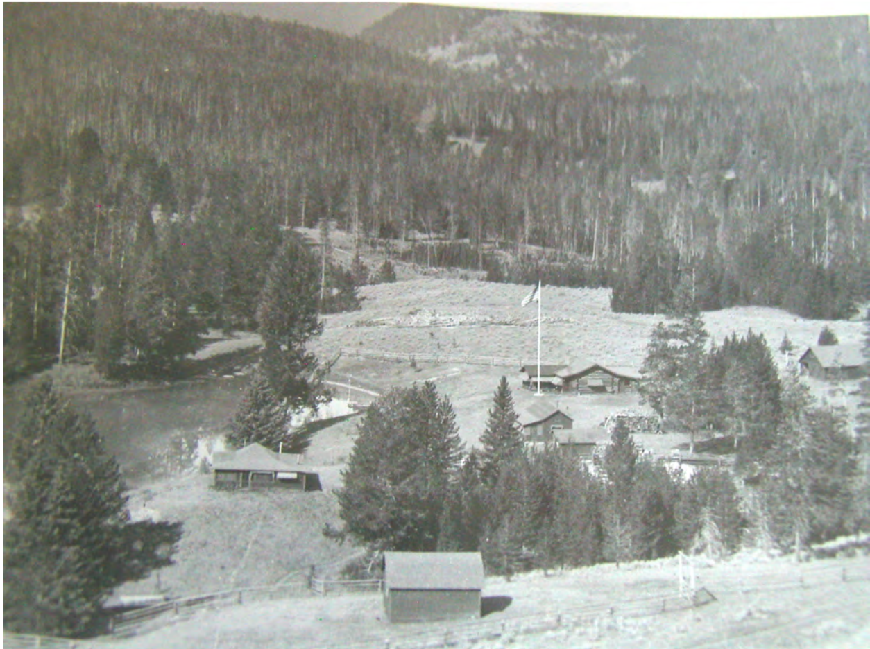
Moose Lake Camp overview, view to west, circa 1930.

Section number Maps and Additional Documentation Page 34