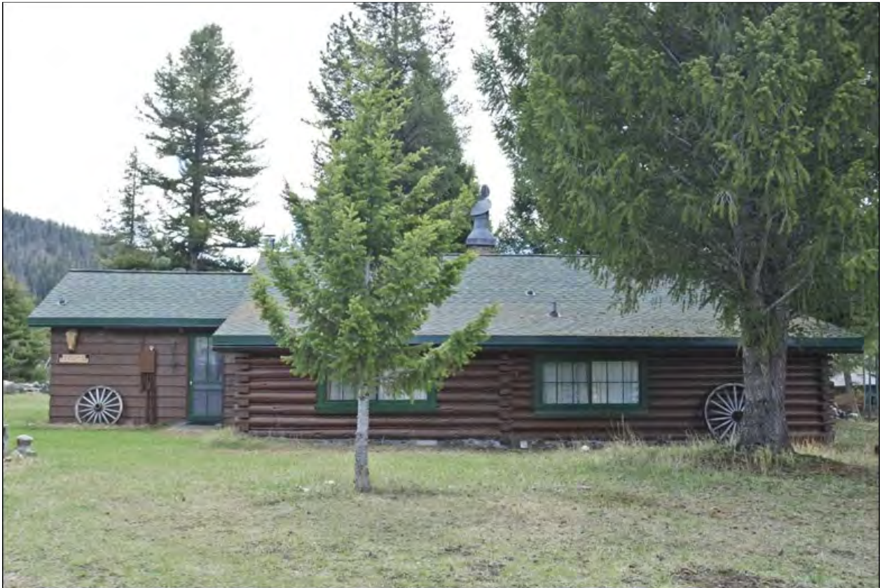
Photo MT_GraniteCounty_MooseLakeCampHD_#0006: The Moose Lake Camp Historic District. Itter/Savage Cabin. Rear (north) side. View to the south. Photo date: May 2017.

Section number National Register Photographs Page 43