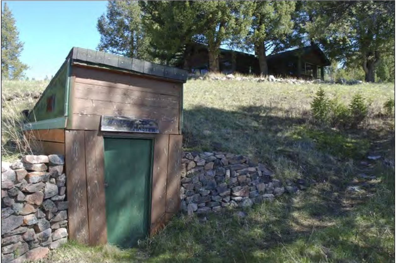
Photo MT_GraniteCounty_MooseLakeCampHD_#0017: The Moose Lake Camp Historic District. Pumphouse. View to the north. Photo date: May 2017.

Section number National Register Photographs Page 54