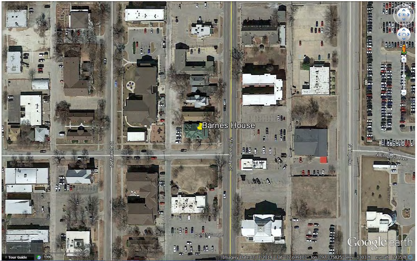
Figure 2: Close-in Aerial Image, Google Earth 2015