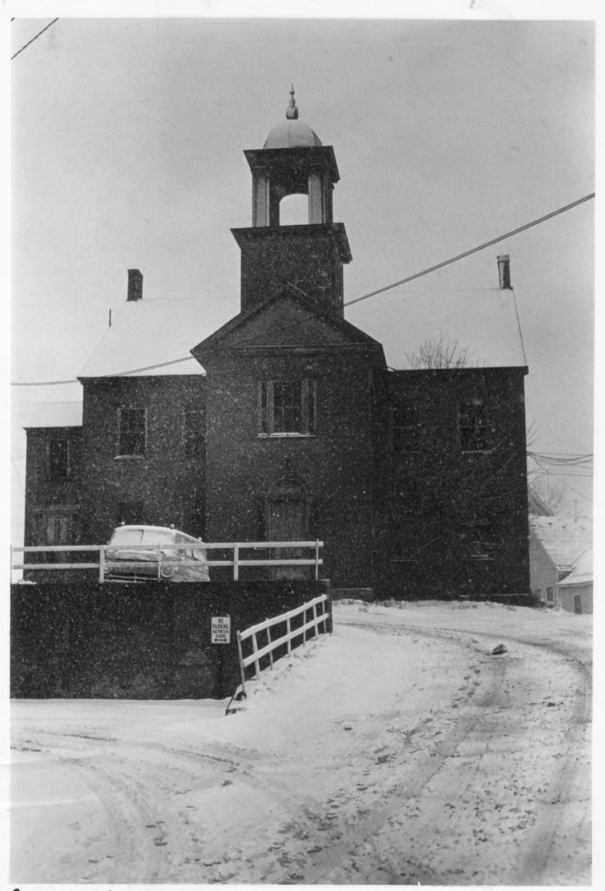
SULLIVAN CO. COURTHOUSE JAN 1973 WEST ELEVATION