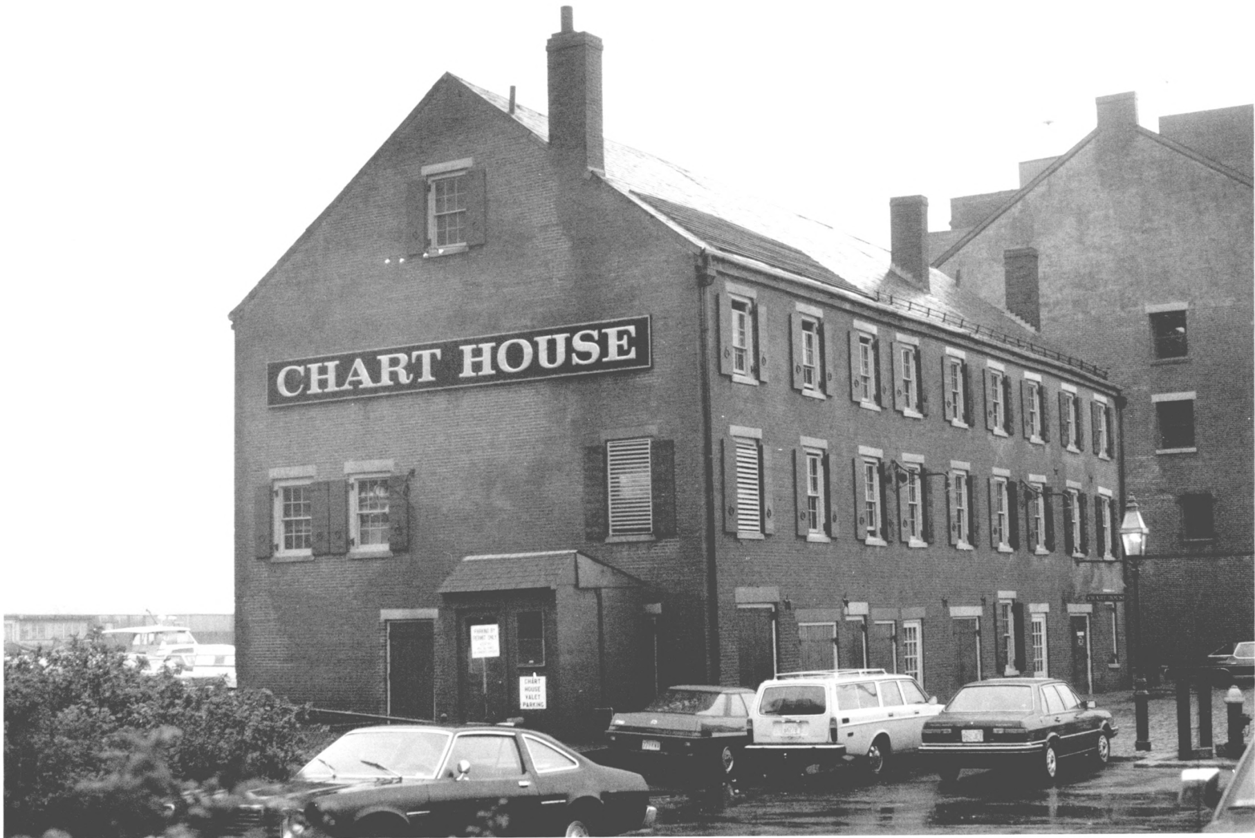
LONG WHARF & CUSTOM HOUSE BLOCK SUFFOLK, MA