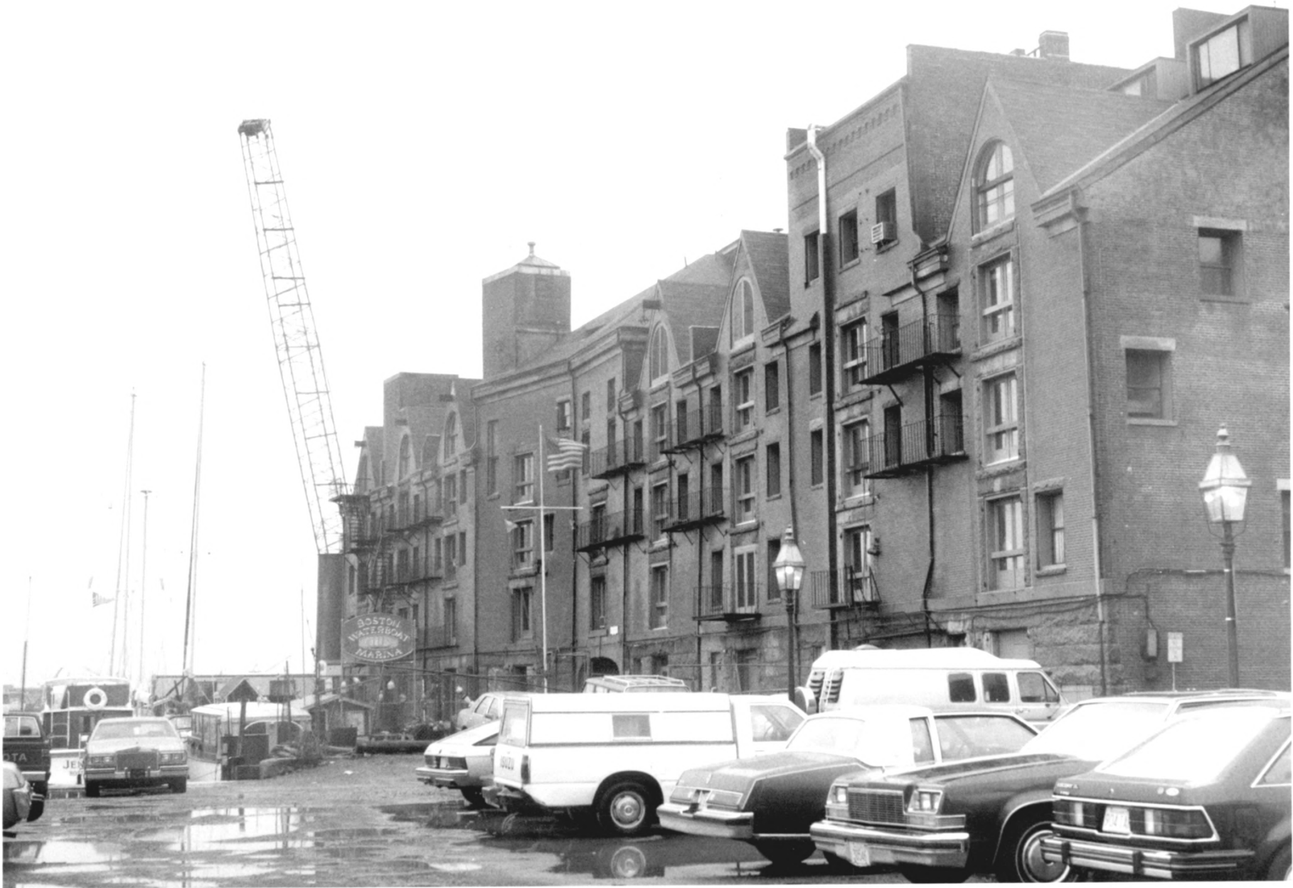
LONG WHARF & CUSTOM HOUSE BLOCK SUFFOLK, MA