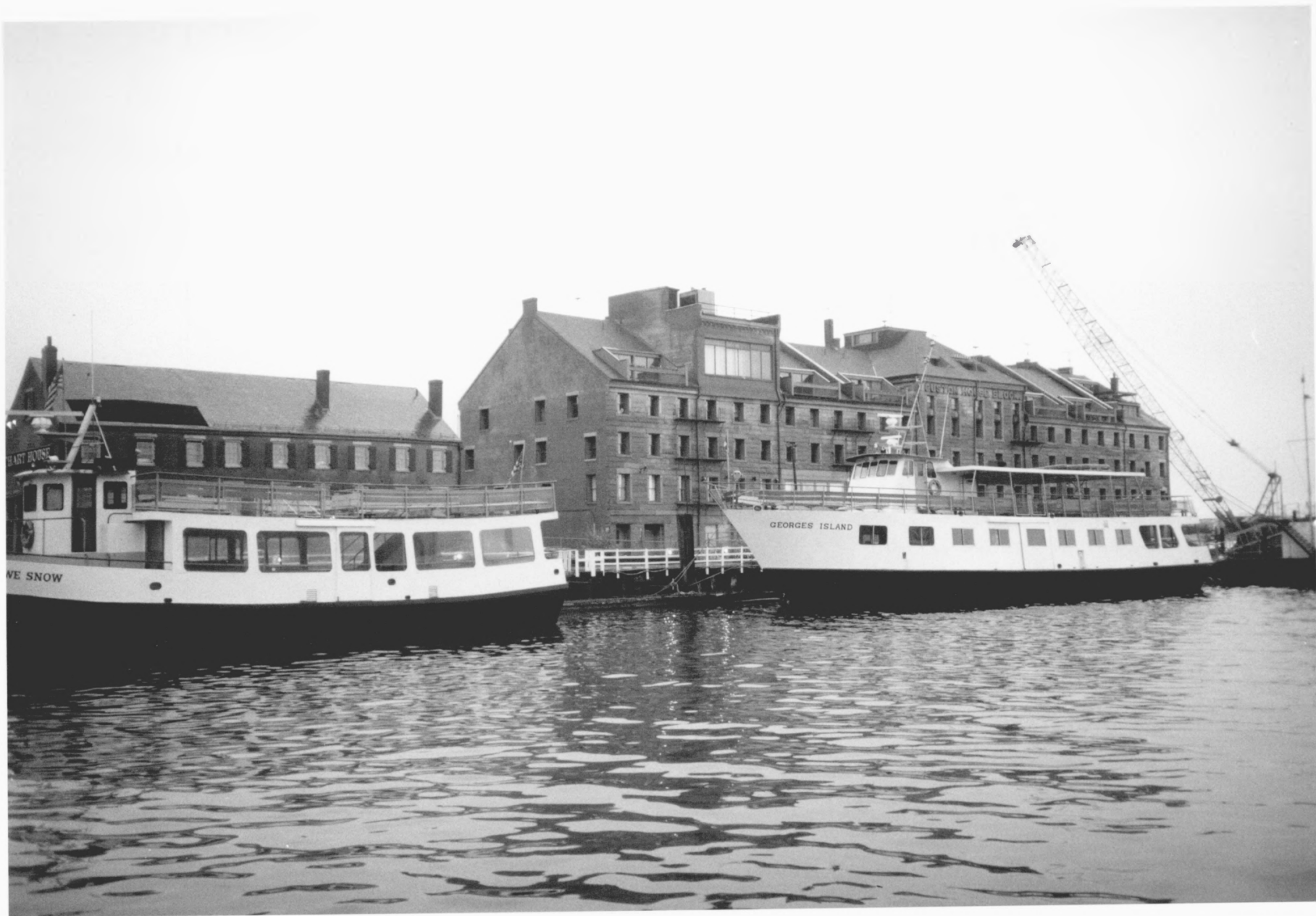
LONG WHARF & CUSTOM HOUSE BLOCK SUFFOLK, MA #1.