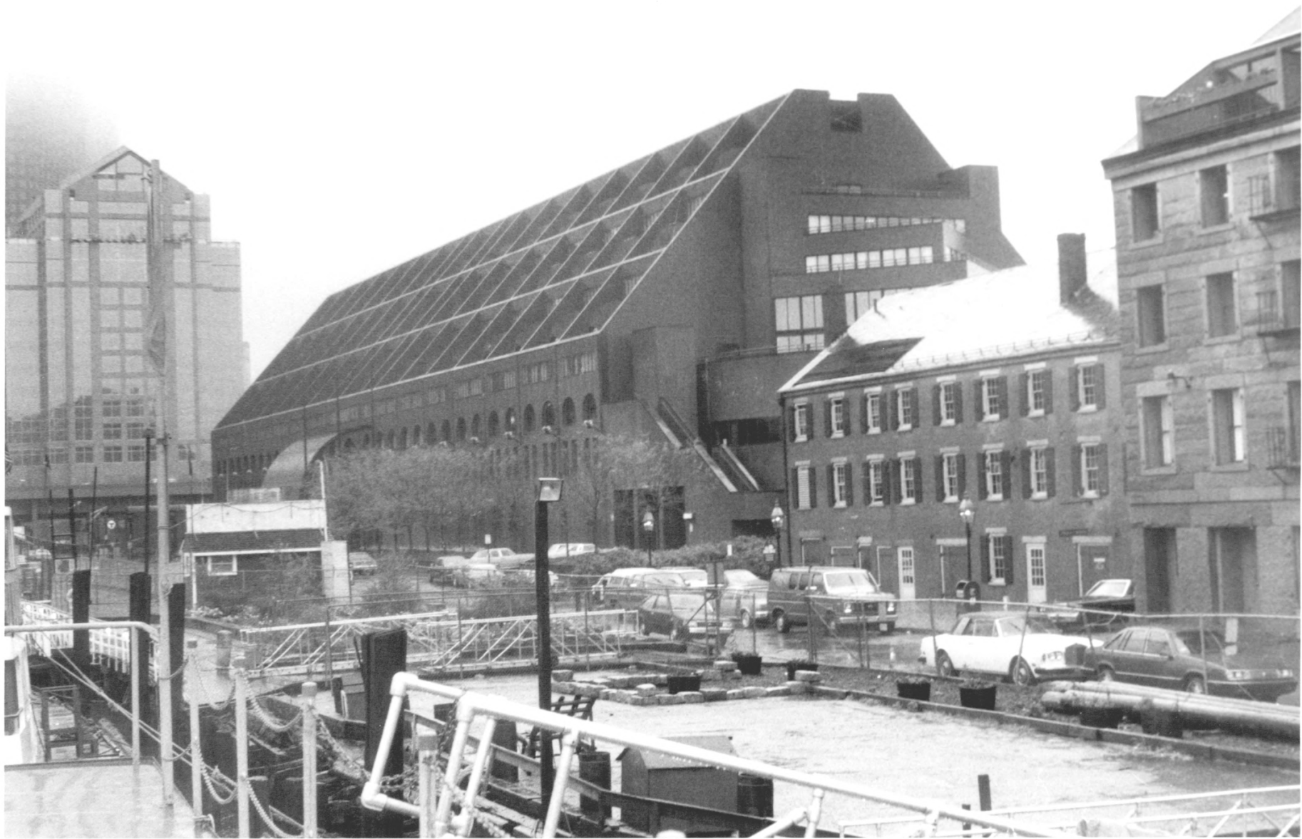
LONG WHARF & CUSTOM HOUSE BLOCK #9 SUFFOLK, MA