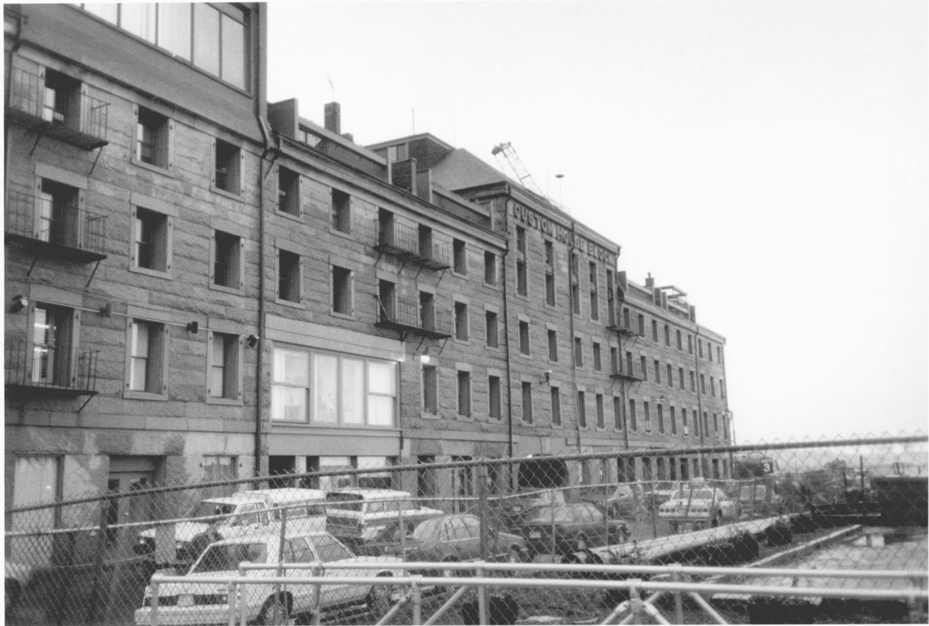
LONG WHARF & CUSTOM HOUSE BLOCK SUFFOLK, MA. #2.