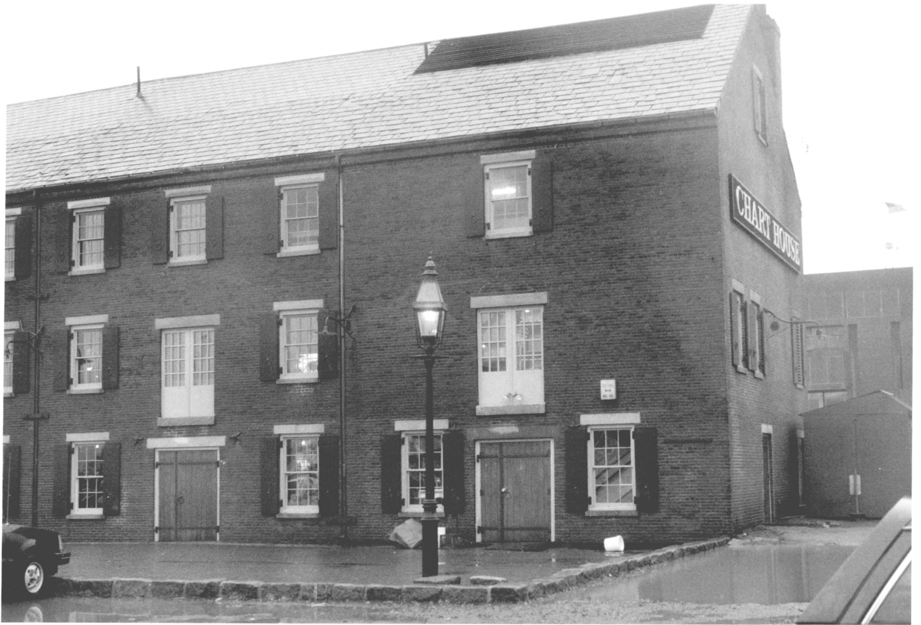
LONG WHARF & CUSTOM HOUSE BLOCK SUFFOLK, MA #8.