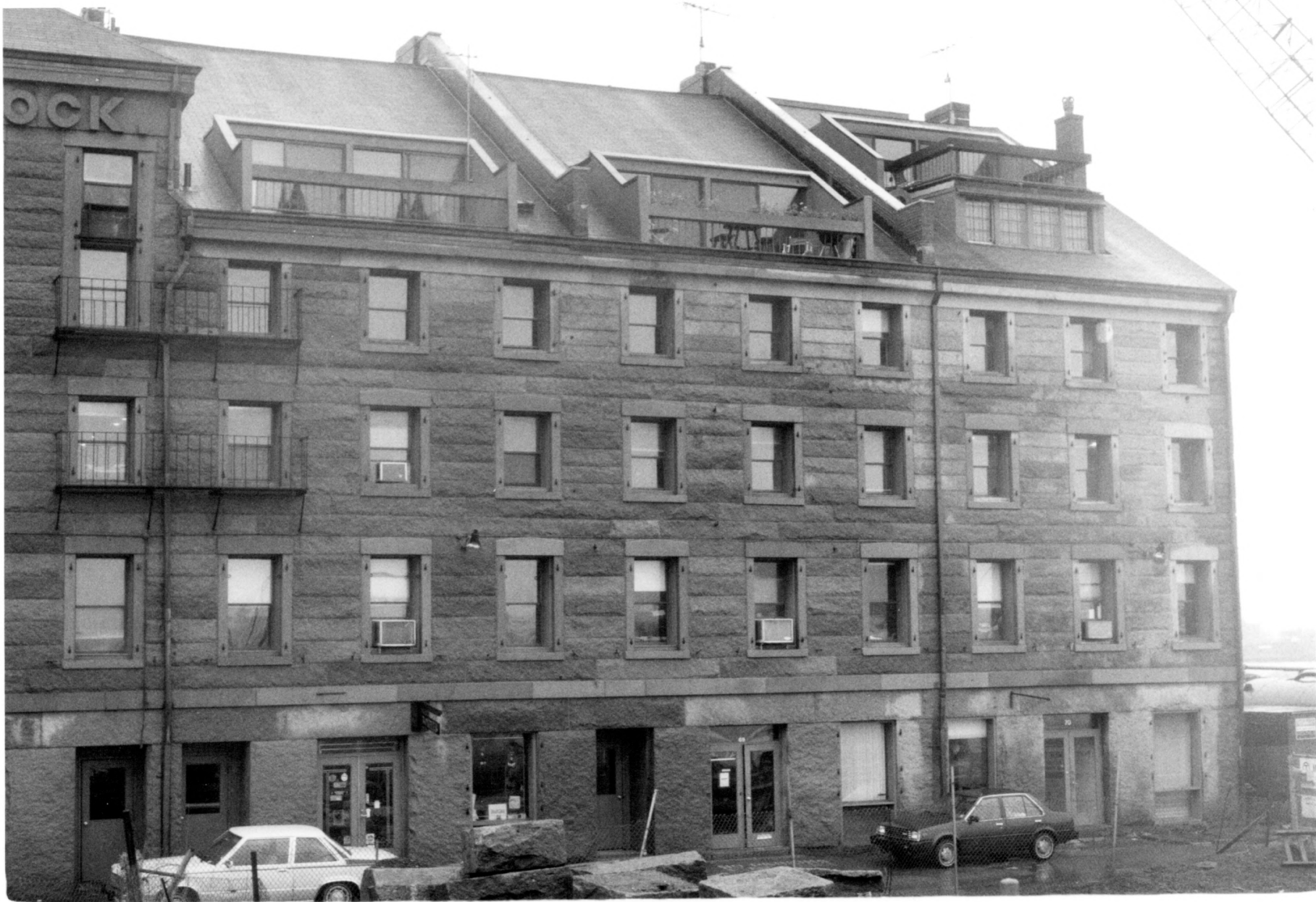
LONG WHARF & CUSTOM HOUSE BLOCK SUFFOLK, MA #4.