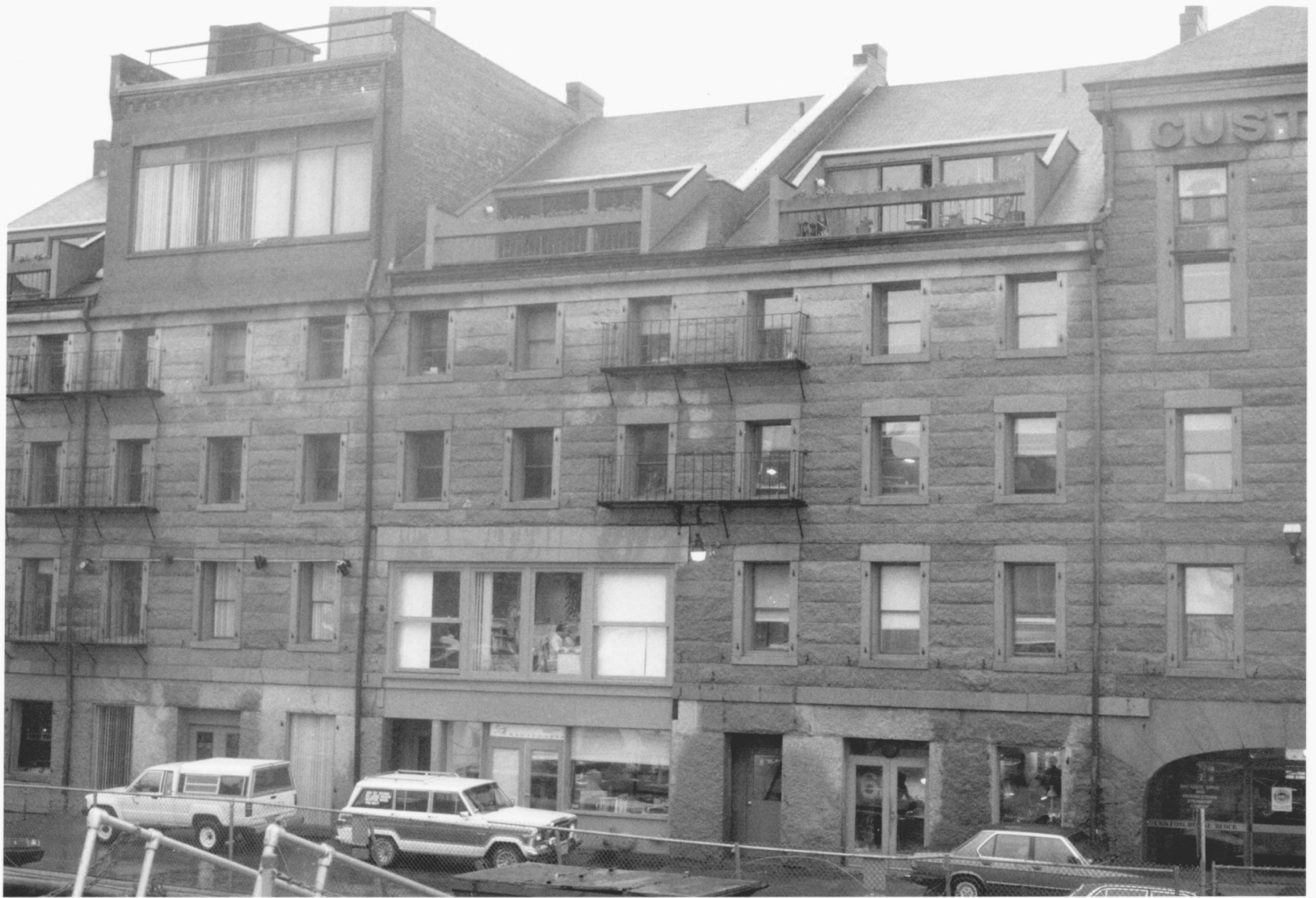
LONG WHARF & CUSTOM HOUSE BLOCK SUFFOLK, MA #3.