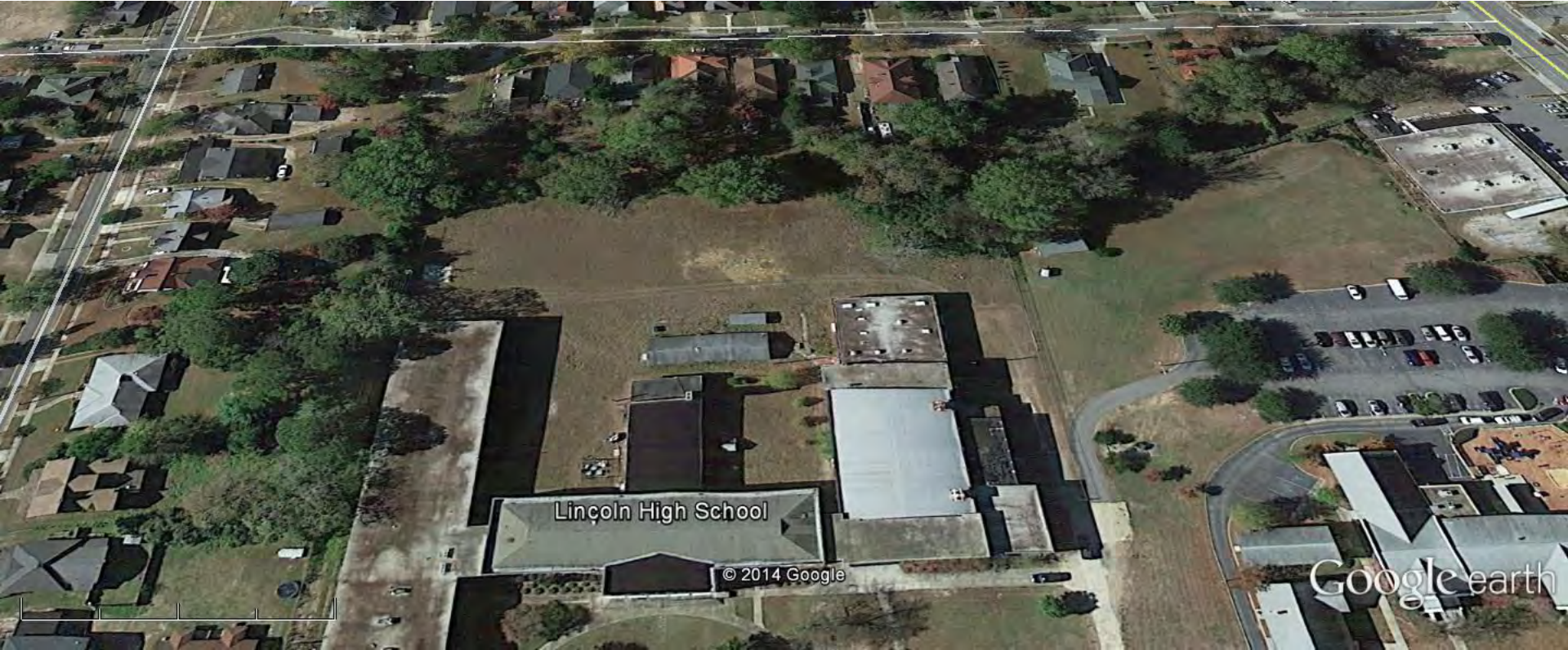
Lincoln High School 33.918640, -80.347564