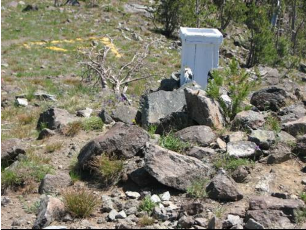
ID_IdahoCounty_Salmon Mountain Lookout_0011. Looking east to the small wooden box containing a rain gauge.

Paperwork Reduction Act Statement: This information is being collected for applications to the National Register of Historic Places to nominate properties for listing or determine eligibility for listing, to list properties, and to amend existing listings. Response to this request is required to obtain a benefit in accordance with the National Historic Preservation Act, as amended (16 U.S.C.460 et seq.).