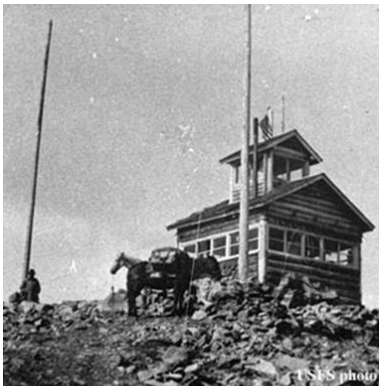
Figure 2. 1928 log cupola lookout on Salmon Mountain.

The log cupola lookout stood atop Salmon Mountain for the next two decades. In 1949 however, just before the regional office instituted the lookout replacement program, the original Salmon Mountain lookout was removed and replaced with a 1936-pattern L-4 lookout. It appears that the new lookout was constructed on the same “substantial stone terrace” described by Koch in 1920. Two men built the new lookout: carpenter Champ Hannon and rock mason Stan Greenup. The total cost of construction came to $3,981.60. 4