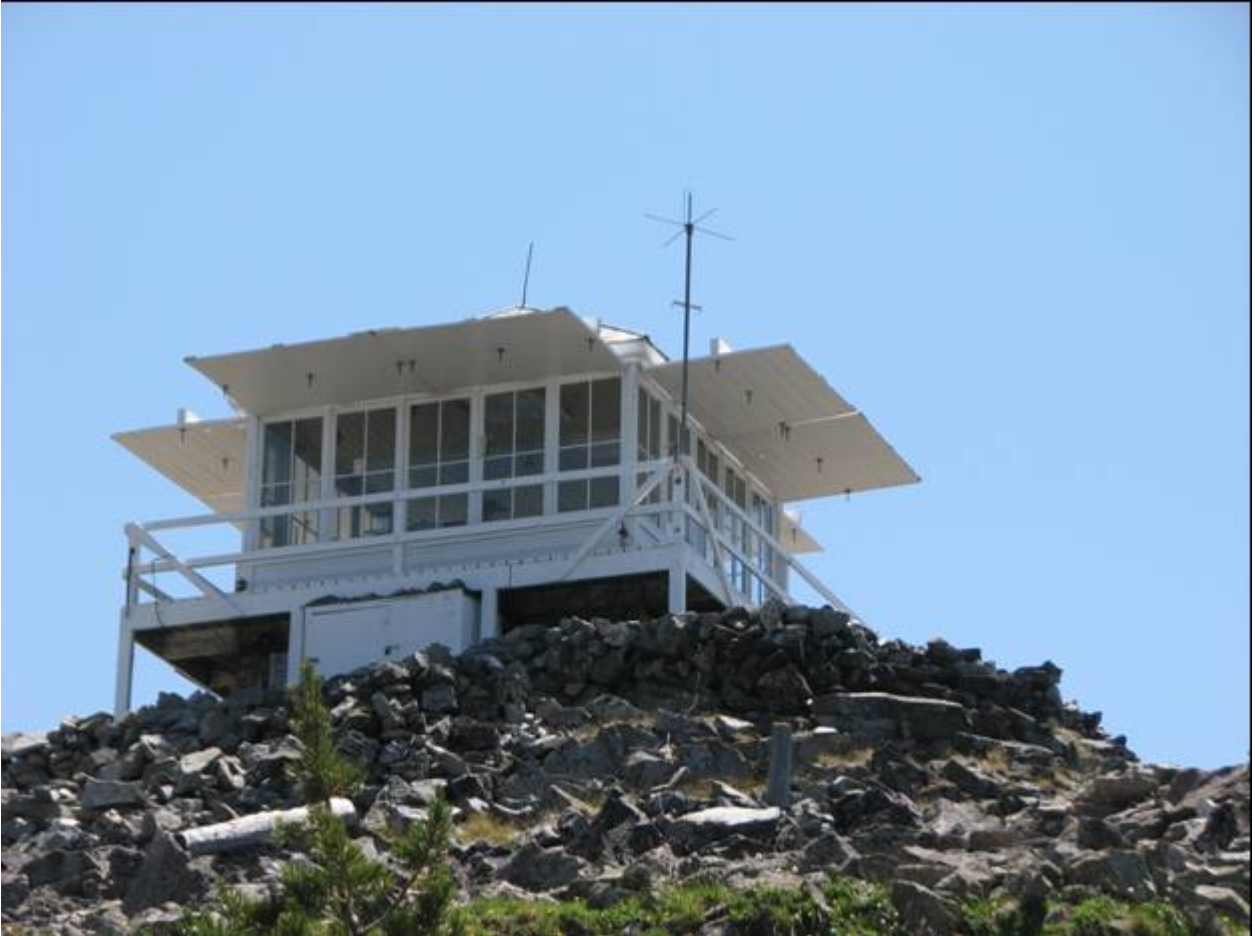
ID_IdahoCounty_Salmon Mountain Lookout_0002. Lookout and storage shed, looking south to the north and west walls of the lookout.