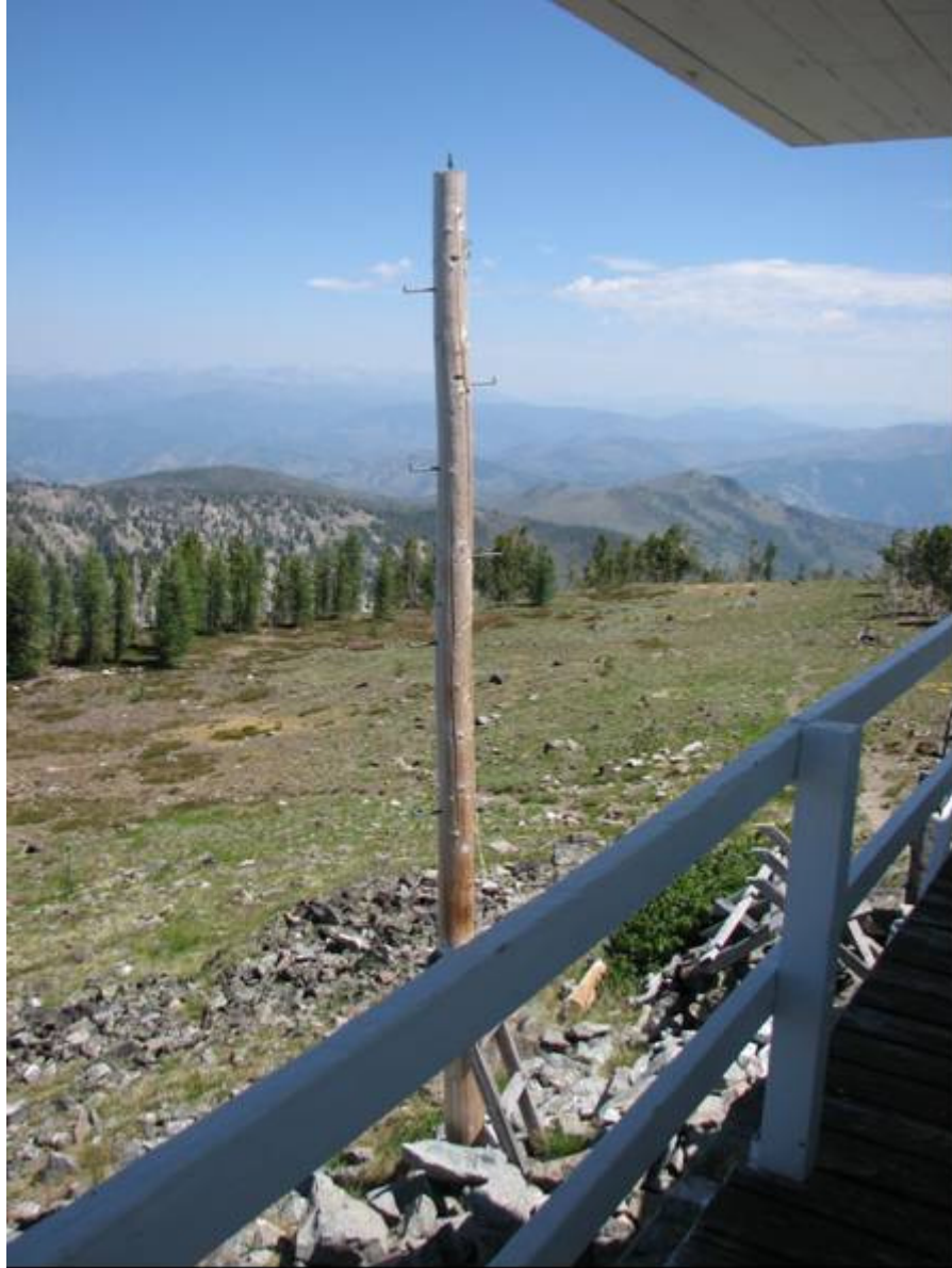
ID_IdahoCounty_Salmon Mountain Lookout_0010. Looking east-northeast to the flagpole adjacent to the northwest corner of the lookout.