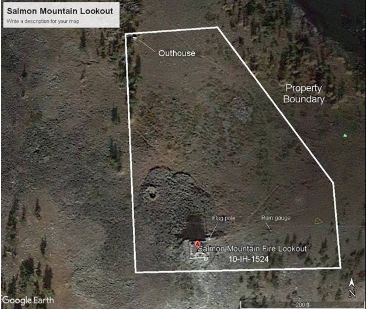
2014 Google Earth image of the Salmon Mountain Lookout site.