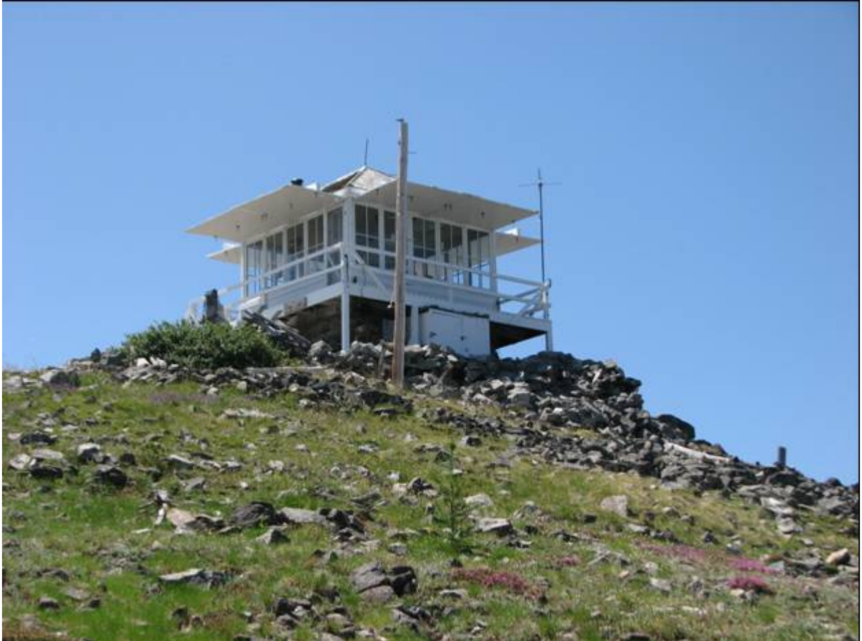
ID_IdahoCounty_Salmon Mountain Lookout_0001. Lookout and storage shed, looking southwest to the east (front) and north walls of the lookout.