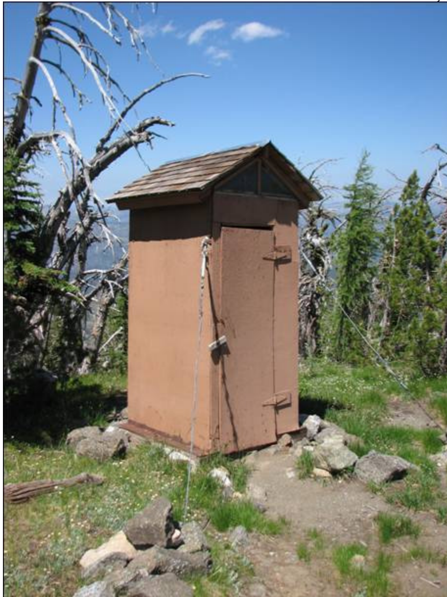
ID_IdahoCounty_Salmon Mountain Lookout_0008. Looking northwest to the south and east (front) walls of the outhouse.