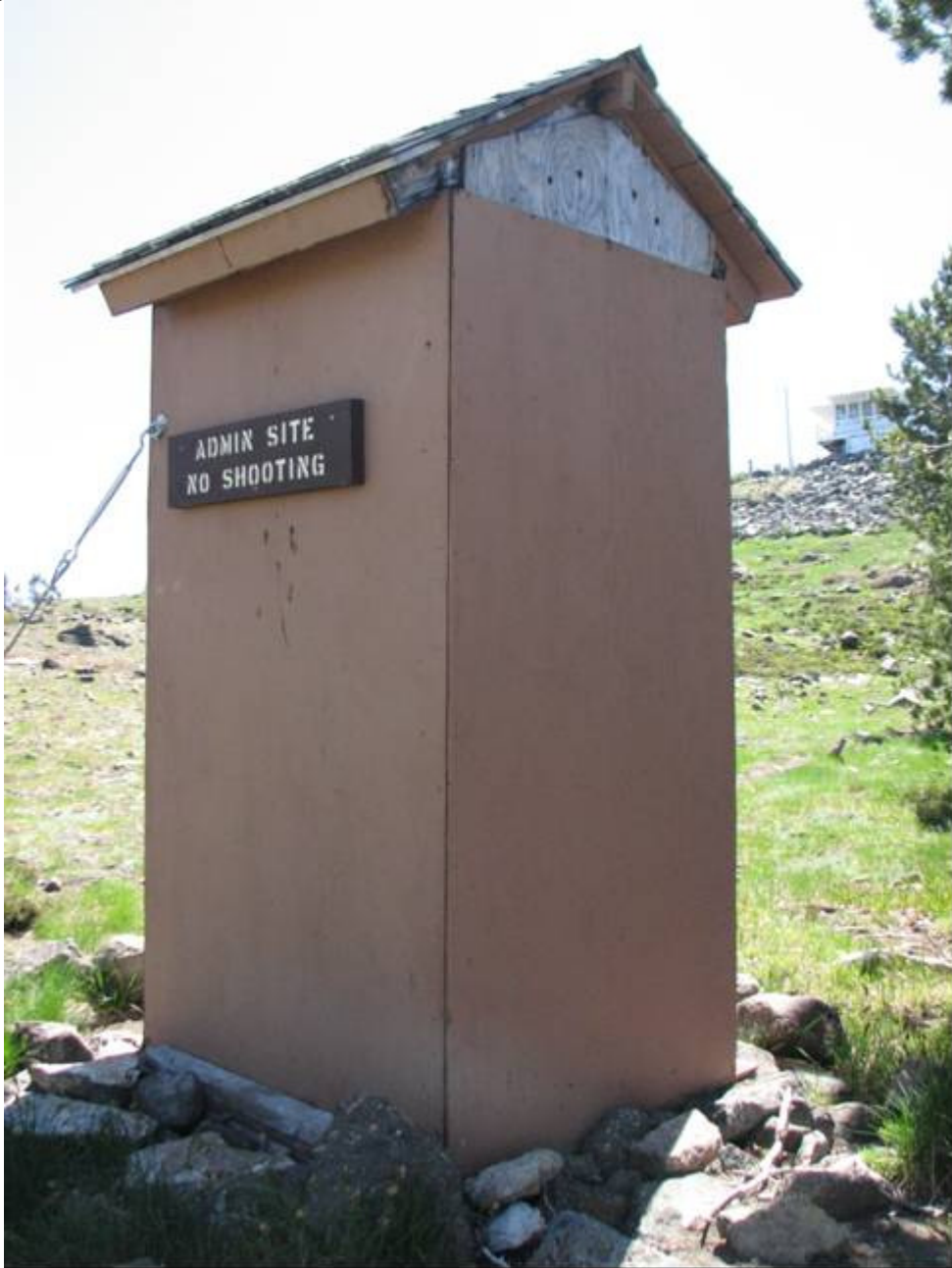
ID_IdahoCounty_Salmon Mountain Lookout_0009. Looking southeast to the north and west (rear) walls of the outhouse.