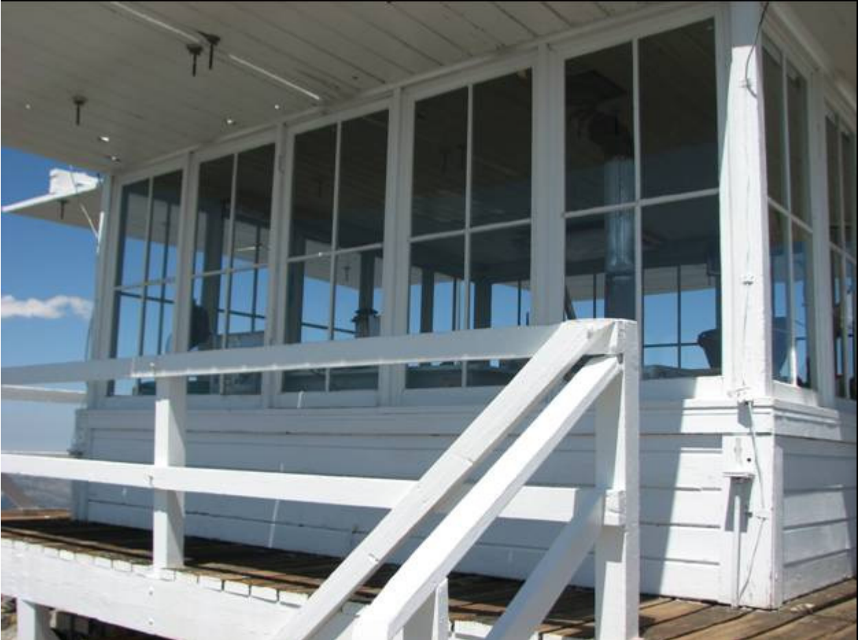
ID_IdahoCounty_Salmon Mountain Lookout_0003. Lookout, looking east-northeast to the south wall of the lookout.