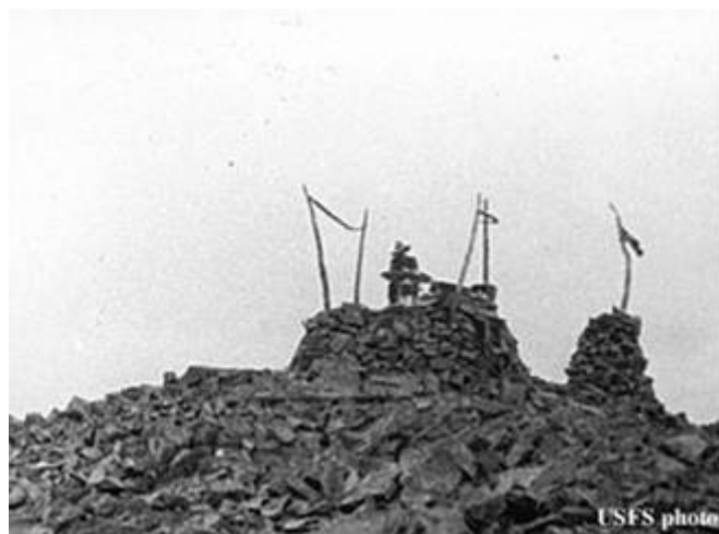
Figure 1. 1922 photo of the Salmon Mountain lookout improvements.

The Bitterroot National Forest established Salmon Mountain Lookout as a lookout point sometime prior to 1920. In September of that year, Forest Examiner Elers Koch conducted a review of the Salmon Mountain and Moose Creek ranger districts. Koch described Salmon Mountain as “an excellent lookout and an ideal place for location of an observatory.” 2 At the time of his visit, improvements consisted of a map board and map mounted on a “substantial stone terrace,” which had required “the expenditure of ... a lot of work” (Figure 1). He noted that the lookout camp, occupied by a smoke chaser and a lookout man, was located adjacent to the nearest water—a spring about a quarter of a mile south of the lookout point.