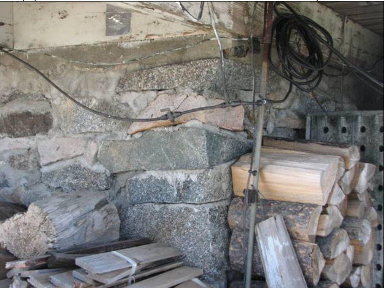
ID_IdahoCounty_Salmon Mountain Lookout_0004. Detail of the mortared stone foundation of lookout.