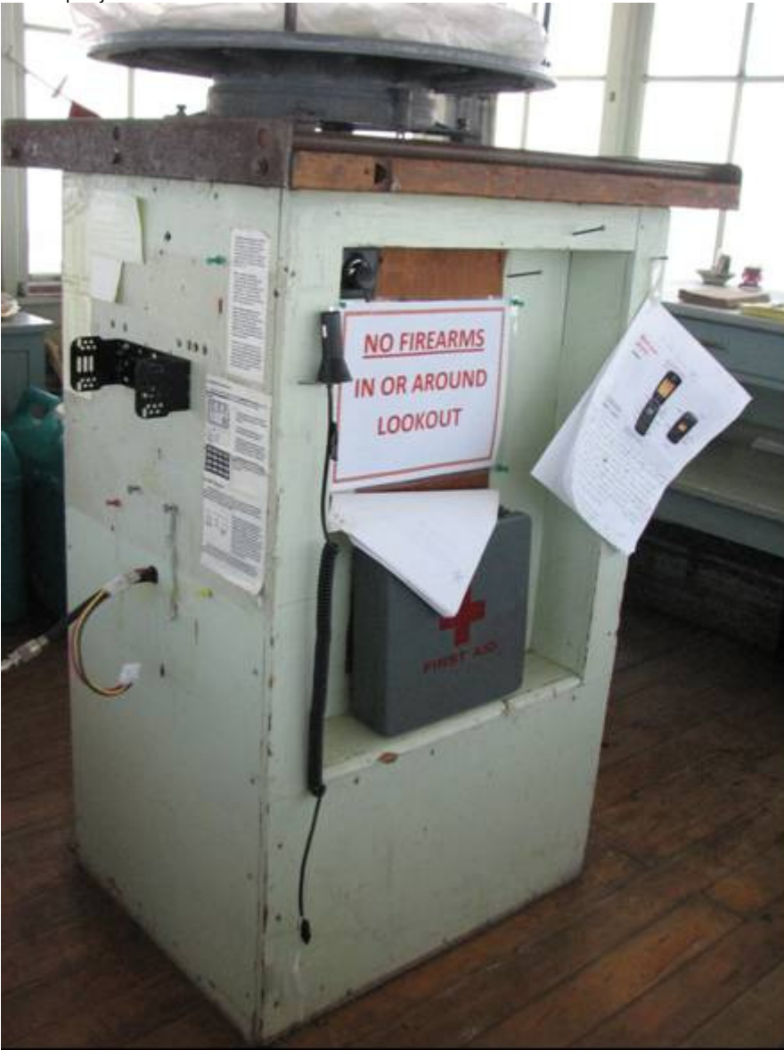
ID_IdahoCounty_Salmon Mountain Lookout_0005. Interior detail of lookout: Stand for Osborne fire-finder.