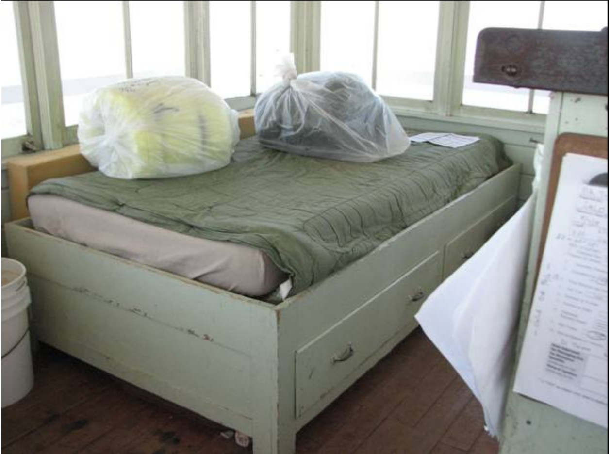
ID_IdahoCounty_Salmon Mountain Lookout_0007. Interior detail of lookout: platform bed with storage drawers.