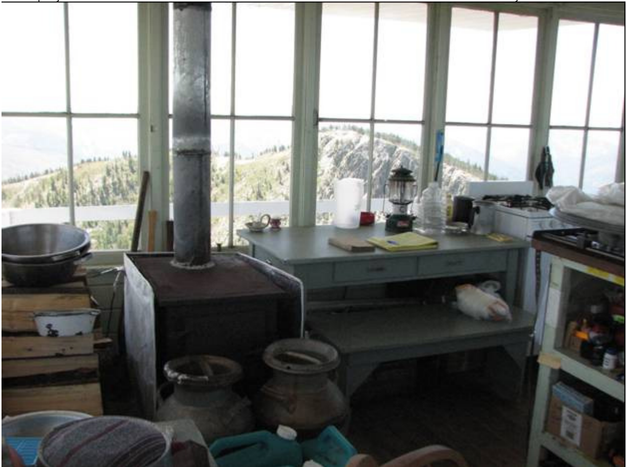
ID_IdahoCounty_Salmon Mountain Lookout_0006. Interior detail of lookout: wood heating stove, table, and propane cook stove.