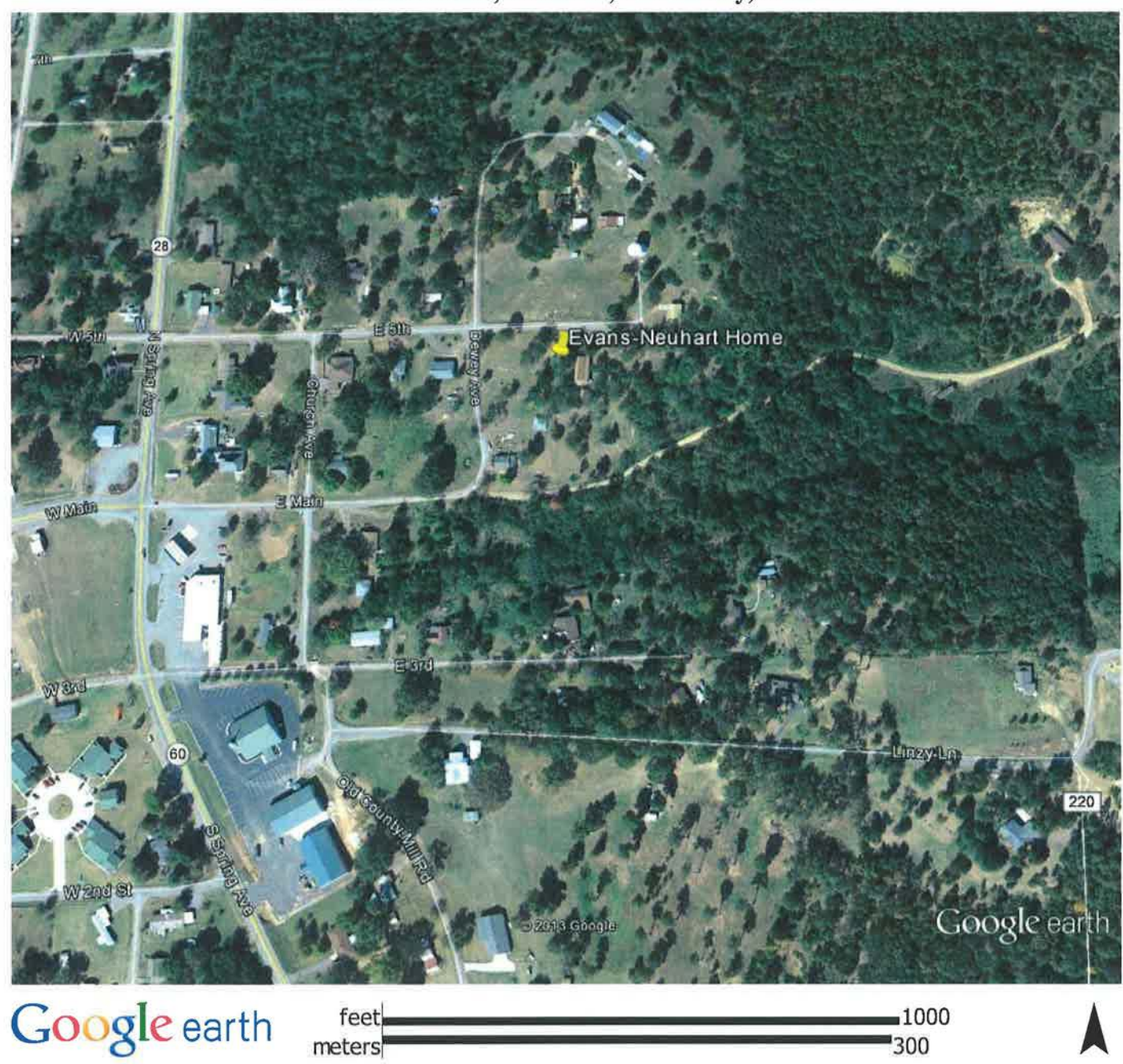
Evans-Neuhart Home, Plainview, Yell County, Arkansas