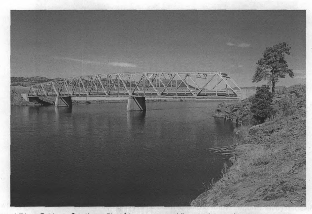
Photo 0003. Missouri River Bridge. South profile of truss spans. View to the northwest.