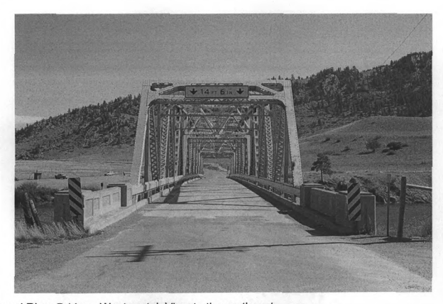
Photo 0005. Missouri River Bridge. West portal. View to the northeast.