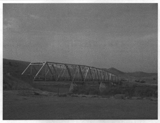
Photograph 0001. Missouri River Bridge. North profile of truss spans and east portal. View to the southwest.