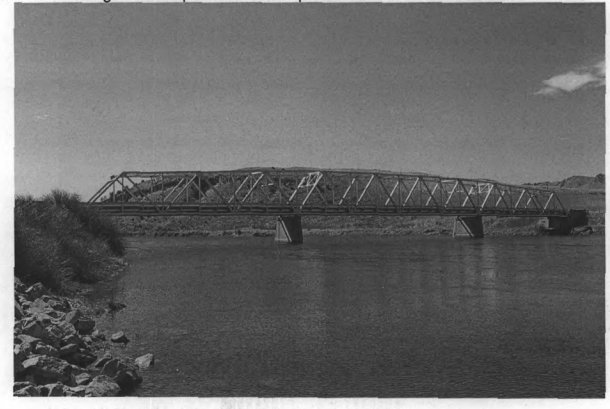
Photo 0004. Missouri River Bridge. North profile of truss spans. View to the south...