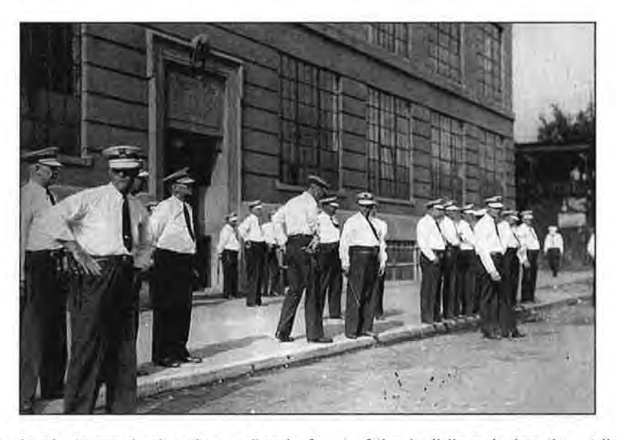
Figure 6: A historic photograph showing police in front of the building during the strike. Photograph dated 1935–1936.