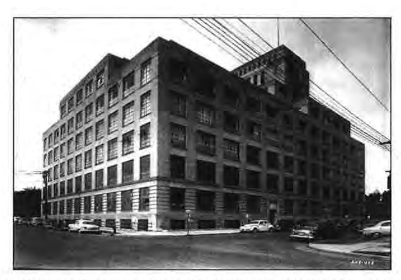
Figure 3: A historic photograph showing the north (right) and east (left) facades after the 1929 expansion.