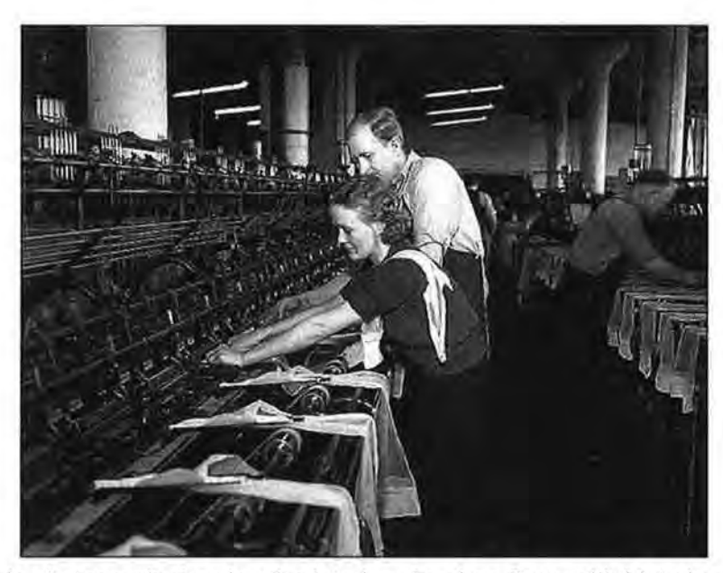
Figure 4: A historic photograph showing the interior of a shop floor, with historic concrete columns visible in the background. circa 1936.