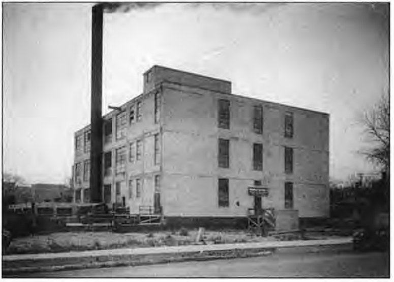
Figure 1: A historic photograph from the Minneapolis Times showing the north (right) and east (left) walls of the 1922 factory. Photograph dated January 8, 1924.