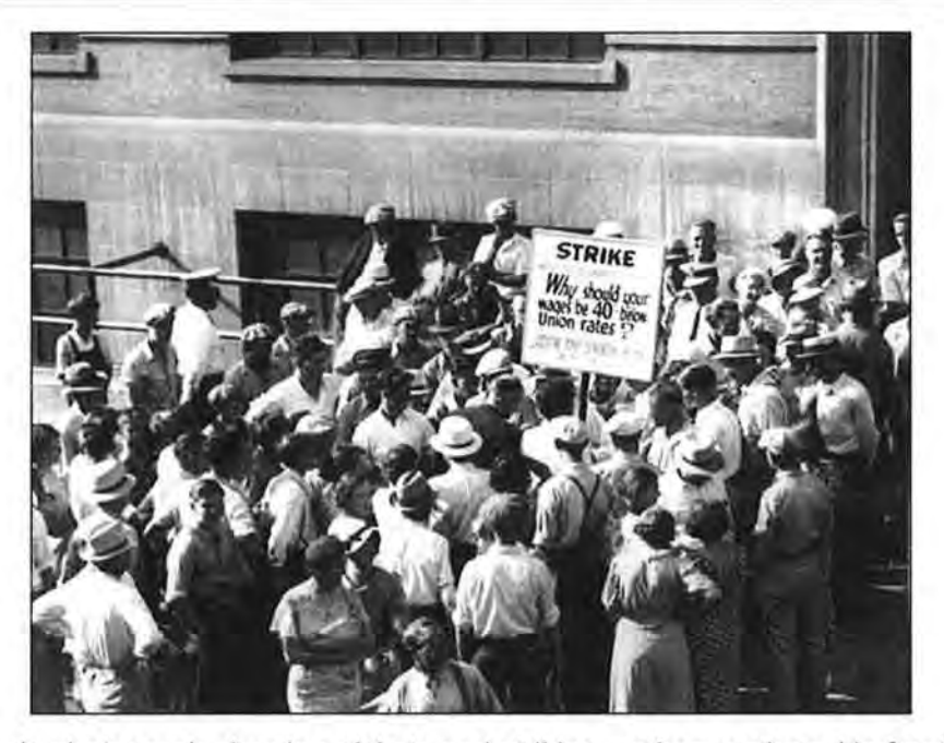
Figure 5: A historic photograph showing pickets and striking workers gathered in front of the building. Photograph dated 1935–1936.