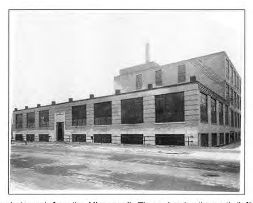
Figure 2: A historic photograph from the Minneapolis Times showing the north (left) and west (right) walls of the 1925 addition to the factory. Photograph dated January 3, 1926.