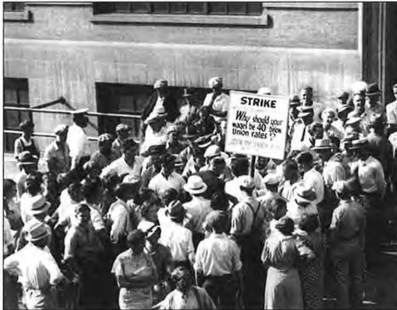
Figure 5: A historic photograph showing pickets and striking workers gathered in front of the building. Photograph dated 1935–1936.