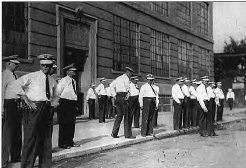
Figure 6: A historic photograph showing police in front of the building during the strike. Photograph dated 1935–1936.