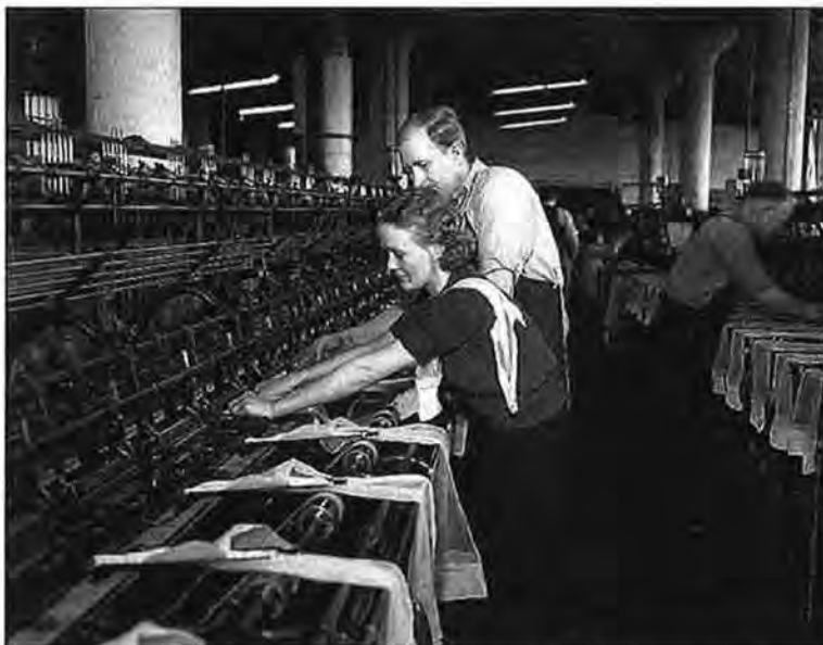
Figure 4: A historic photograph showing the interior of a shop floor, with historic concrete columns visible in the background. circa 1936.