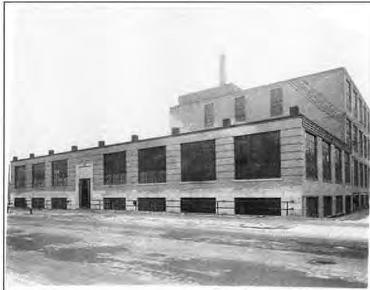
Figure 2: A historic photograph from the Minneapolis Times showing the north (left) and west (right) walls of the 1925 addition to the factory. Photograph dated January 3, 1926.