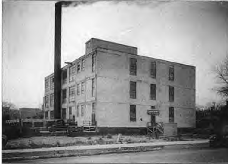
Figure 1: A historic photograph from the Minneapolis Times showing the north (right) and east (left) walls of the 1922 factory. Photograph dated January 8, 1924.