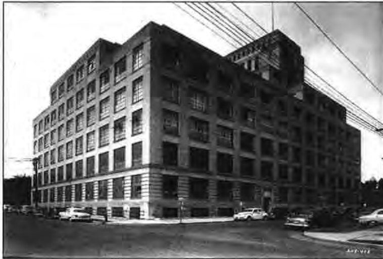
Figure 3: A historic photograph showing the north (right) and east (left) facades after the 1929 expansion. Photograph by Norton and Peel, June 1952. Source: Minnesota Historical Society.