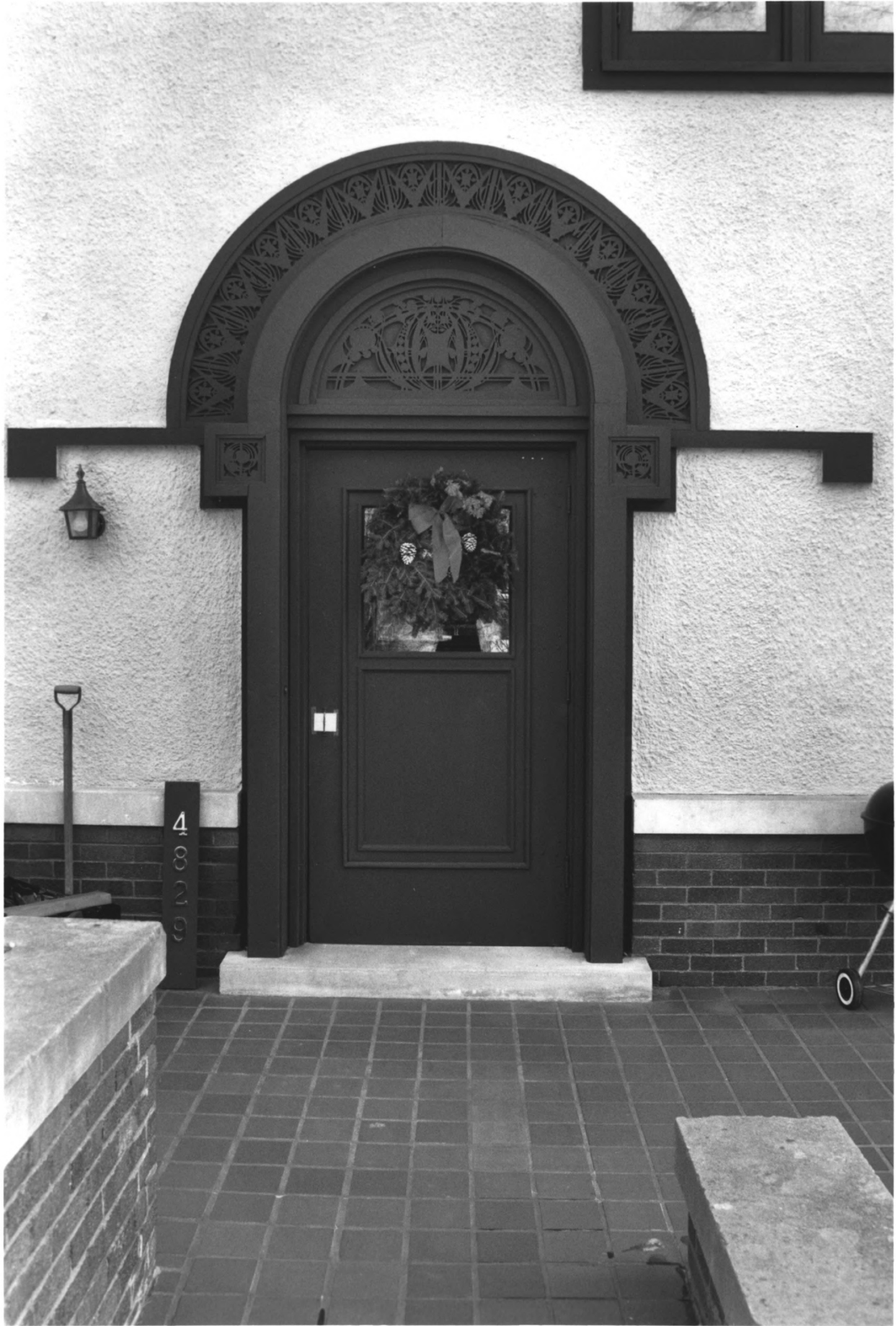
CHARLES AND GRACE PARKER HOUSE MINNEAPOLIS, HENNEPIN COUNTY, MINNESOTA 011059 #17