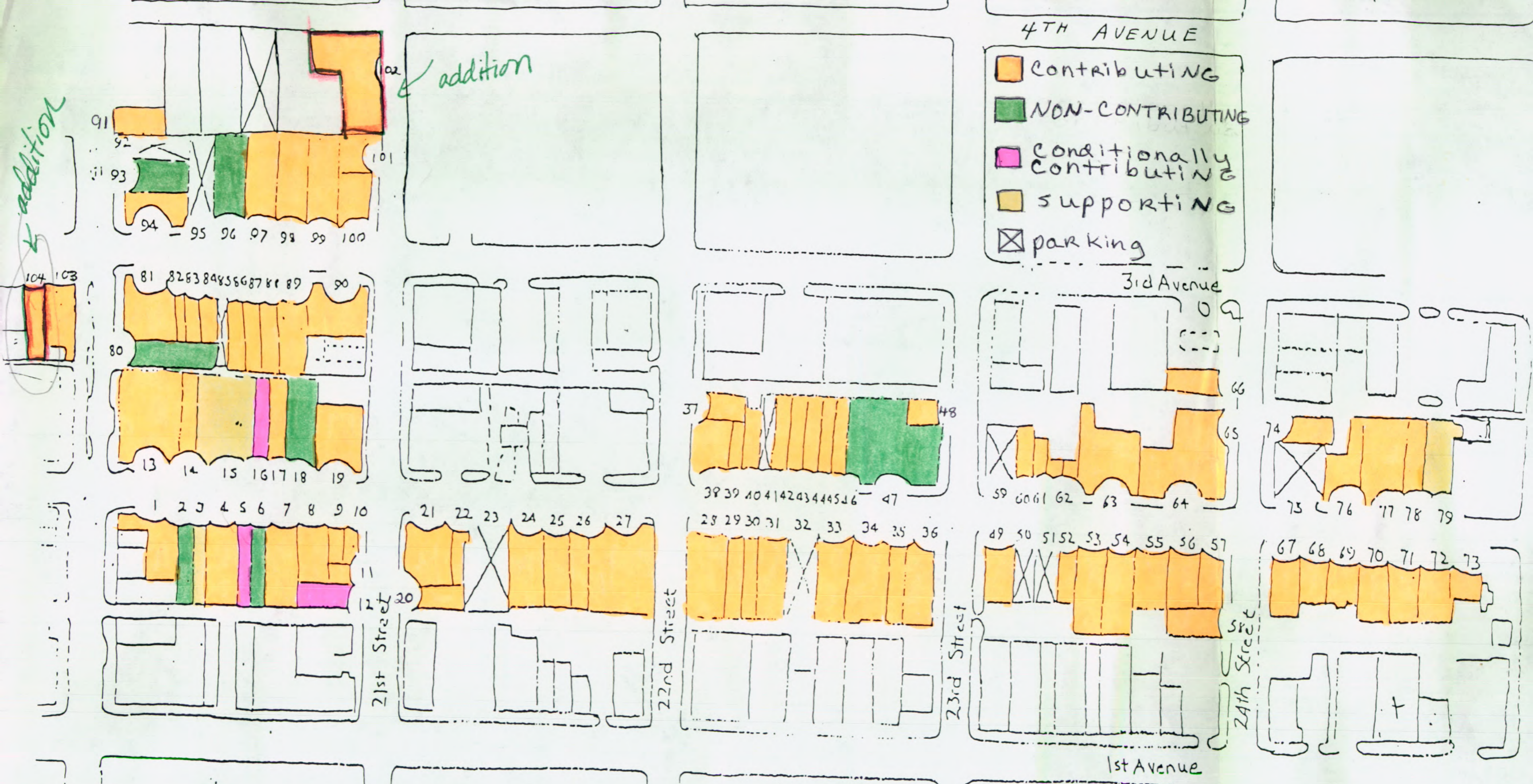
DOWNTOWN BIRMINGHAM HISTORIC DISTRICT