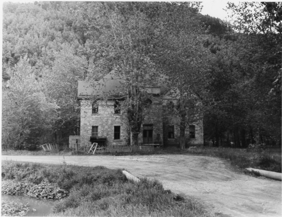
Old Federal Courthouse