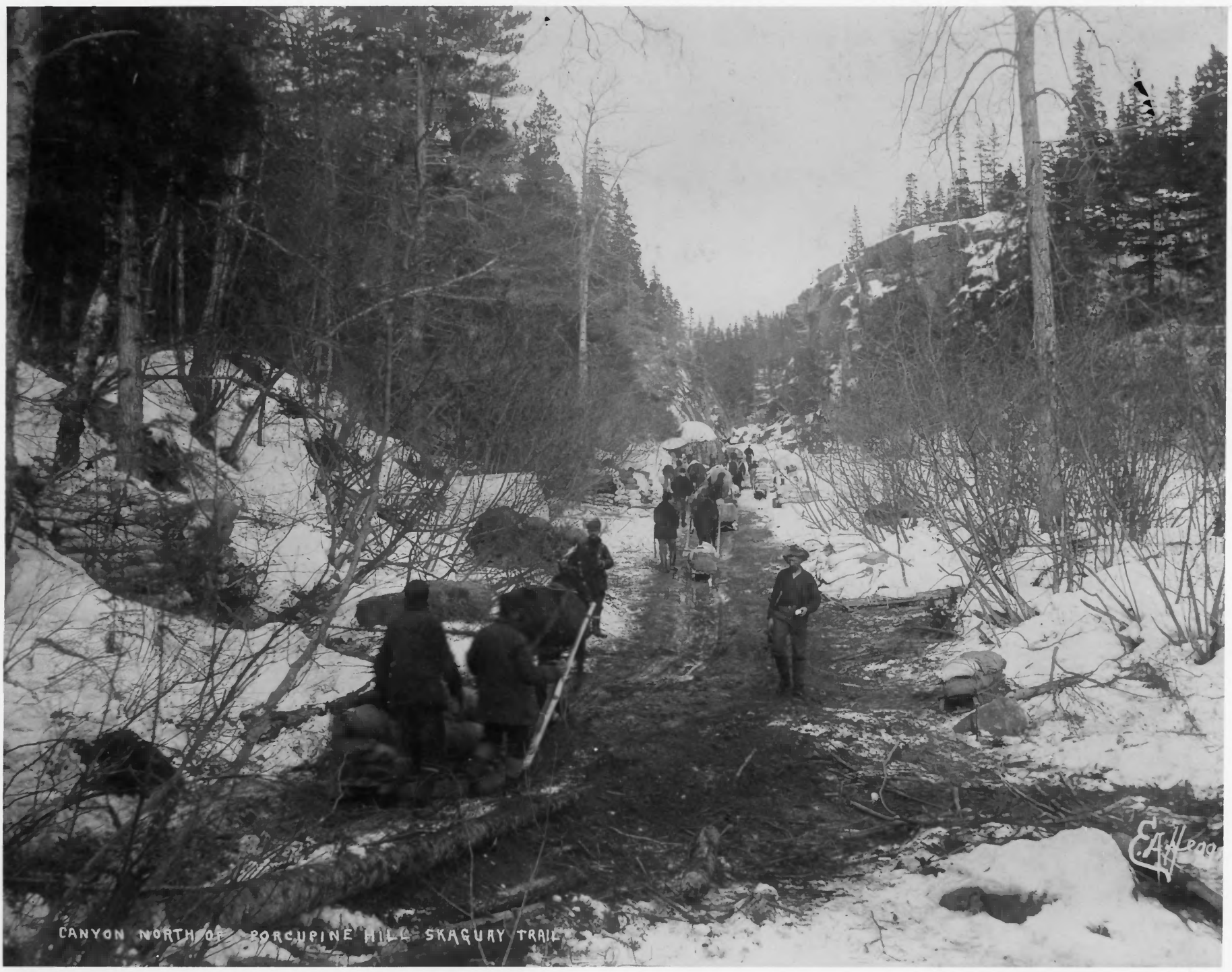
CANYON NORTH OF PORCUPINE HILL SKAGURY TRAIL