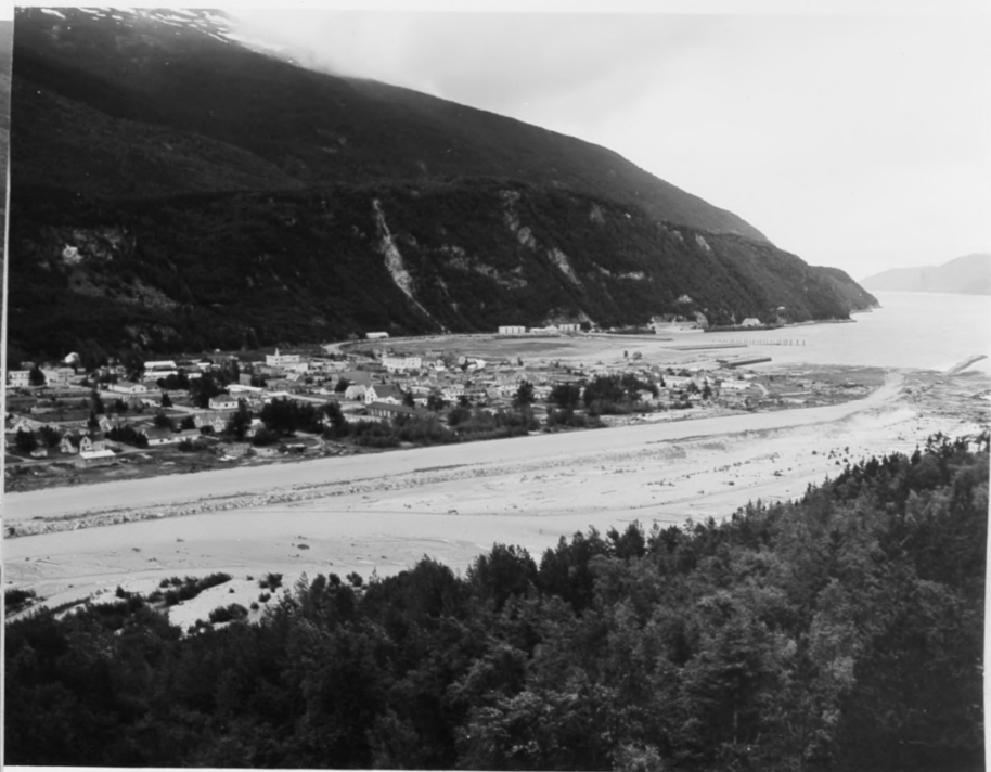
Panoramic View of Skagway, A l a s k a