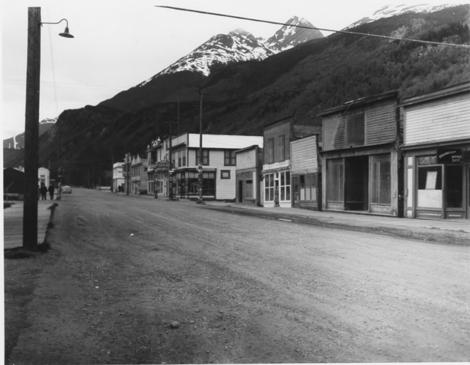
Broadway, main street of Skagway, looking northeast.