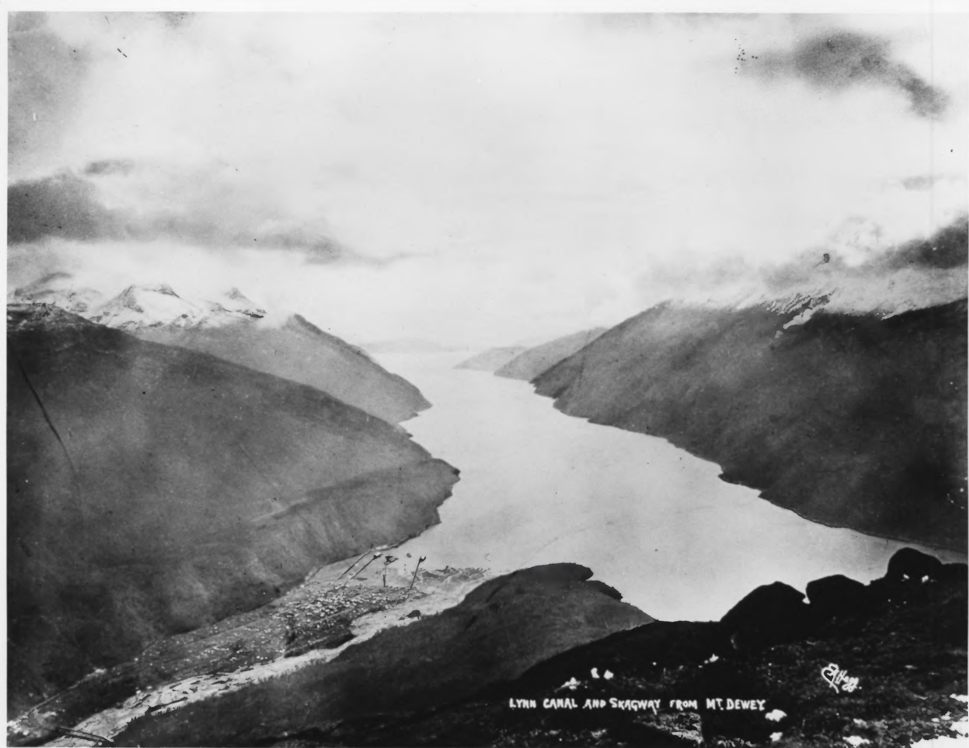
LYNN CANAL AND SKAGWAY FROM MT. DEWEY