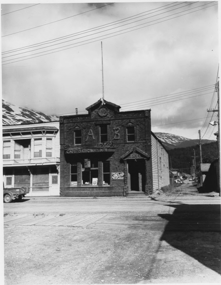
Alaskan Brotherhood Bldg. built in 1899