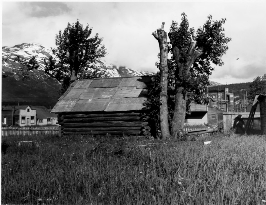
Old log cabin on the property of Jack Kiruse