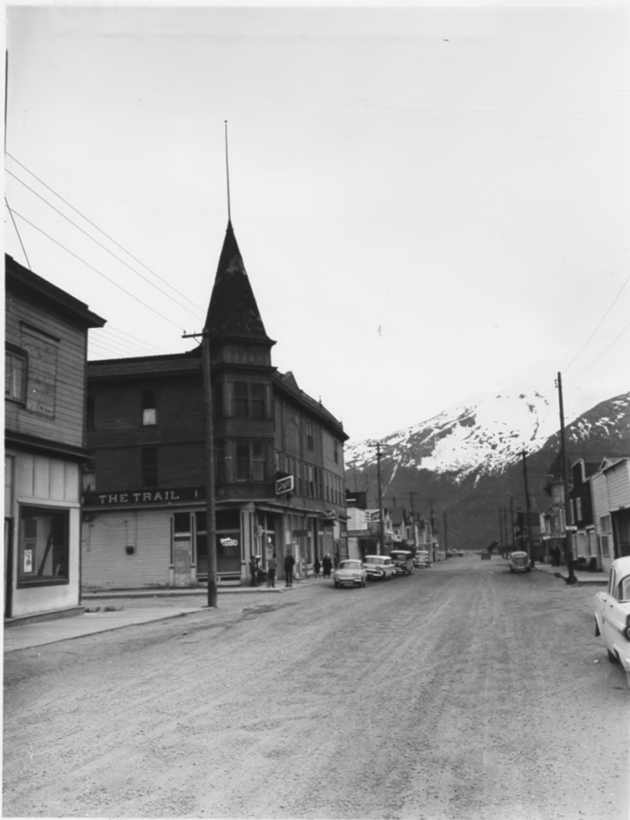
Broadway, main street of Skagway looking southwest. Trail House Tavern in center.