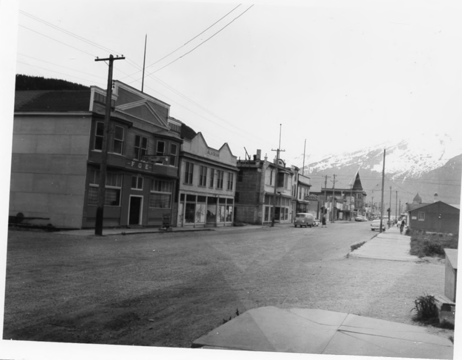
Broadway, looking southeast on the main street of Skagway, Alaska