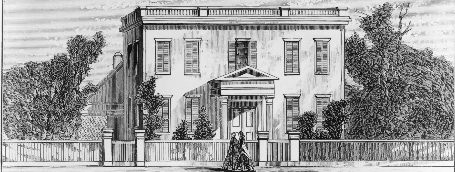
RESIDENCE OF MILLARD FILLMORE.