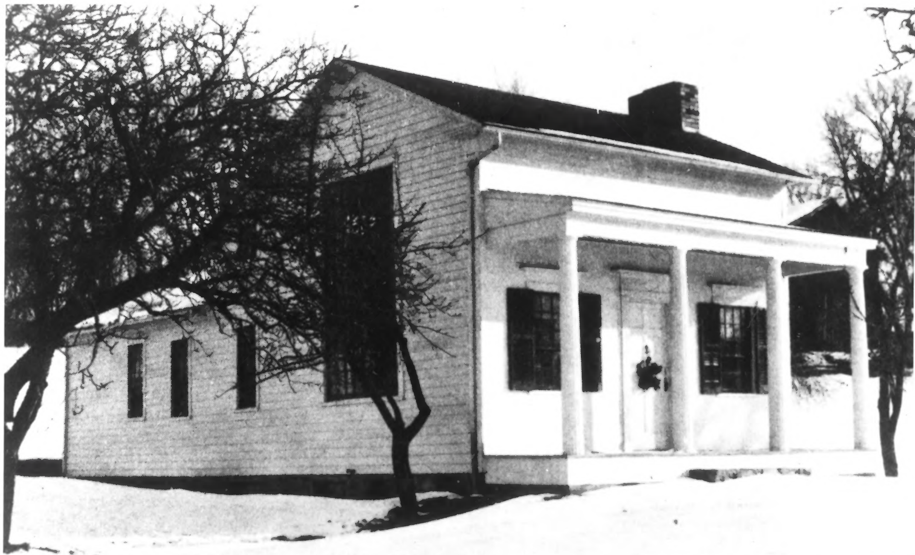
Millard Fillmore House, c.1950. East Aurora. New York.