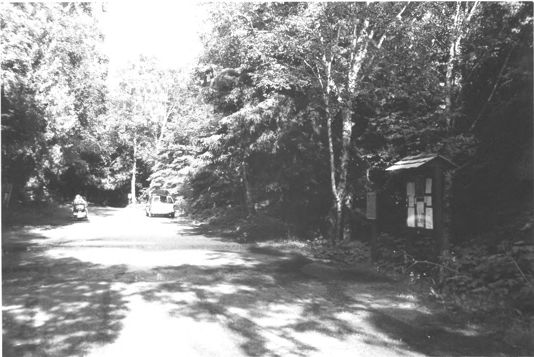
Cascade River wayside picnic Area Drive and parking Area COOK CO., Mn 014535-14 -T