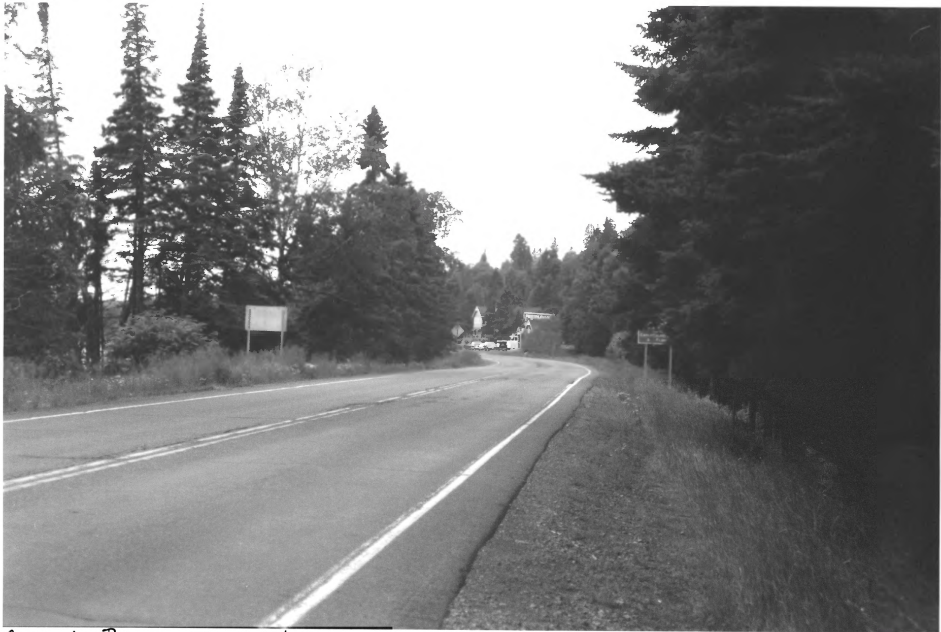
Cascade River wayside Highway 61 within wayside COOK CO., Mn 014539-13 - c