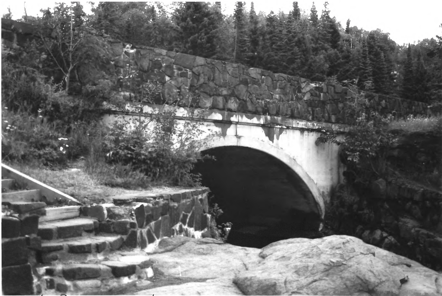
Cascade River Wayside Bridge 5132 Cook Co., Mn 014539-20 -- 5