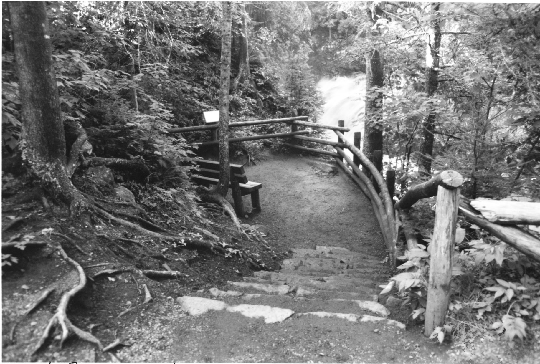
Cascade River Wayside West River Trail Lookout Cook Co., Mn 014538-13 - N