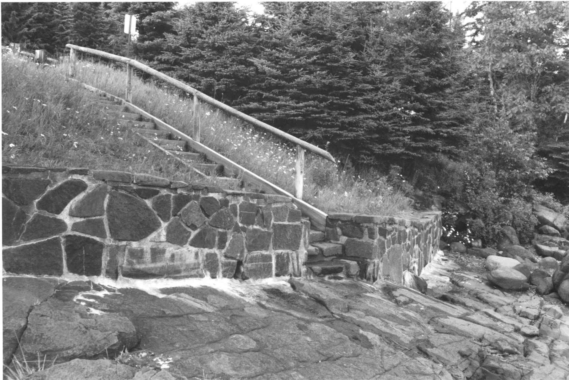
Cascade River Wayside Highway Overlook. 1981 Retaining Wall Cook Co., Mn 014535-2-5