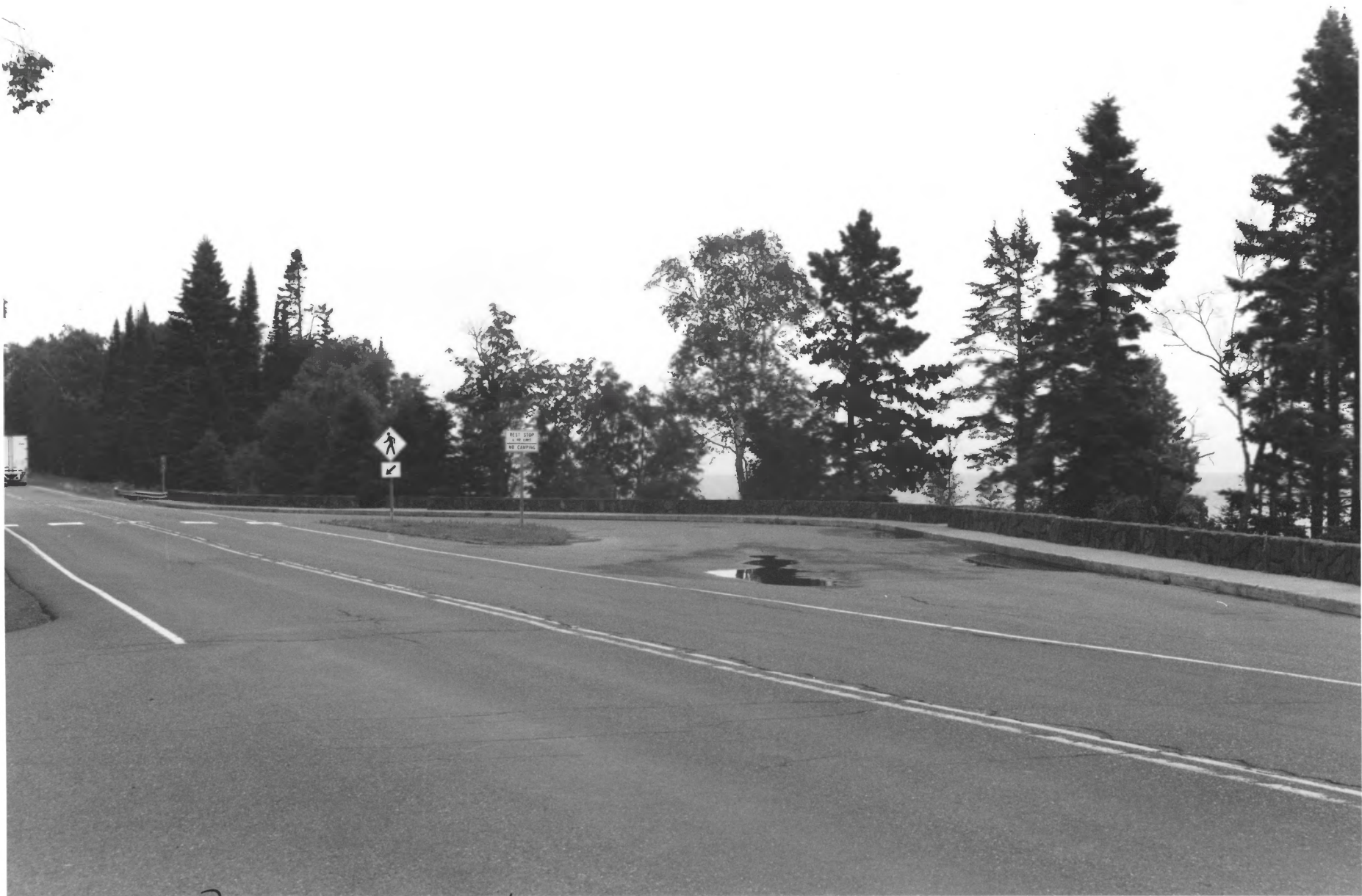
Cascade River way side Highway Overlook Cook Co., Mn 014539-3 - E