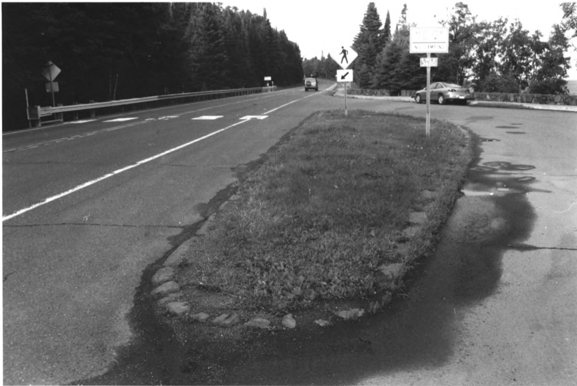
Cascade River wayside Traffic Island with stone curbing Cook Co., MN 014535-6-6