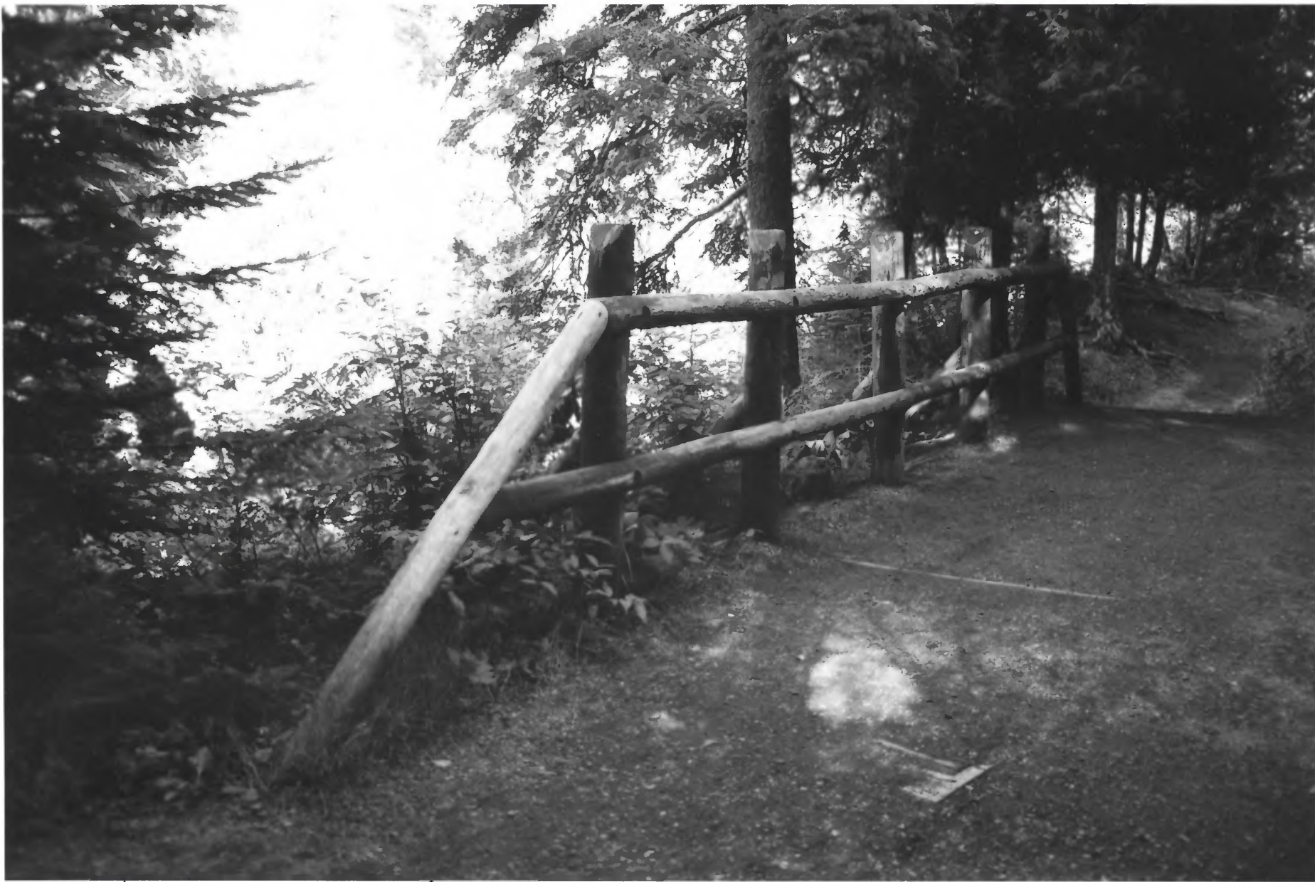
Cascade River wayside West River Trail Lookout Cook Co., Mn 014535-24-2