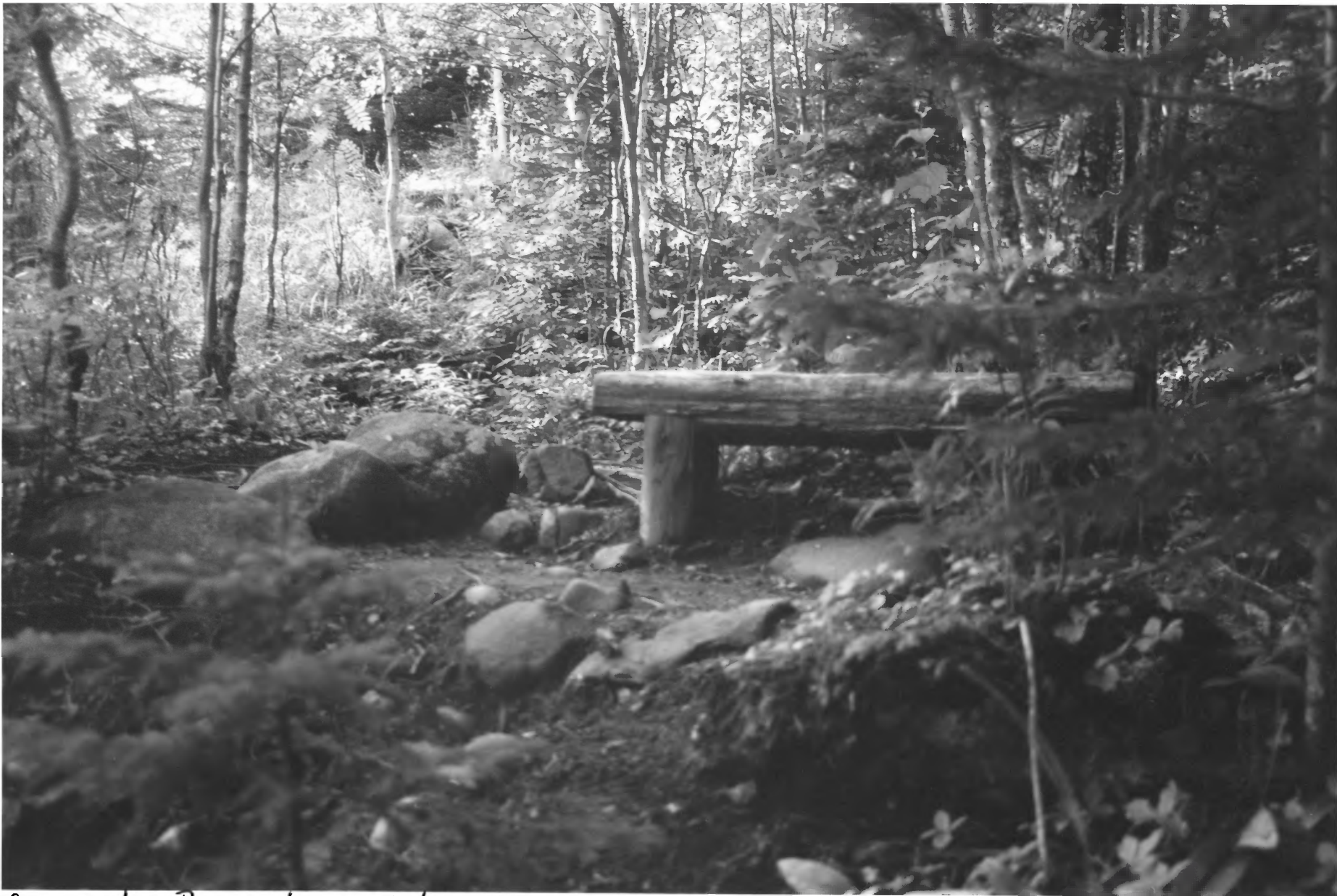
Cascade River Wayside East River Trail Cook Co., Mn 014538-18-P