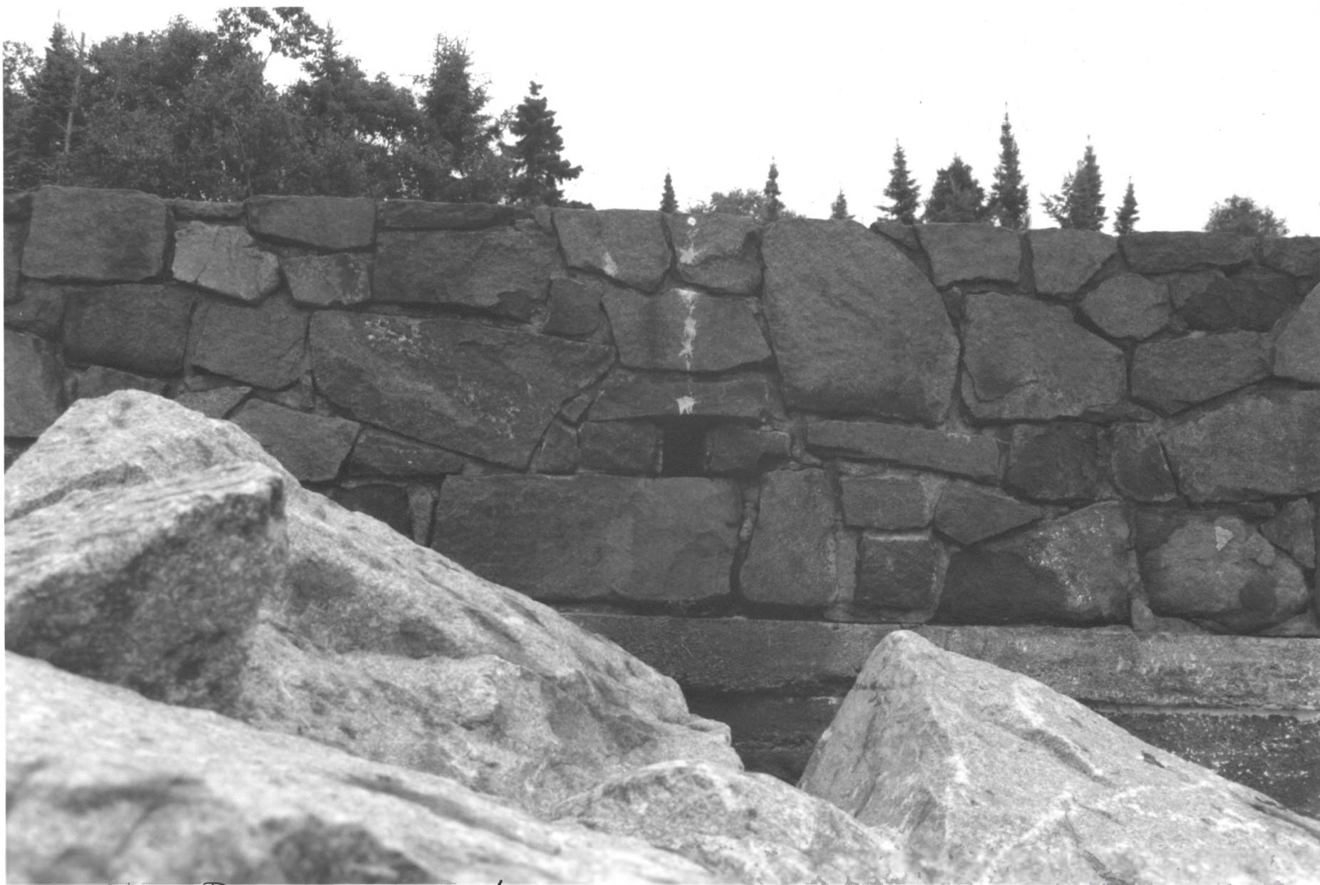
Cascade River Wayside Highway Overlook Cook Co., MN 014539-9-H