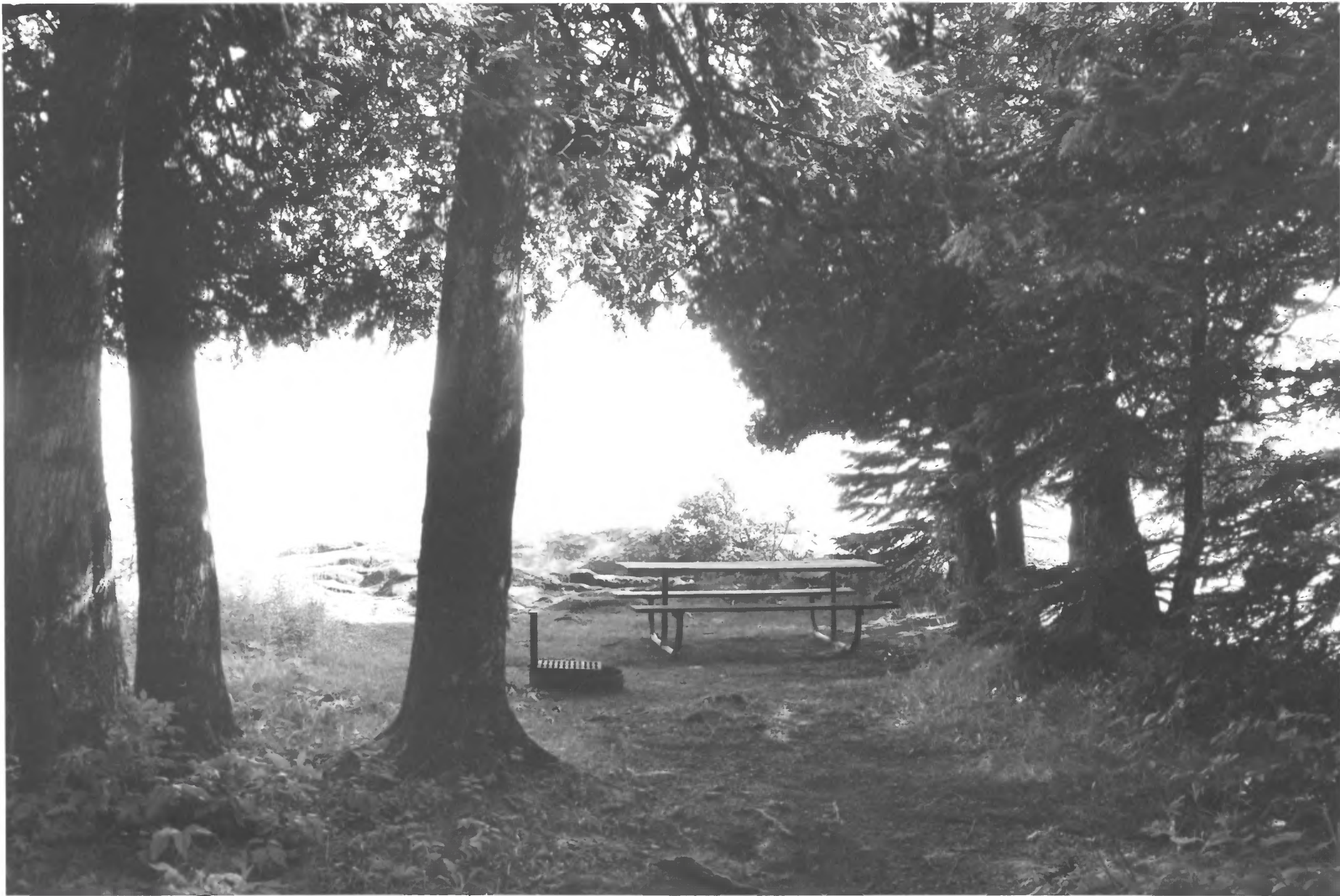
Cascade River Wayside Picnic Area on Lake Superior Shore Cook Co., Mn 014535-20-u