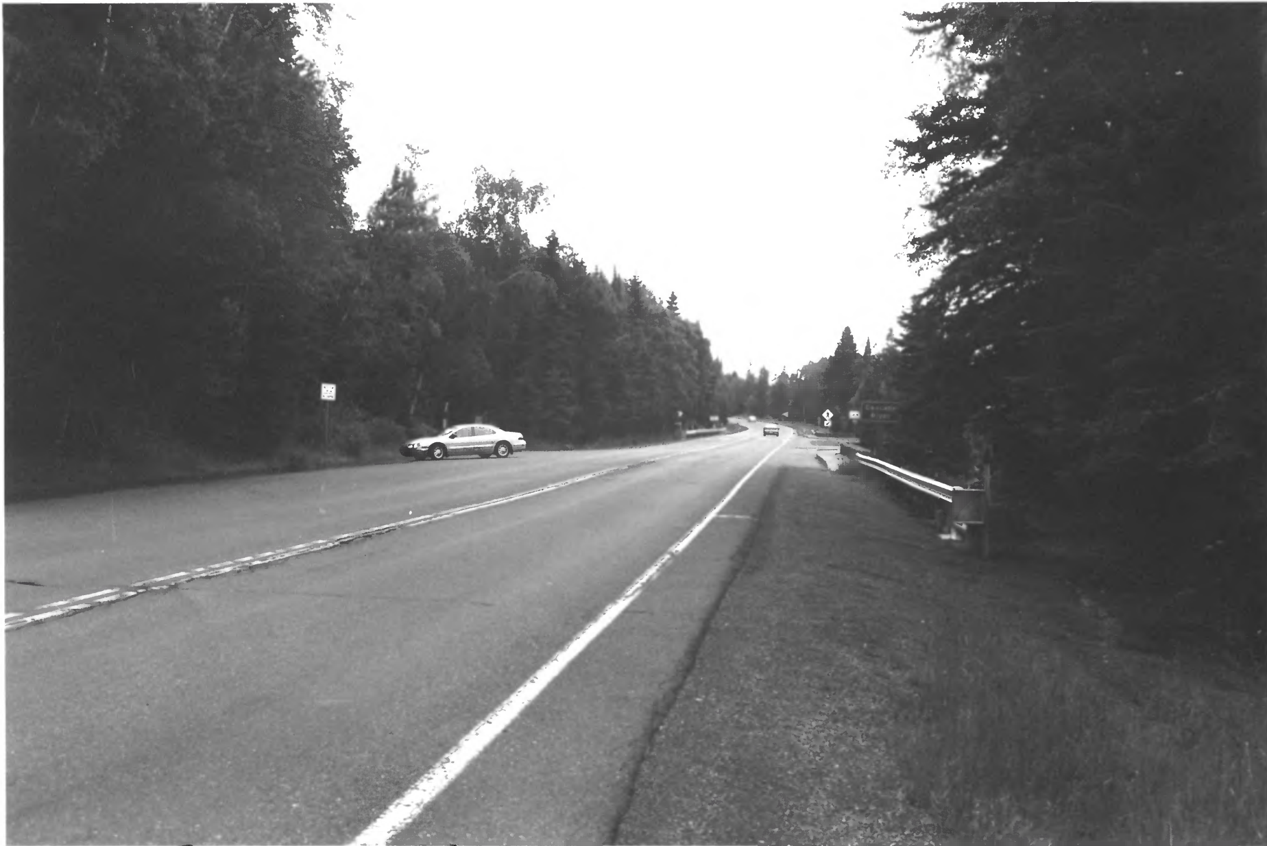
Cascade River Way side Highway 61 Within Way side Cook Co., Mn 014539-12 - 0