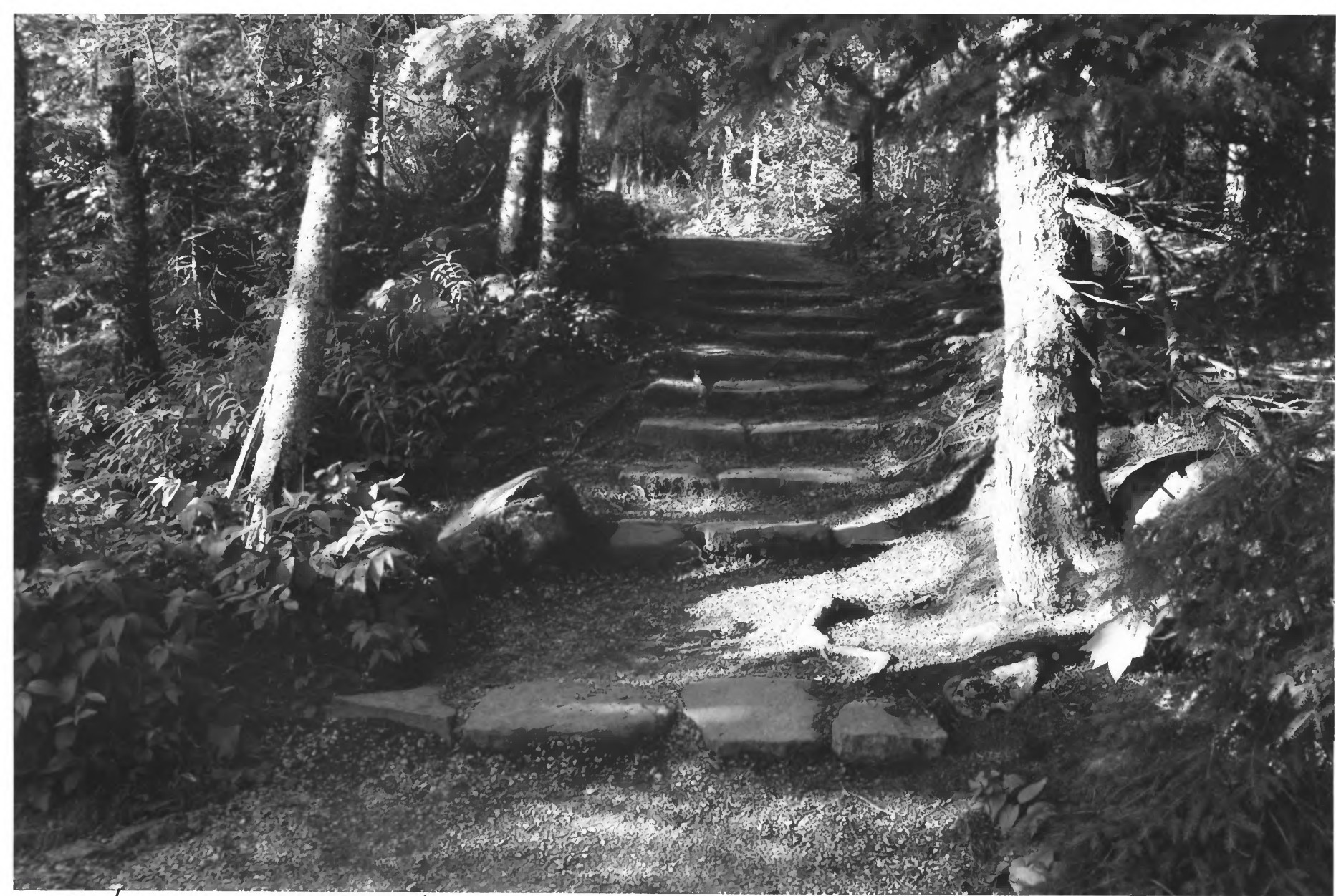
Cascade River Wayside East River Trail Cook Co., Mn 014538-22-R