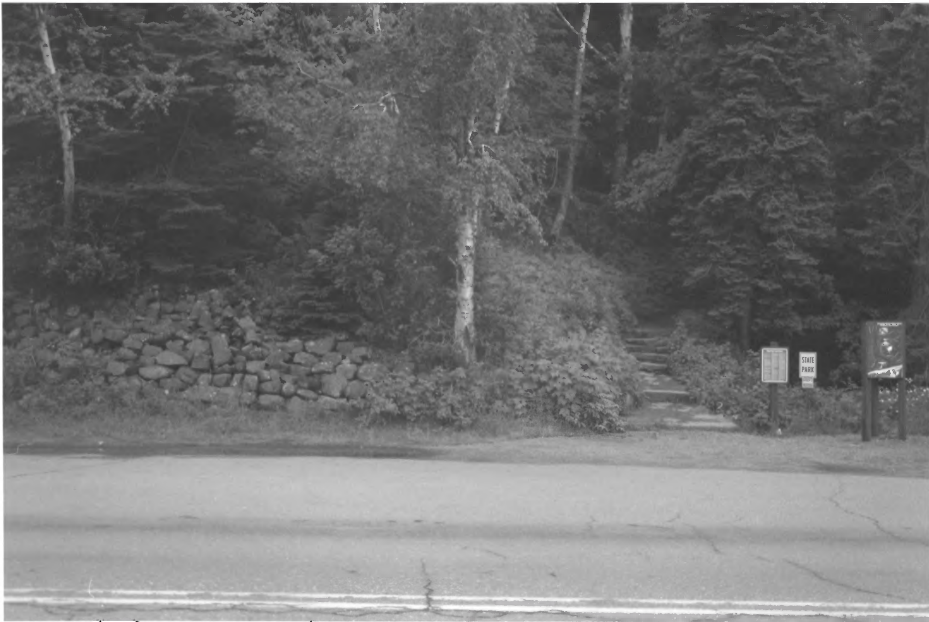
Cascade River Wayside Dry Stone Retaining Wall Cook Co., Mn 014539-14-F