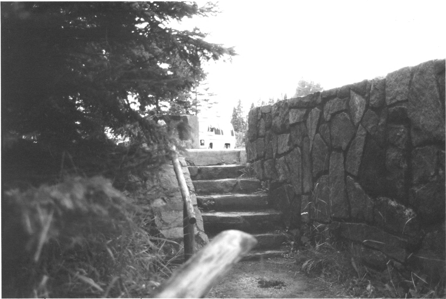
Cascade River Wayside Highway Overlook Stone Steps Cook Co., MN 014539-17 - I