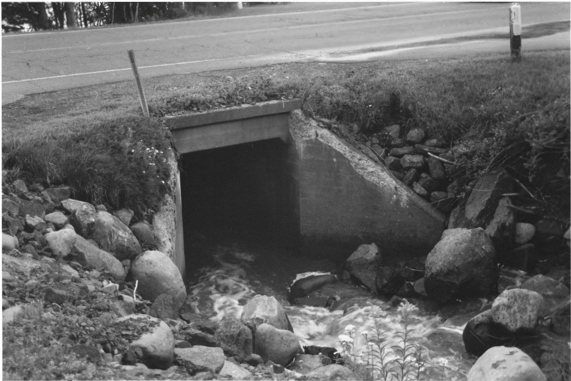
Cascade River Wayside Babineau Creek Culvert (NORTH SIDE) Cook Co., Mn 014535-10-B