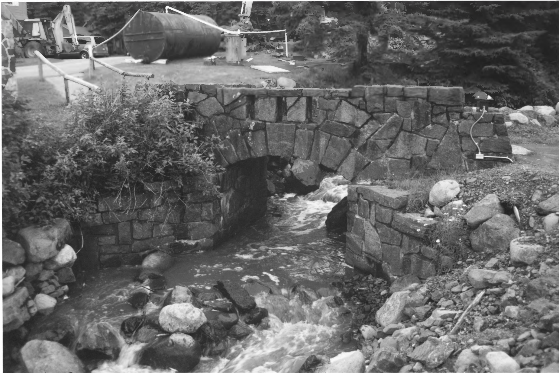
Cascade River Way Side Babineau Creek Foot Bridge (southside) Cook Co., mn 014535-11-A