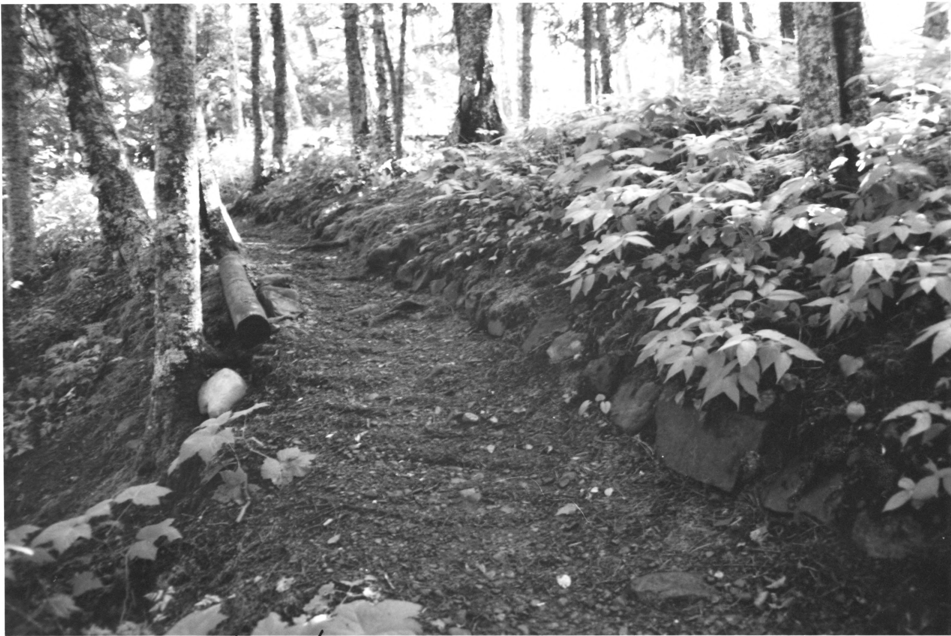
Cascade River Wayside Cascade Lodge Trail Cook Co., MN 014538-3-K