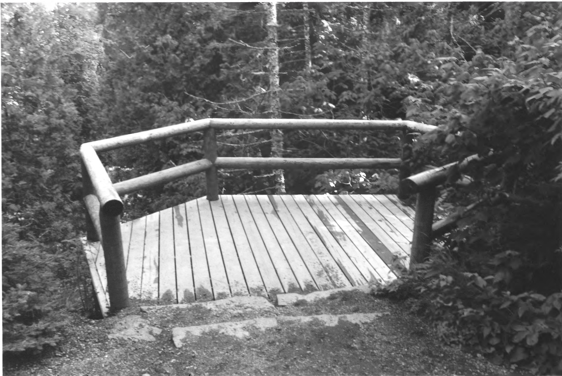
Cascade River WaySide West River Trail Lookout Cook Co., MN 014538-5 -m