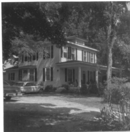
Boyce-Ellison-King House (#42)