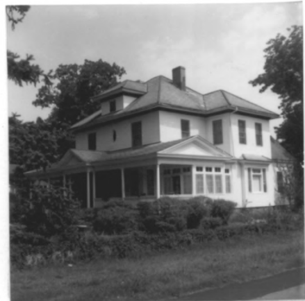
McDill-Ashley House (#99)