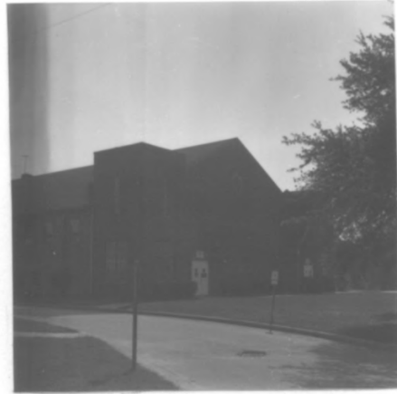
McGee Gymnasium (#94)