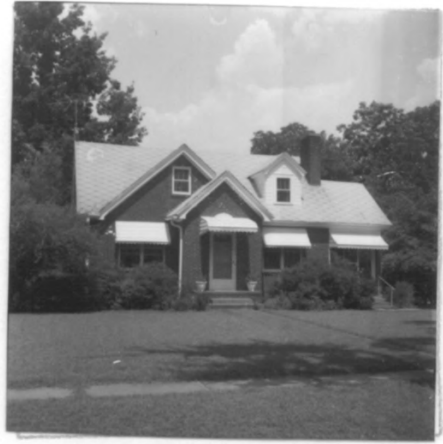
Ralston-Hagen-Sharpe House (#96)