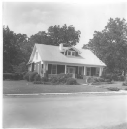
Todd-Kennedy House (#108)