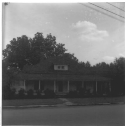
Leslie House (#116)