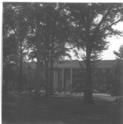
Bonner Hall Dormitory (#87) Woman's College Circle