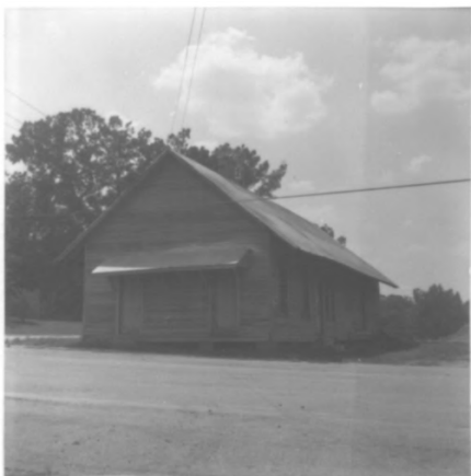
Due West Railroad Depot (#16)