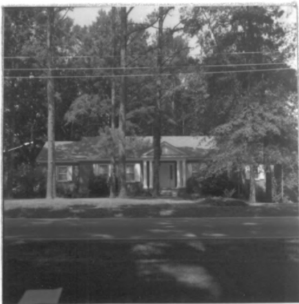
Due West ARP Church Manse (#40)