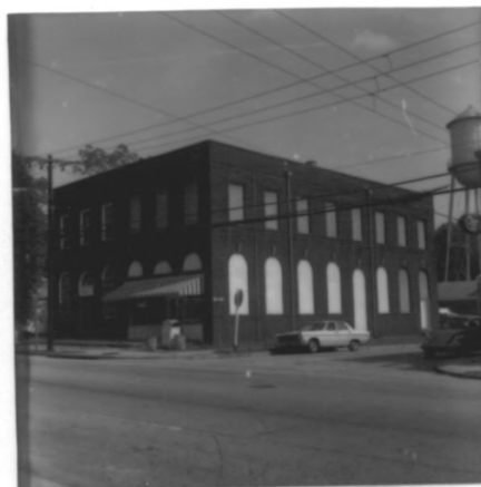
Commercial Building (#68A) Farmers and Merchants Bank Building (#68B)