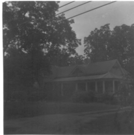
Seawright House (#6)