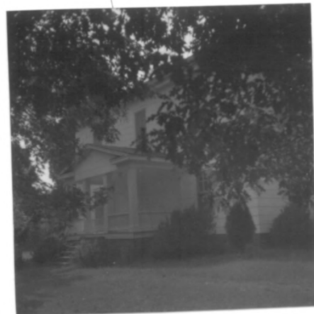
Seawright-Hoffman-Haldeman House (#9)