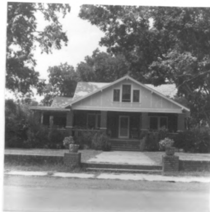
Plaxco House (#110)