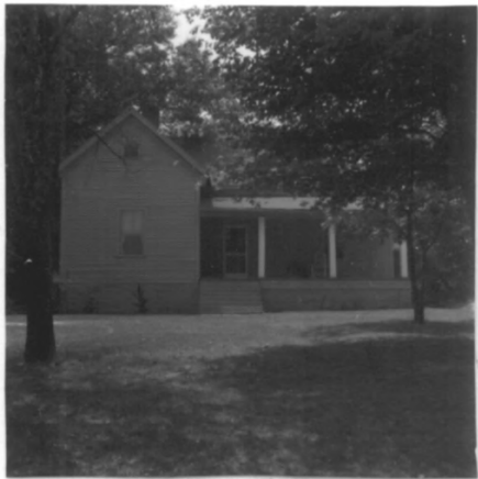
Allen Gordon House (#103)