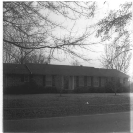
Saunders-McGee House (#119)