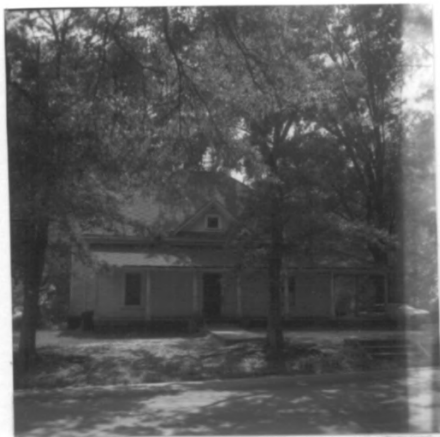
Clinkscales-Hagen-Pruitt House (#13)