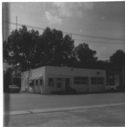
Due West Town Hall/ Fire Department (#64)