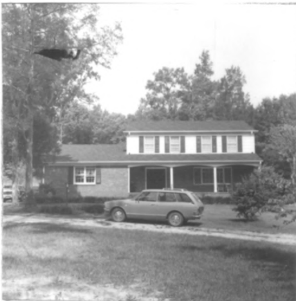
Bill Lesesne House (#12)