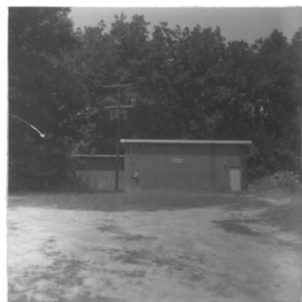
Telephone Exchange Building (#76)