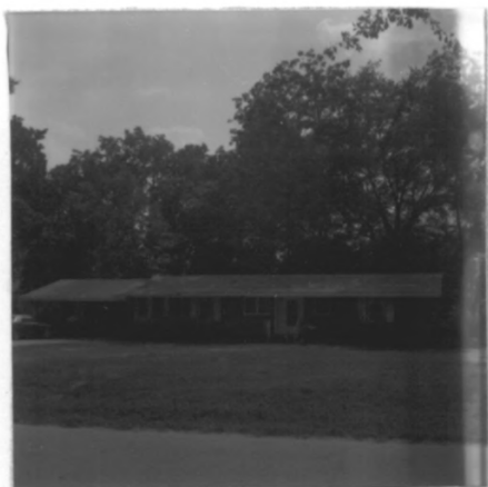
White-McFerrin House (#51)