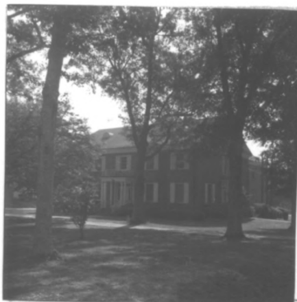
Kennedy Hall Dormitory (#86) Woman's College Circle