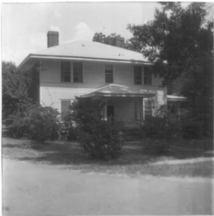
R.M. Stevenson House (#95)