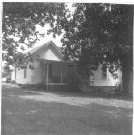
Todd-McAdams-Pressly House (#38)