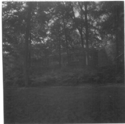
Winnie Phillips House (#11)