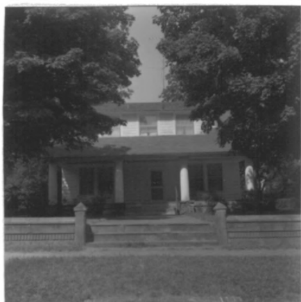
Jamie Pressly House (#43)