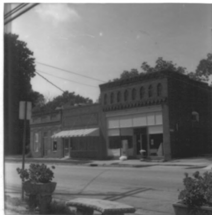
Commercial Building (#32)