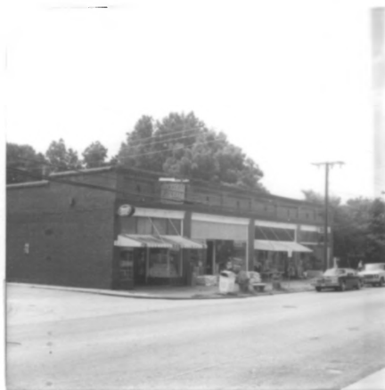
Plaxco's Drug Store (#63A) Due West Supply Company Annex (#63B) The Family Store (#63C) Due West Supply Company (#63D)