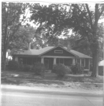
Clinkscales House (#54)