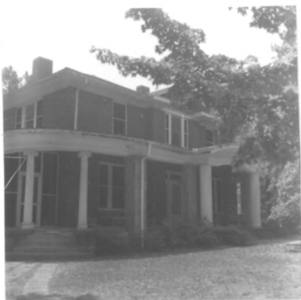
Edwards-Strong House (#83)