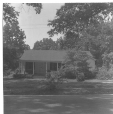
Long House (#77)