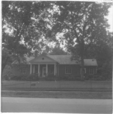
Josie Stevenson House (#100)