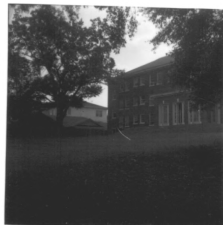
Robinson Terraces (#91)