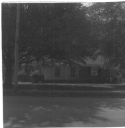
Rachel Pressly House (#72)