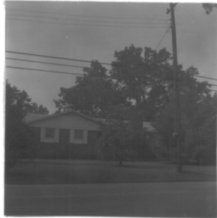
Ellis-Lampton House (#7)