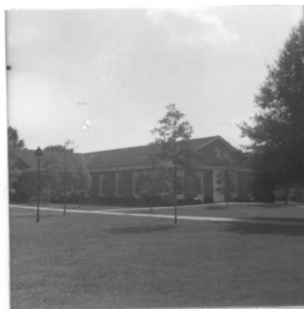
Campus Dining Hall (#67B) Erskine College Campus