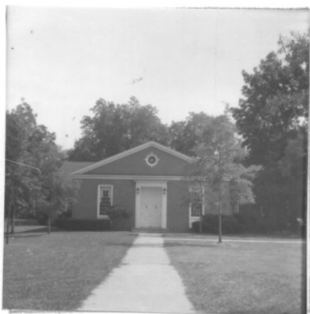
Campus Post Office & Canteen (#67A) Erskine College Campus