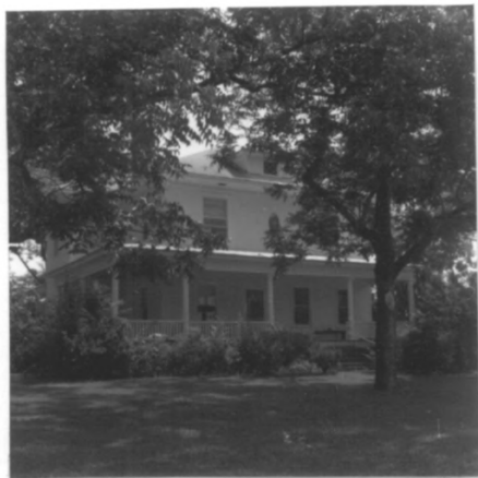
Galloway-Sutherland House (#111)