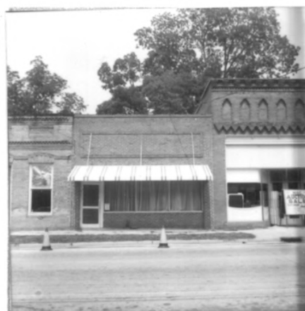
SAFE Building (#31)