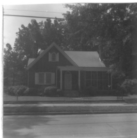
Ray Young House (#73)