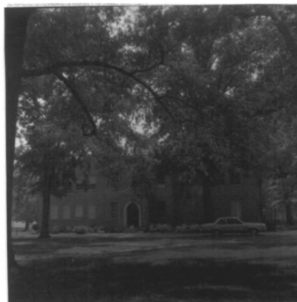
Reid Science Hall (#24) Erskine College Quadrangle