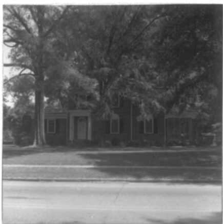
President's House (#33)