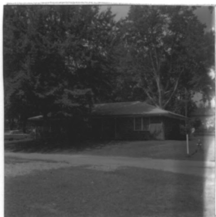
McDonald Duplex (#56)