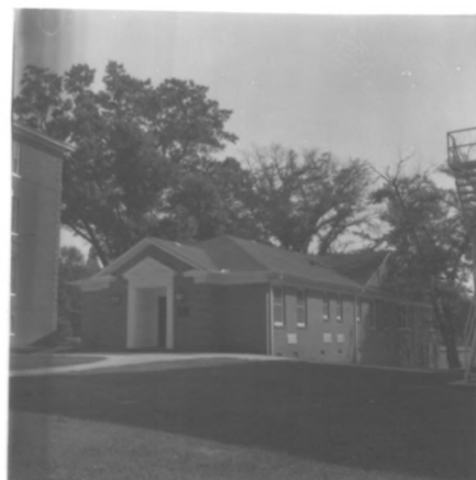
Younts Infirmary (#89) Woman's College Circle