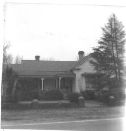
Branyon House (#117)