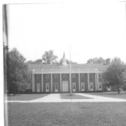
Watkins Student Center (#67) Erskine College Campus