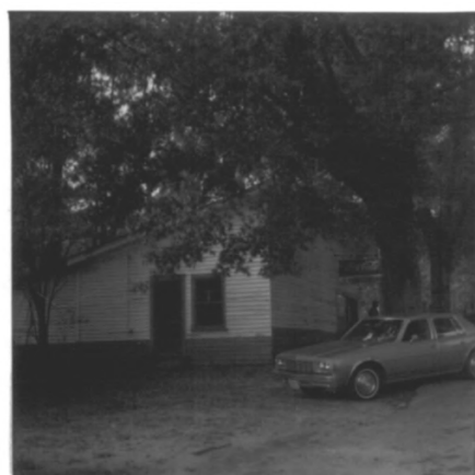
Edwards-Hawthorne Store (#84)