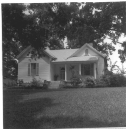
Hawthorne-Wood House (#37)