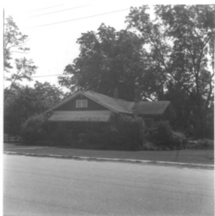
Smith-Pruitt House (#113)