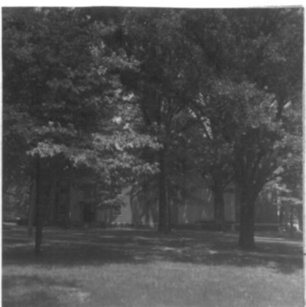
McCain Library (#27) Erskine College Quadrangle