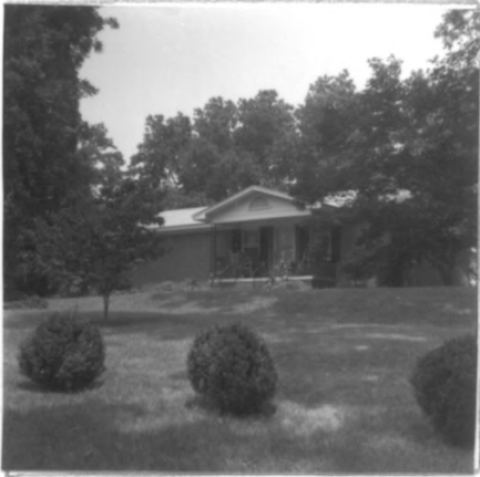
Mary Kennedy House (#36)