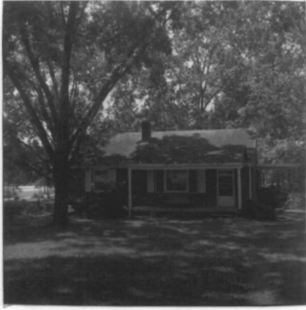
McWhite House (#92)