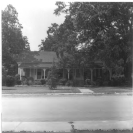
Wideman-Gettys House (#109)