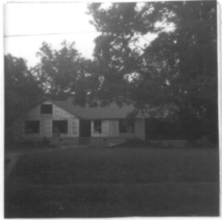
Merwyn Johnson House (#101)