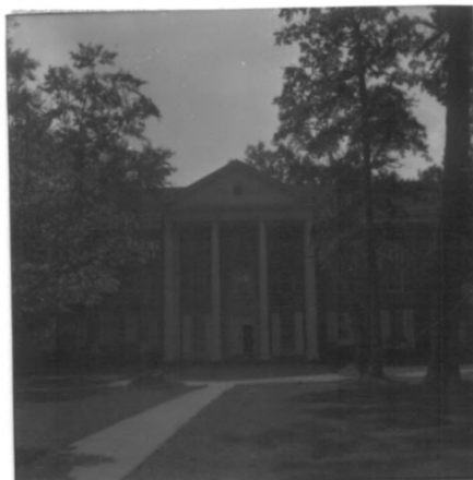
Grier Hall Dormitory (#21) Erskine College Campus