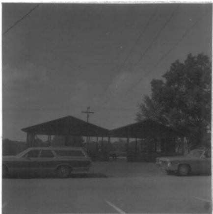
Ellenburg Pavilion (#19) Erskine College Campus