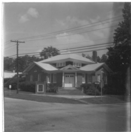
Due West Baptist Church (#53)