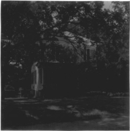
Robinson-Hawthorne-Cribbs House (#93)