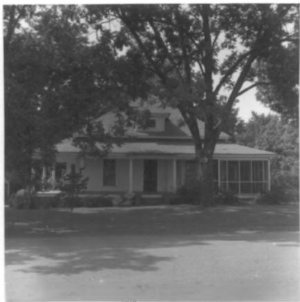
McDill-Ferguson House (#106)