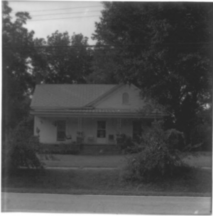
Ellis-Fleming House (#2)