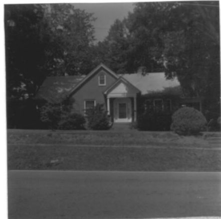
Orr-Sloan House (#41)