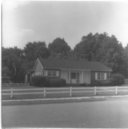
J. Calvin Koonts House (#107)