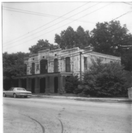
Due West Hotel (#62)