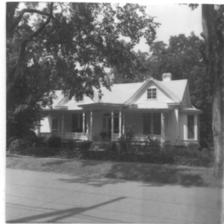
Edwards-Clarke House (#97)