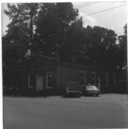
Associated Reformed Presbyterian Printing Office (#65)