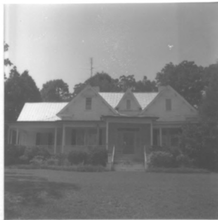
Brownlee-Huntley House (#15)