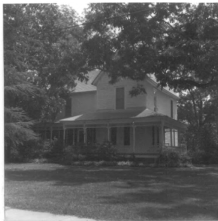
Ralph Ellis House (#112)