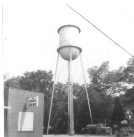
Water Tower (#75)