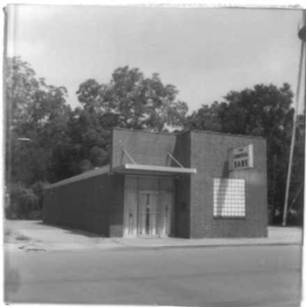
Commercial Bank Building (#69)