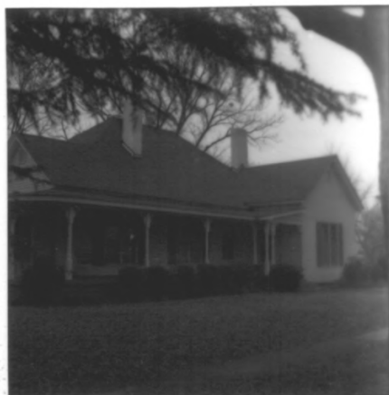
Jordan-Smith House (#121)