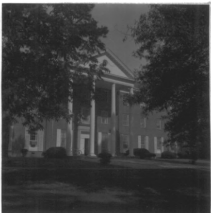
Pressly Hall Dormitory (#22) Erskine College Campus