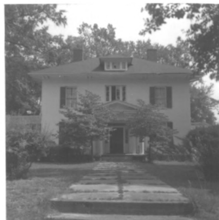
McGee-Kennedy-Boyce House (#55)