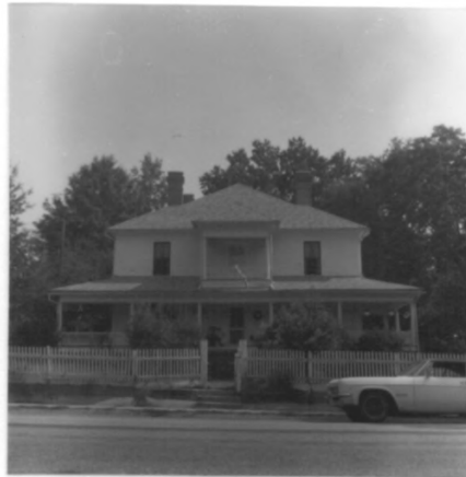
Todd-Young House (#105)