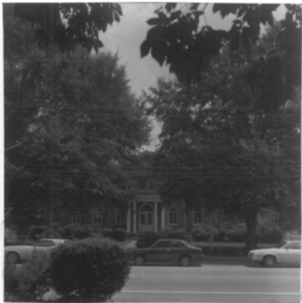
McQuiston Divinity Building (#61)