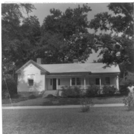
Wardlaw-Moore House (#57)