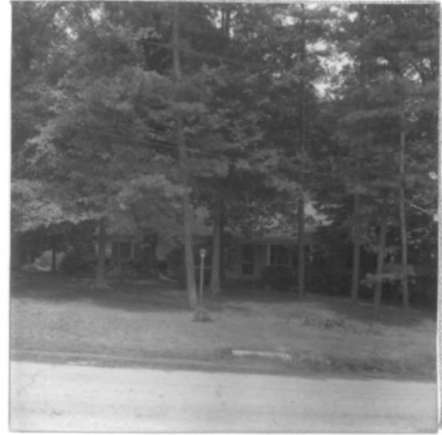
John Pressly House (#39)