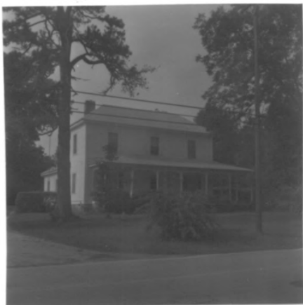
Haddon-Davis-Ferguson House (#8)