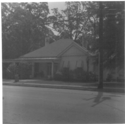
Johnston-Edwards House (#70)