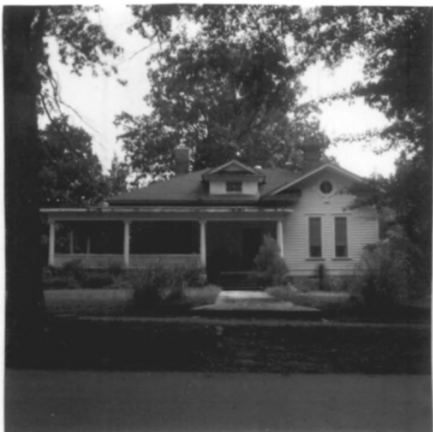
Wilkerson-McConnell House (#98)