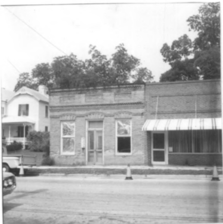
Old Bank Building (#30)