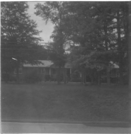
Gravely-Black House (#10)