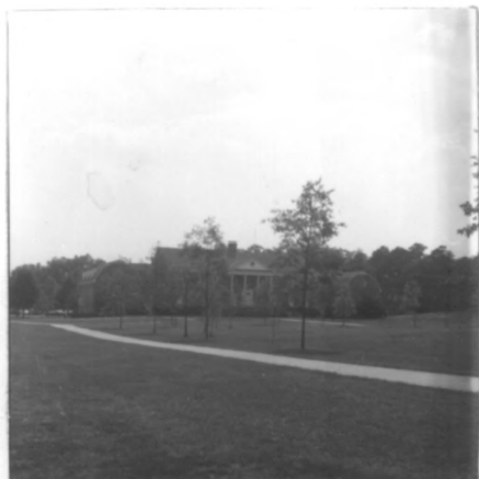
William Henry Belk Hall (#66) Erskine College Campus