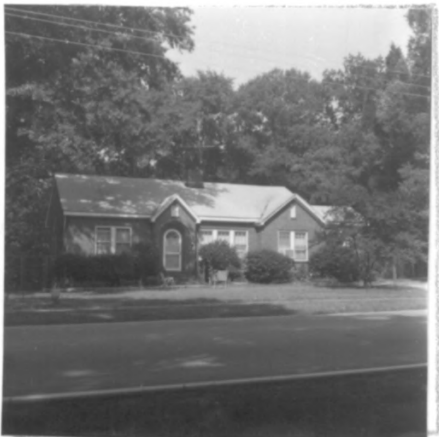
A.H. Baldwin House (#45)