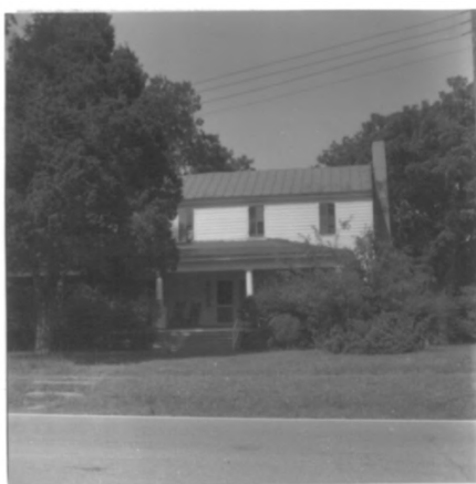
Sharpe-Agnew House (#44)