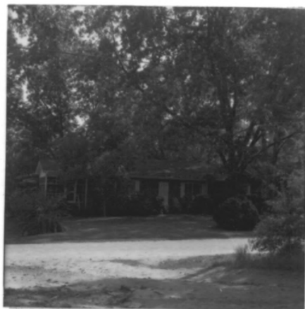
Agnes Plaxco House (#81)