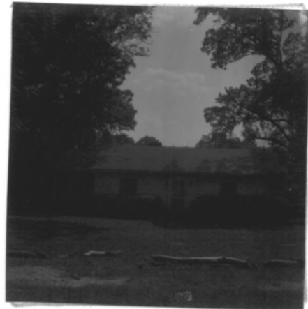
Jean Pressly House (#50)