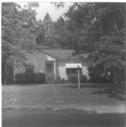
Sallie Kennedy House (#79)