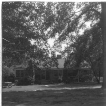
Professor Strong House (#82)