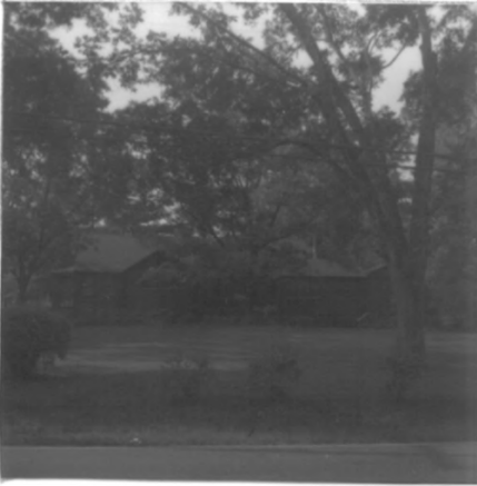
Able-Humphrey House (#3)