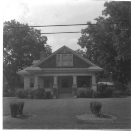
Janette Crawford House (#4)