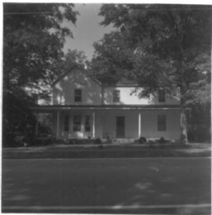
Leith-Logan House (#46)