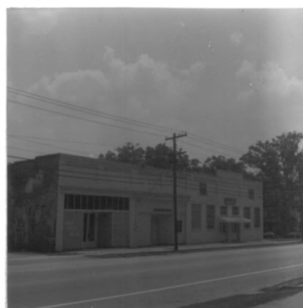
Art Department Building (#59) Main Street Theater (#60A) Exhibition Center (#60B)