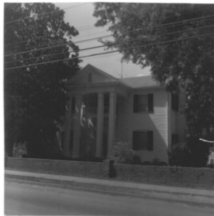
Miller-Bonner House (#74)