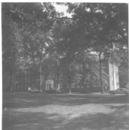
Robinson Hall Dormitory (#90) Woman's College Circle