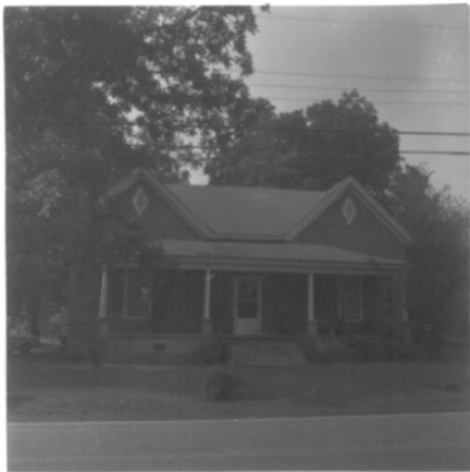
McIlwaine-Ashley House (#5)