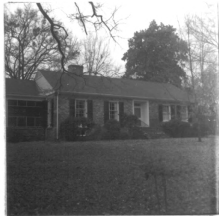
Andrus House (#14)