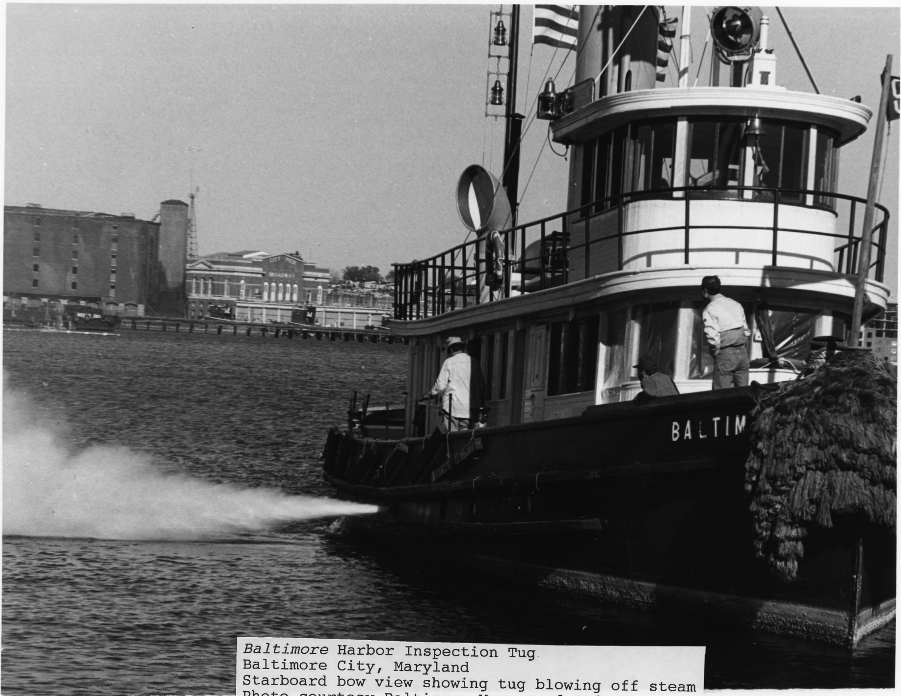
Baltimore Harbor Inspection Tug. Baltimore City, Maryland Starboard bow view showing tug blowing off steam ca. 1989 Photo # 8