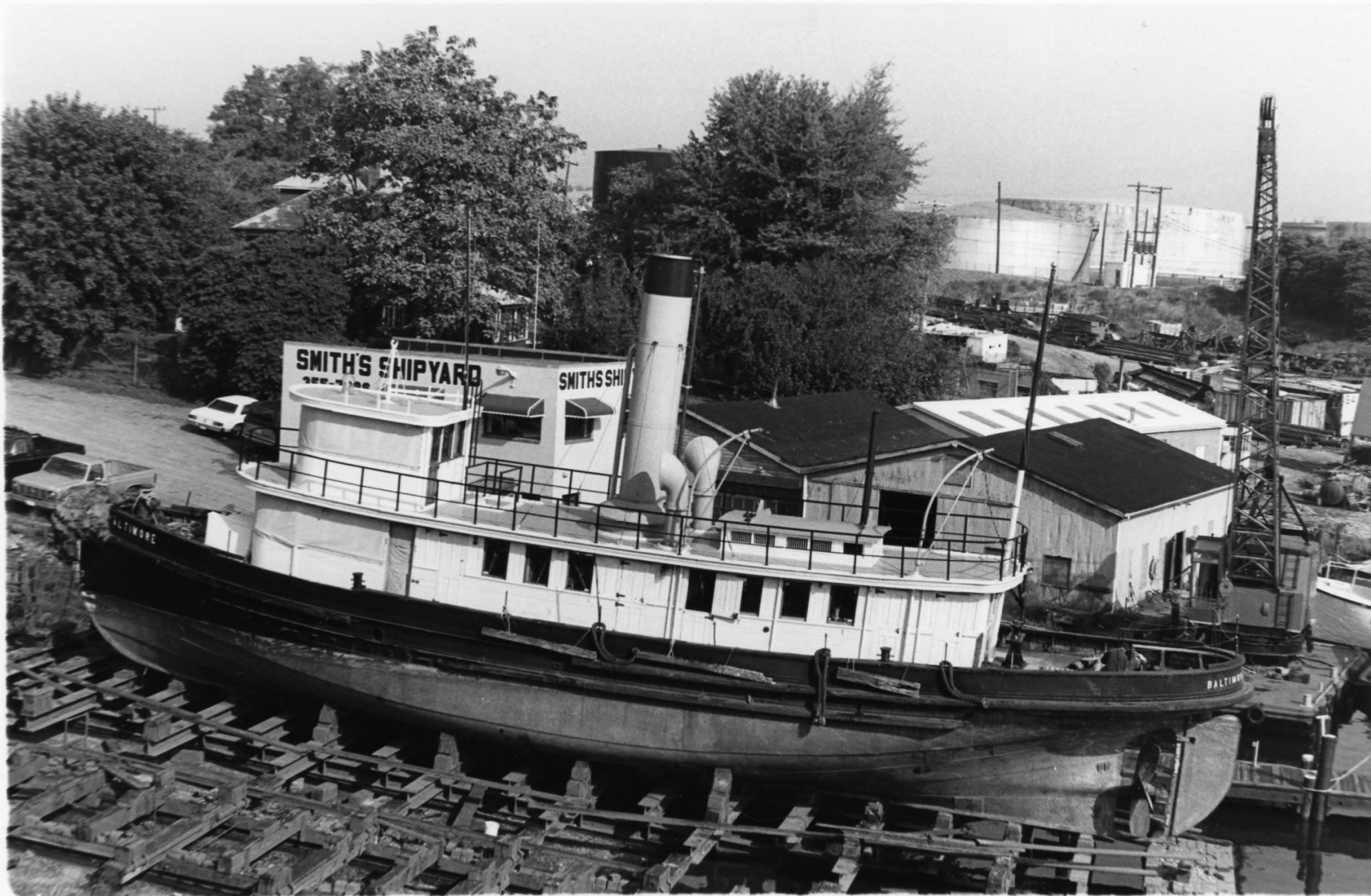
Baltimore Harbor Inspection Tug Baltimore City, Maryland Elevated broadside view on marine railway ca. 1989 Photo # 3