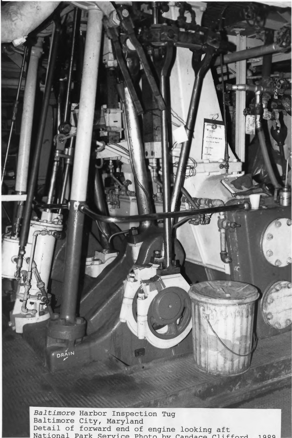
Baltimore Harbor Inspection Tug Baltimore City, Maryland Detail of forward end of engine looking aft National Park Service Photo by Candace Clifford, 1989 Photo # 7