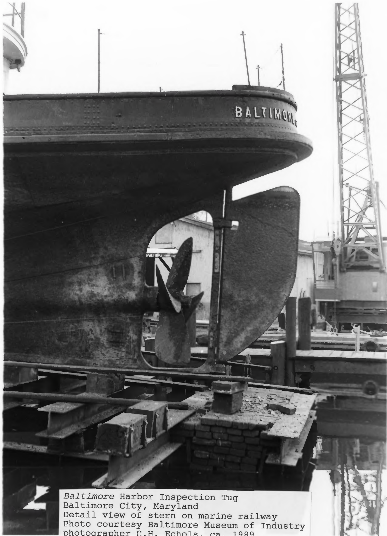
Baltimore Harbor Inspection Tug Baltimore City, Maryland Detail view of stern on marine railway Photo courtesy Baltimore Museum of Industry photographer C.H. Echols, ca. 1989 Photo # 5