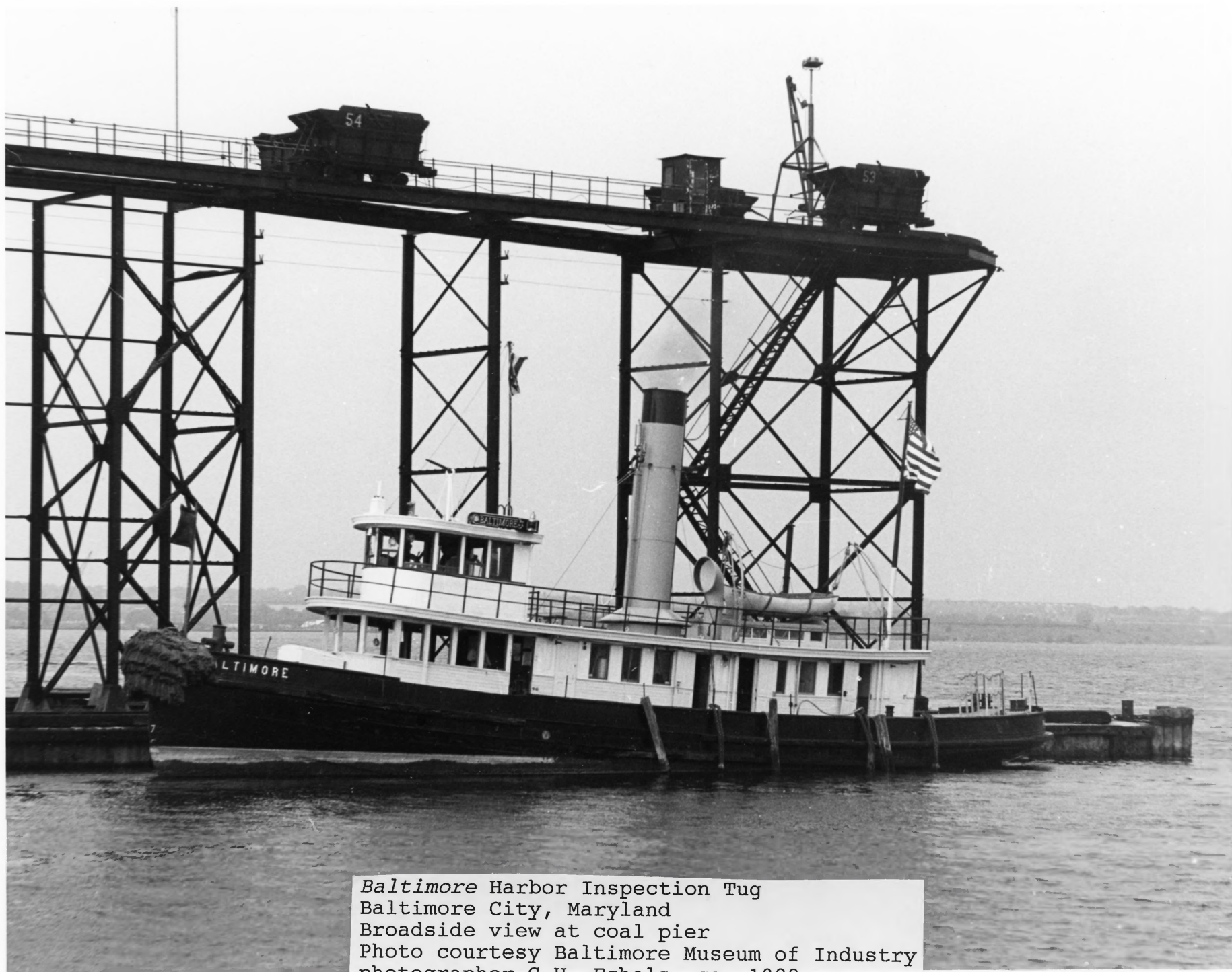
Baltimore Harbor Inspection Tug Baltimore City, Maryland Broadside view at coal pier ca. 1988 Photo # 1