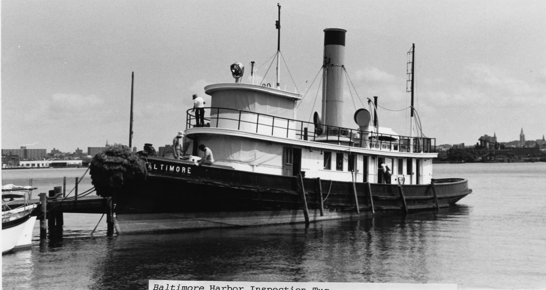
Baltimore Harbor Inspection Tug Baltimore City, Maryland Bow quarter view at museum pier National Park Service Photo by Candace Clifford, 1989 Photo # 2