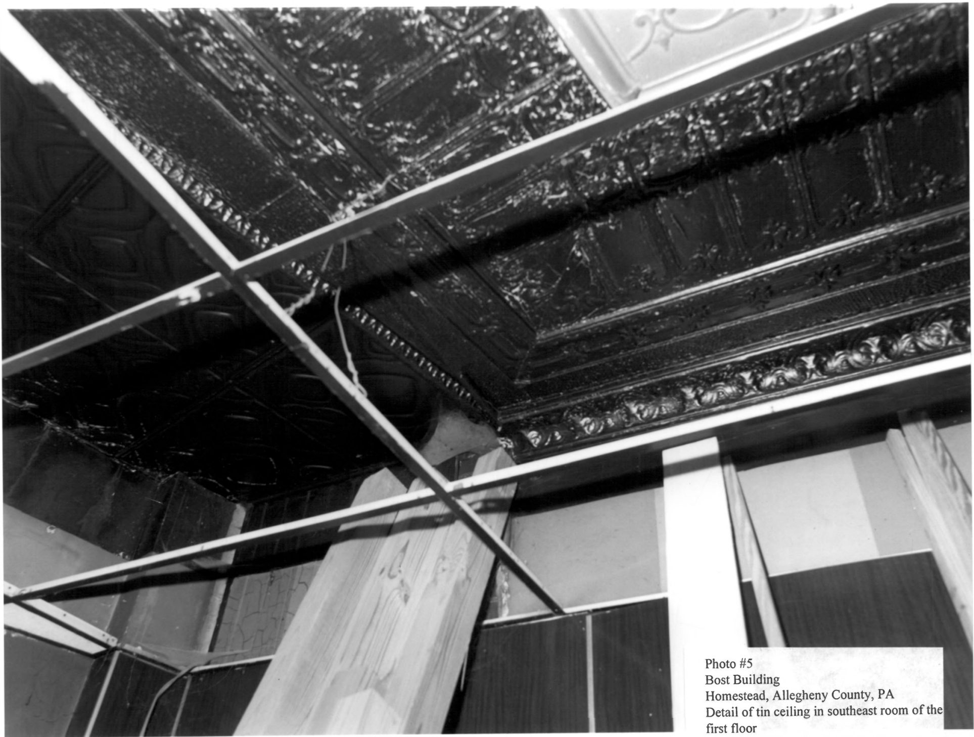
Photo #5 Bost Building Homestead, Allegheny County, PA Detail of tin ceiling in southeast room of the first floor Photo: Charles Uhl, April 1998