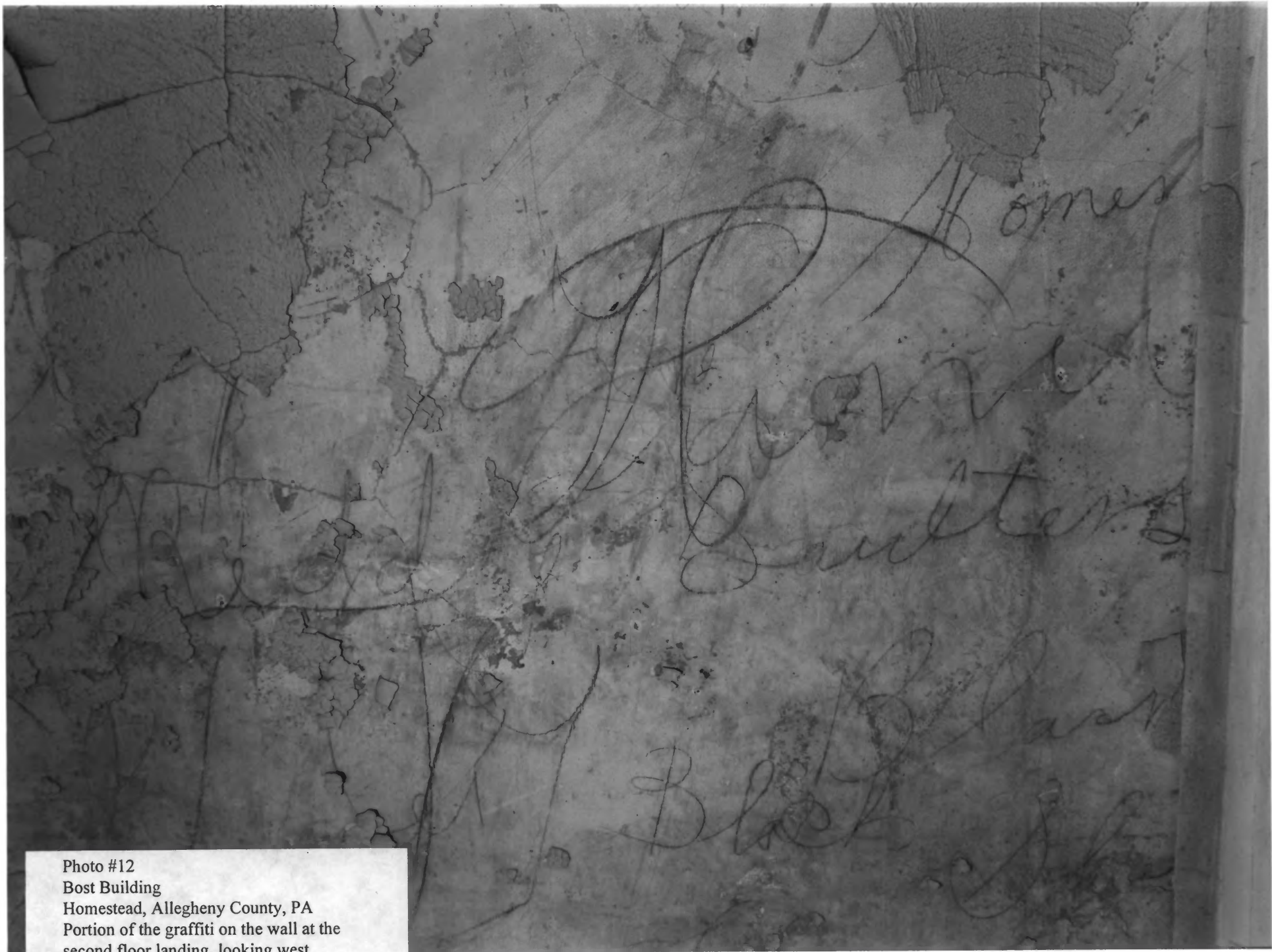
Photo #12 Bost Building Homestead, Allegheny County, PA Portion of the graffiti on the wall at the second floor landing, looking west Photo: Charles Uhl, April 1998