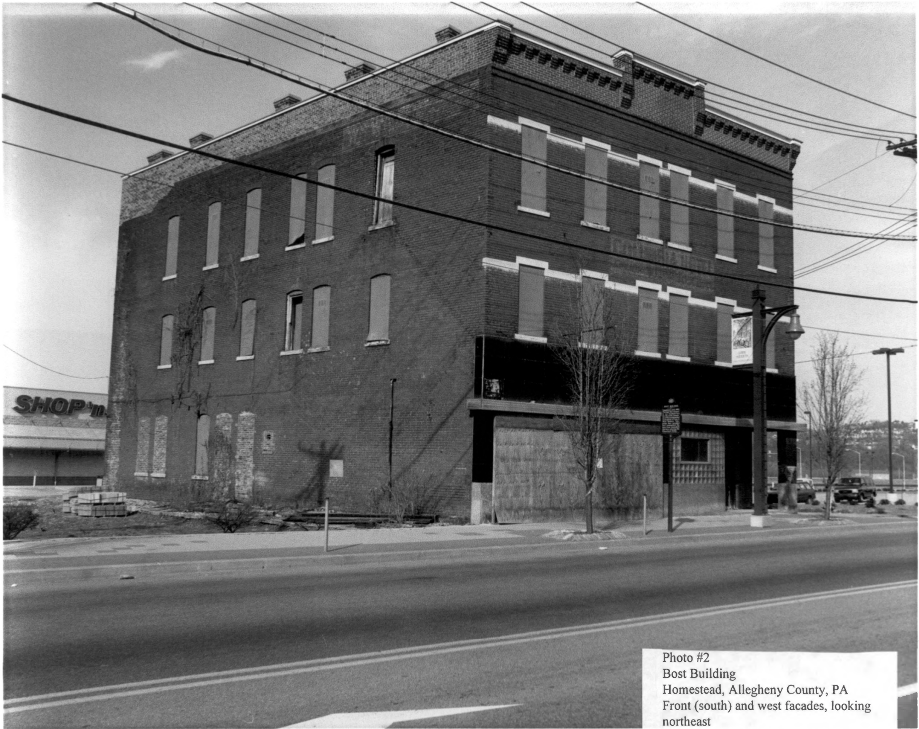
Photo #2 Bost Building Homestead, Allegheny County, PA Front (south) and west facades, looking northeast Photo: Charles Uhl, March, 1998