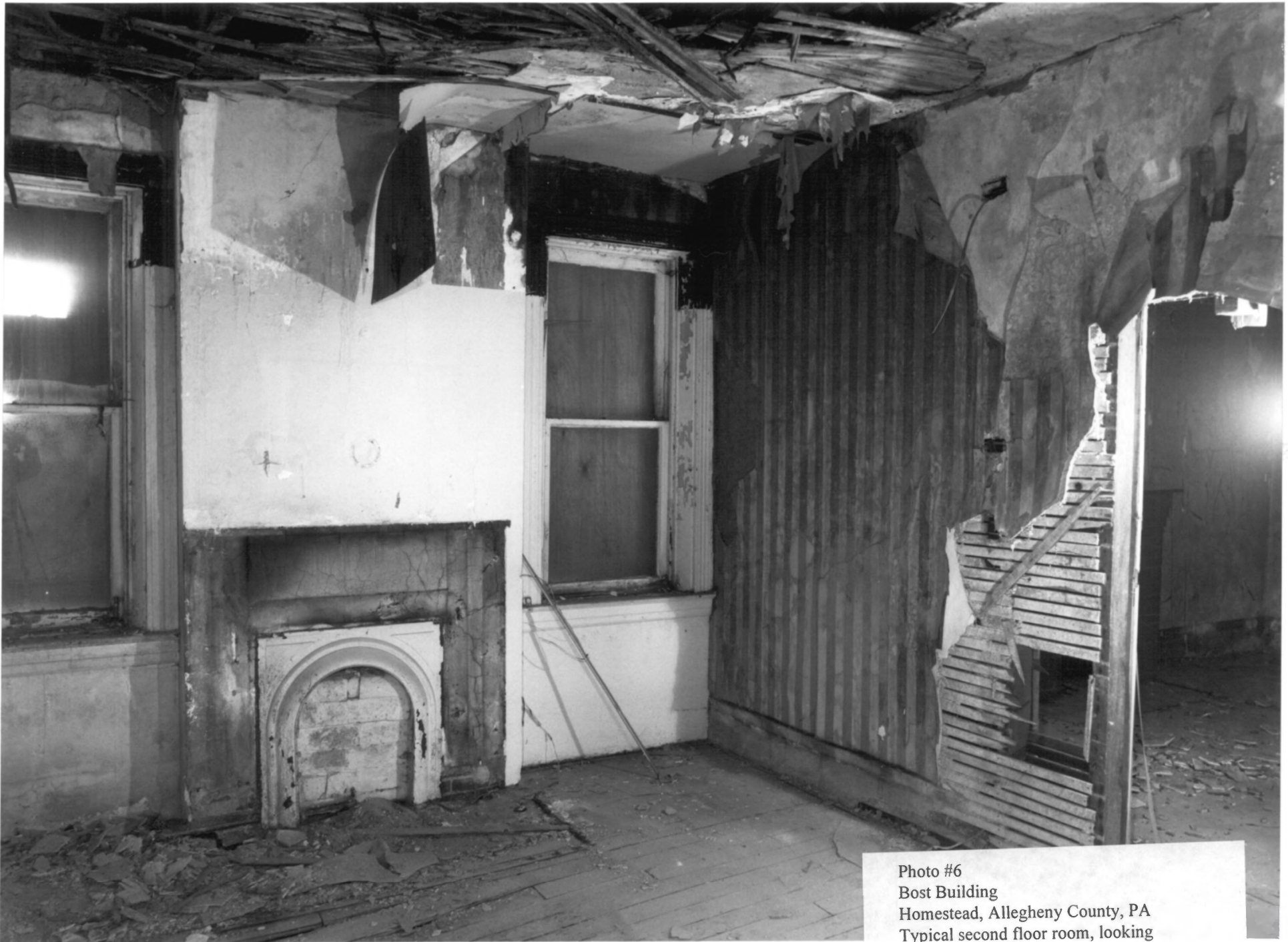
Photo #6 Bost Building Homestead, Allegheny County, PA Typical second floor room, looking southeast Photo: Charles Uhl, April 1998