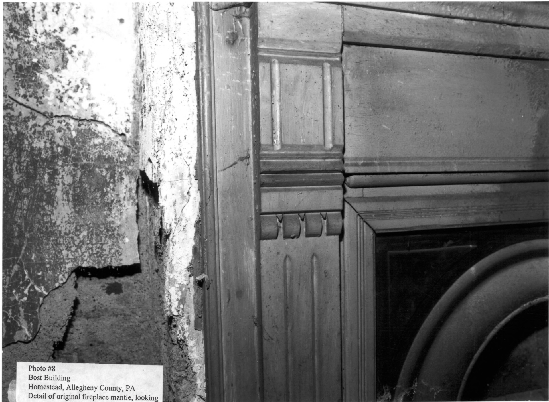
Photo #8 Bost Building Homestead, Allegheny County, PA Detail of original fireplace mantle, looking west