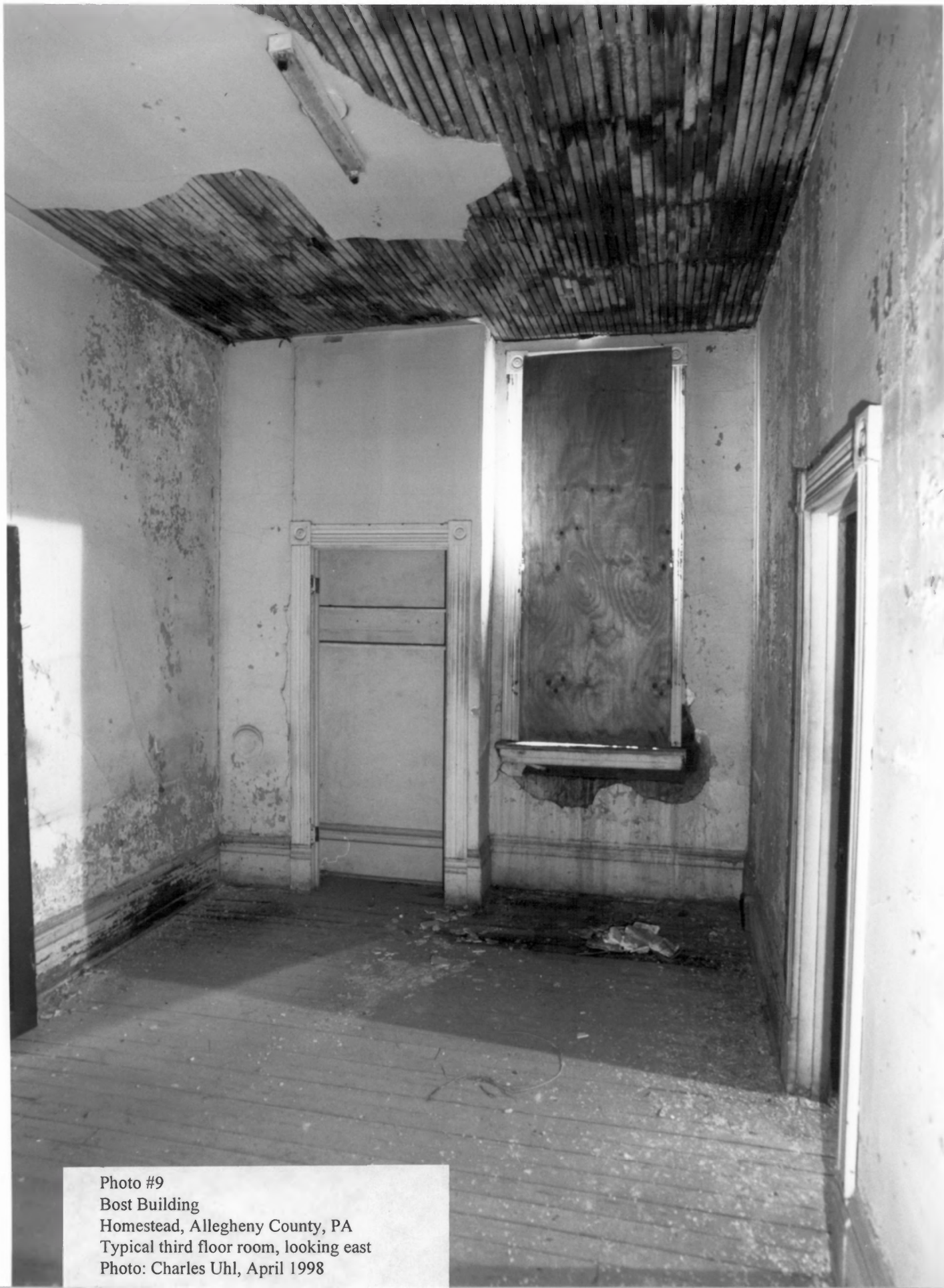
Photo #9 Bost Building Homestead, Allegheny County, PA Typical third floor room, looking east