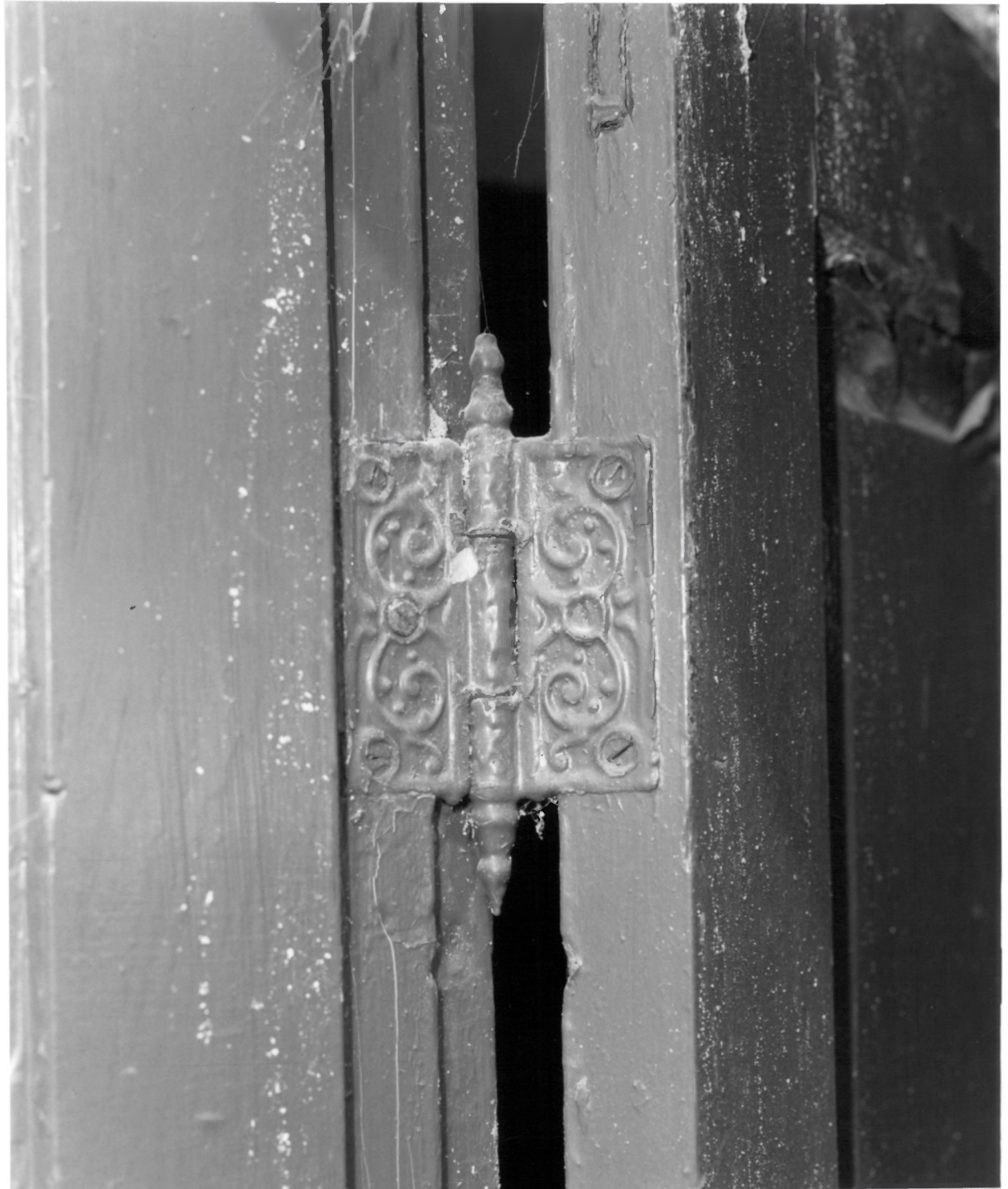
Photo #7 Bost Building Homestead, Allegheny County, PA Detail of door hinge on second floor, looking southeast Photo: Charles Uhl, April 1998