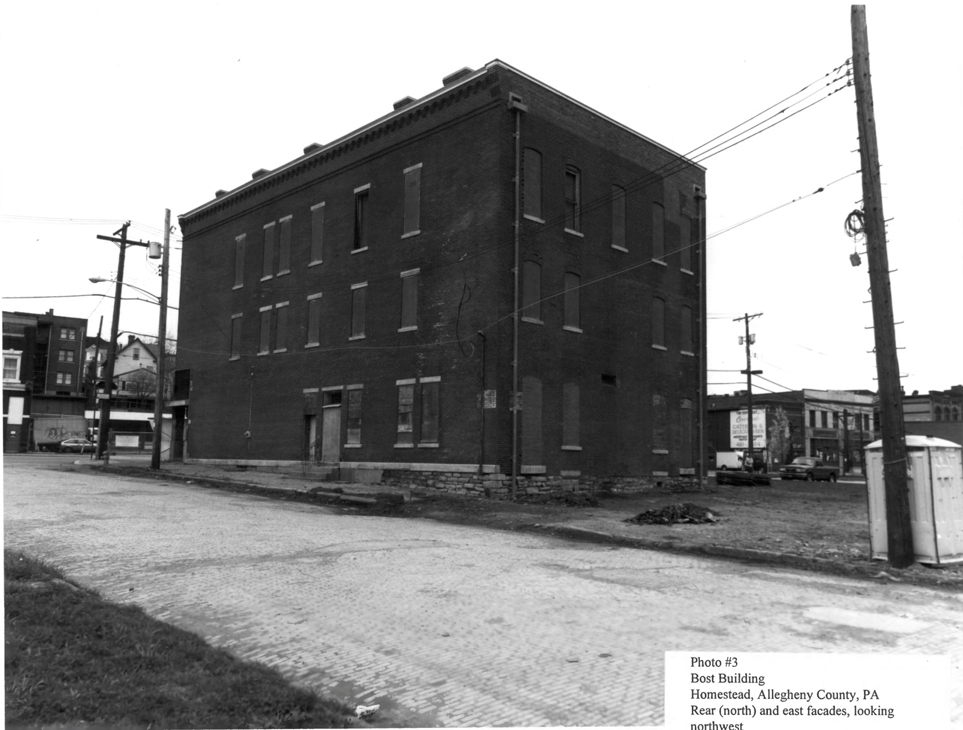
Photo #3 Bost Building Homestead, Allegheny County, PA Rear (north) and east facades, looking northwest