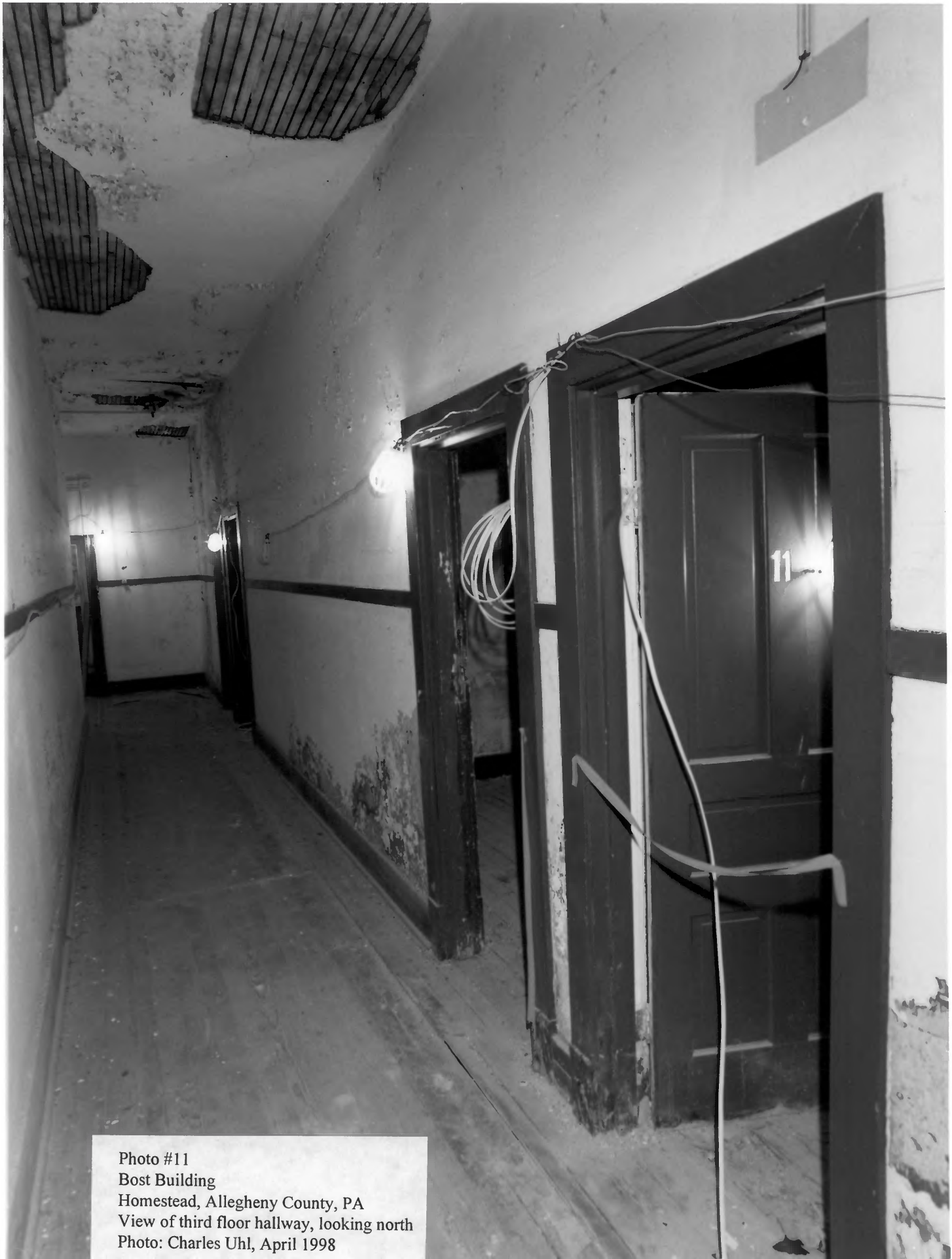
Photo #11 Bost Building Homestead, Allegheny County, PA View of third floor hallway, looking north Photo: Charles Uhl, April 1998