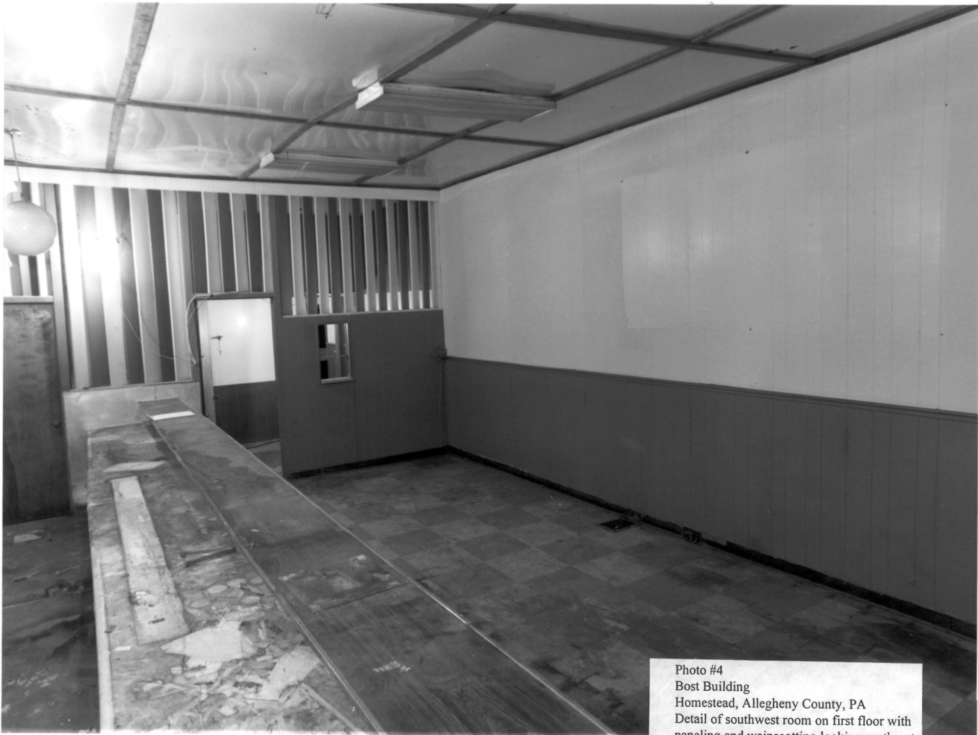
Photo #4 Bost Building Homestead, Allegheny County, PA Detail of southwest room on first floor with paneling and wainscotting looking northeast Photo: Charles Uhl, April 1998