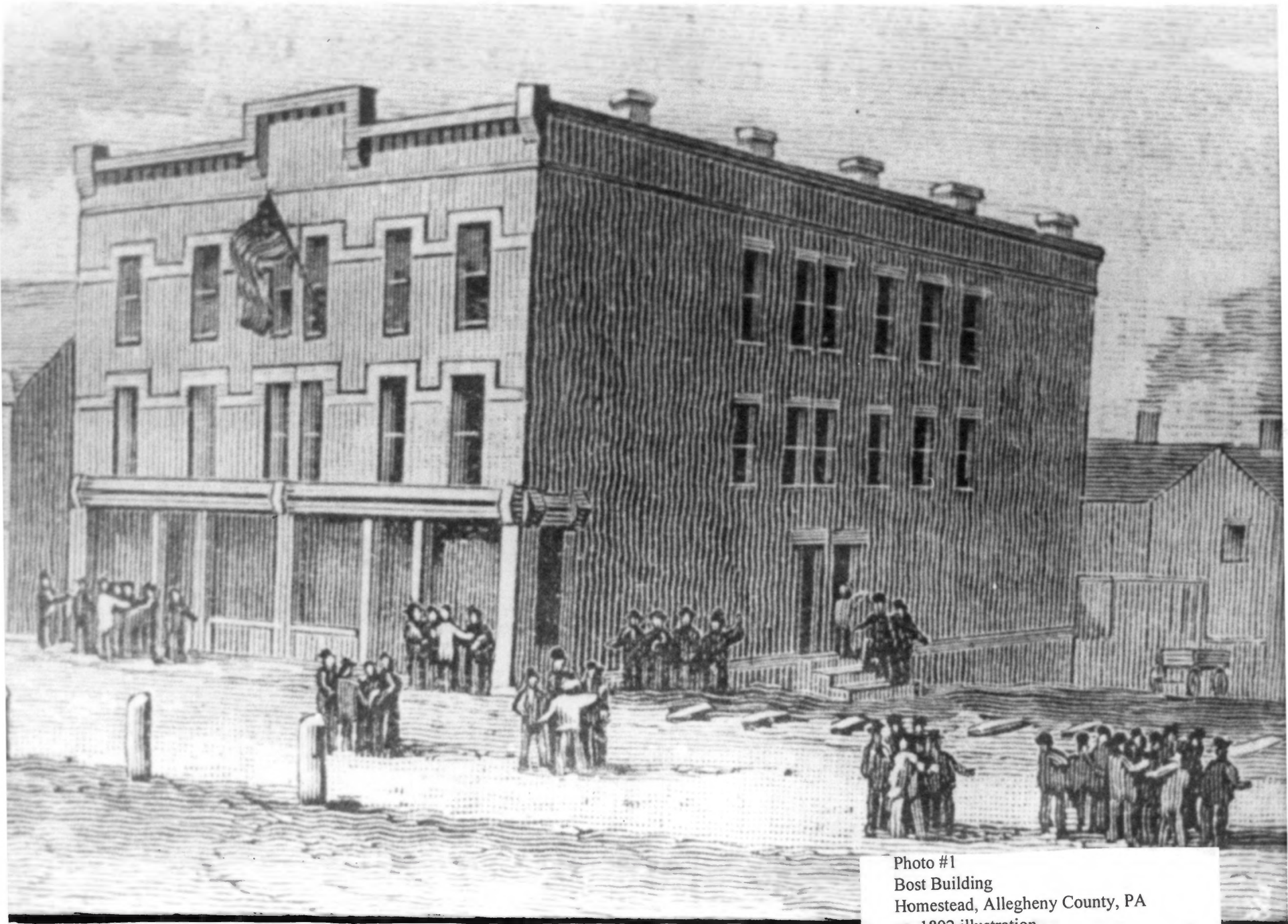
Photo #1 Bost Building Homestead, Allegheny County, PA ca. 1892 illustration source unknown