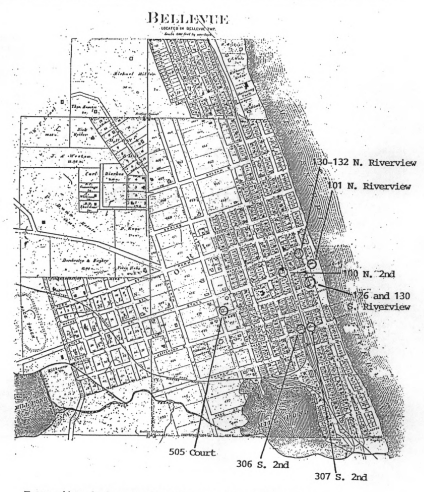
Town sites being nominated with this submission.