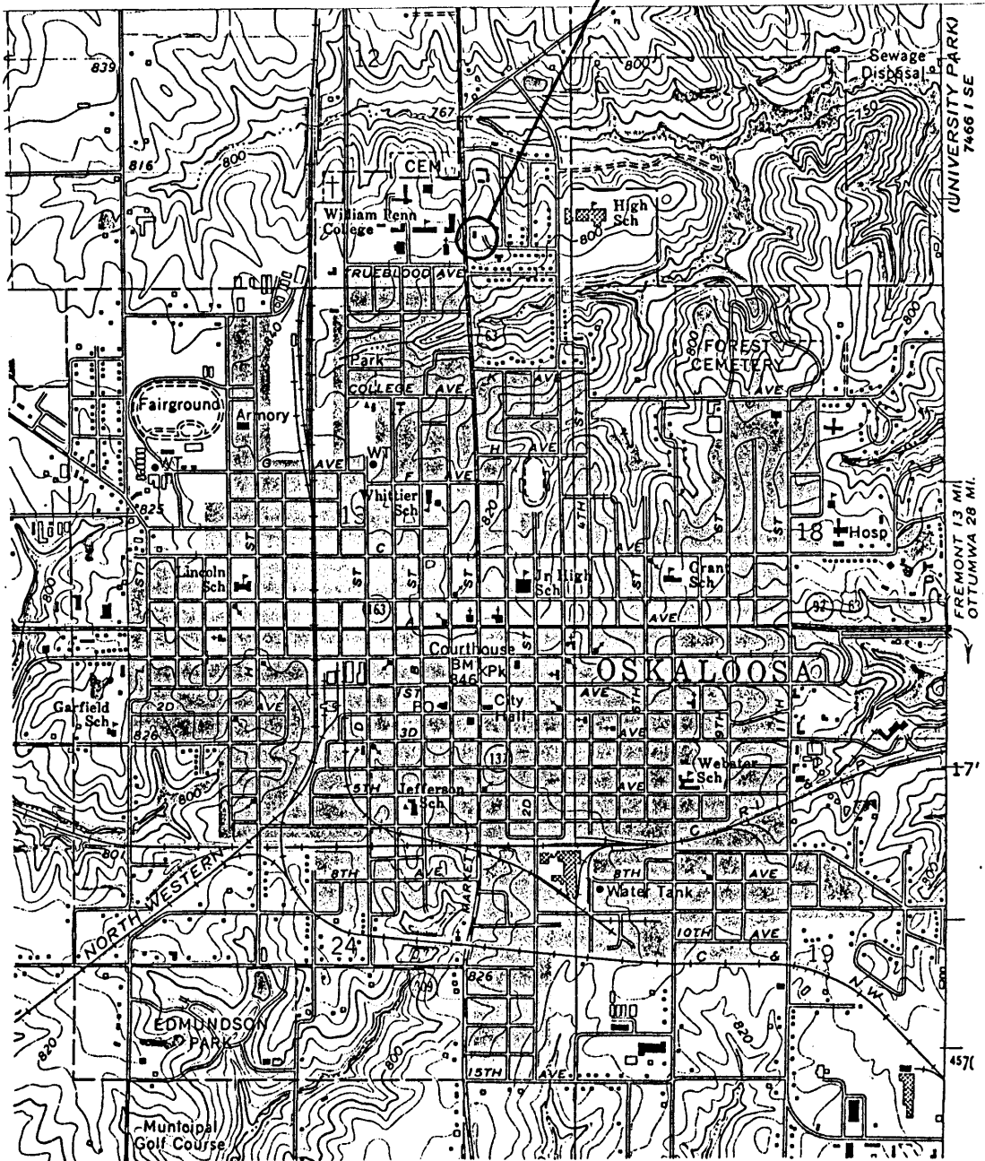
USGS Map 41092 (C6): Oskaloosa Quad