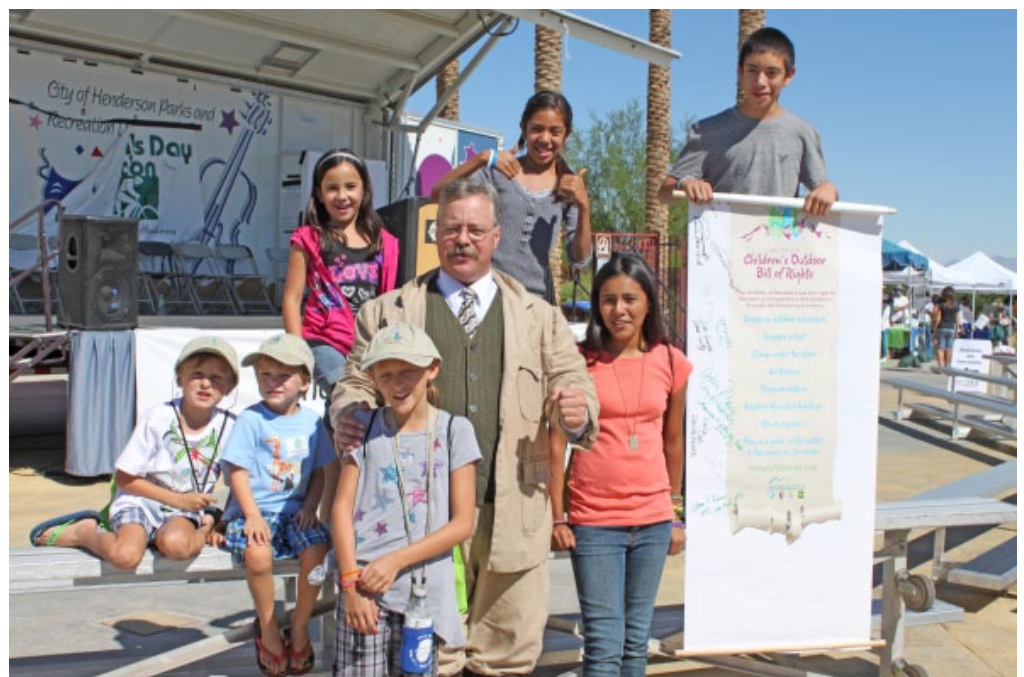
Local youth and "Teddy Roosevelt" present the Nevada Children's Outdoor Bill of Rights.

Initial funding for website development and the advertising campaign, which includes radio spots, billboards, print ads, and a movie trailer, was provided by the Southern Nevada Public Lands Management Act and the Southern Nevada Agency Partnership.