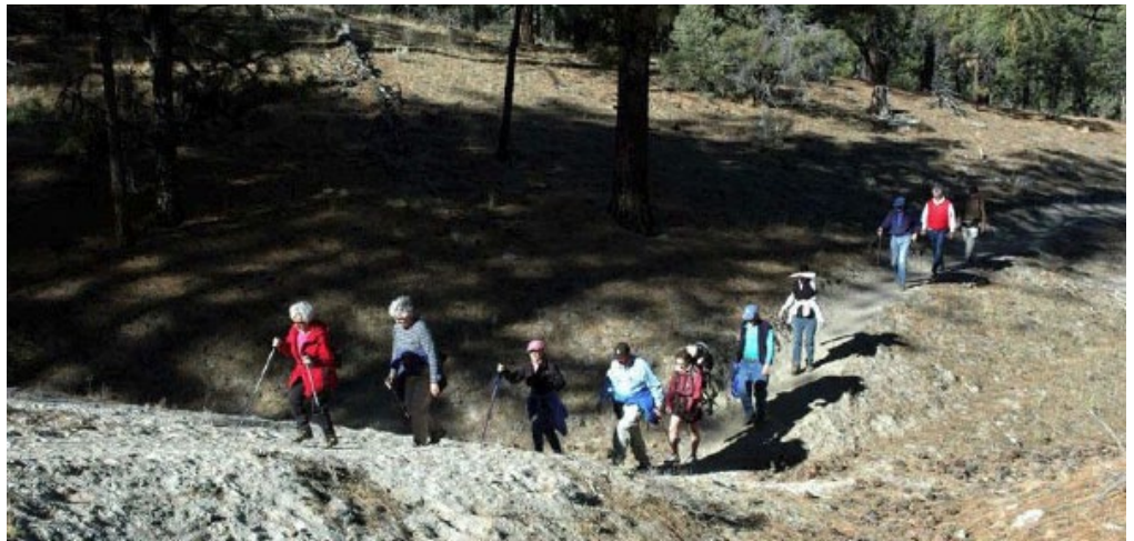
Hikers participate in the Carson Valley Trail Hike for Health event in Genoa, NV.

The Carson Valley Trail is envisioned to be a loop trail that will traverse the foothills around the Carson Valley. This regional trail crosses BLM, US Forest Service and potentially private lands and includes connections to the Pony Express National Historic Trail and the Tahoe Rim Trail.