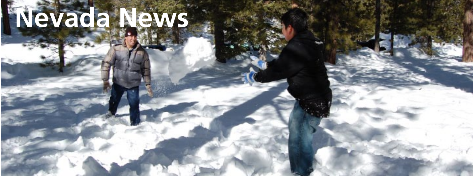
Winchester Cultural Center families play in the snow, one of the Nevada Children's Outdoor Bill of Rights activities.