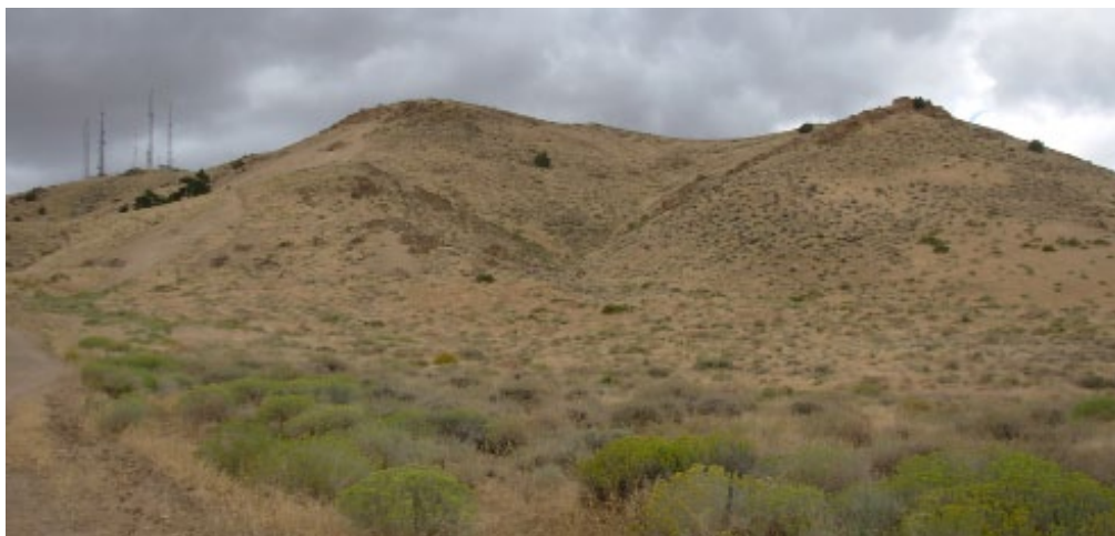
Desert plants bloom at Red Hill near Reno, Nevada.

RTCA will advise on methods for developing interpretive plans and provide input on user surveys and data collection efforts.