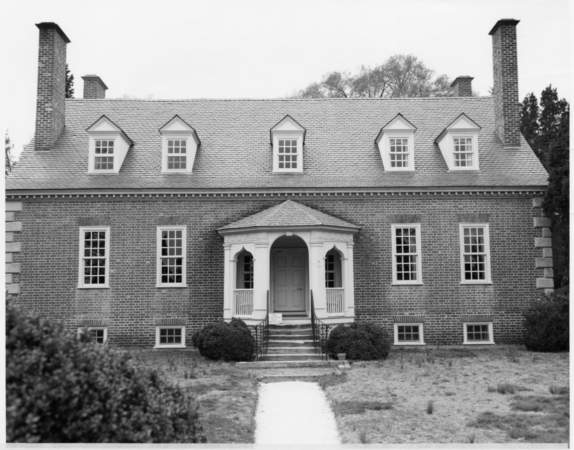
Gunston Hall, South Elevation, Virginia