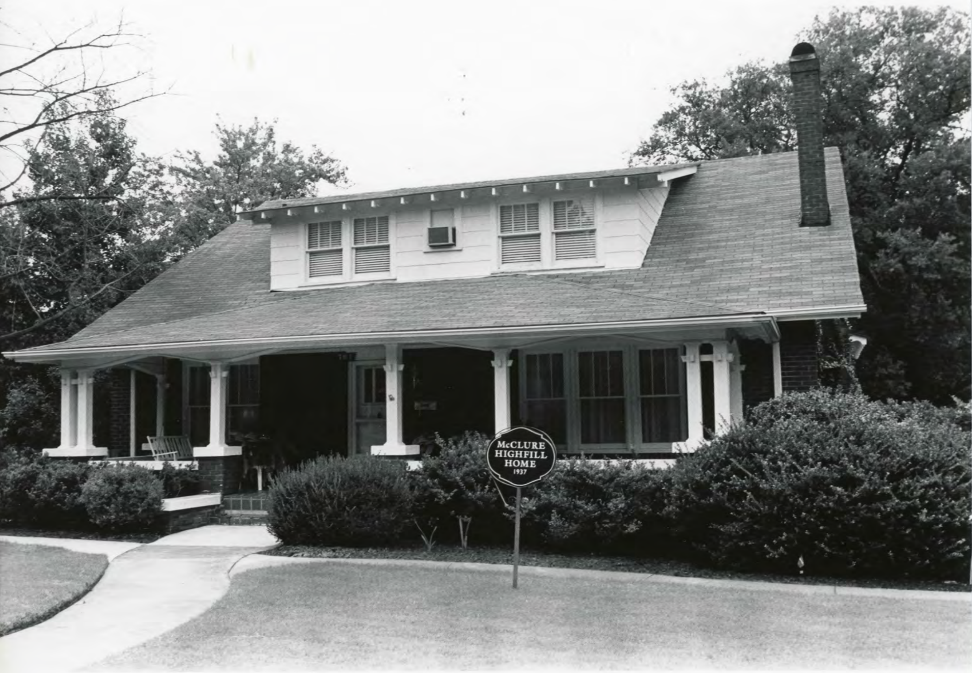
McCLURE HIGHFILL HOME 1937