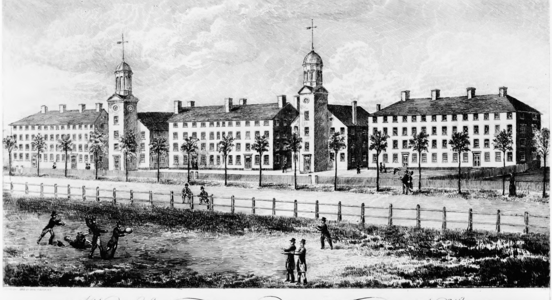
A View of the BUHLIDHNGS of WALLE COLLEGE at New Haven