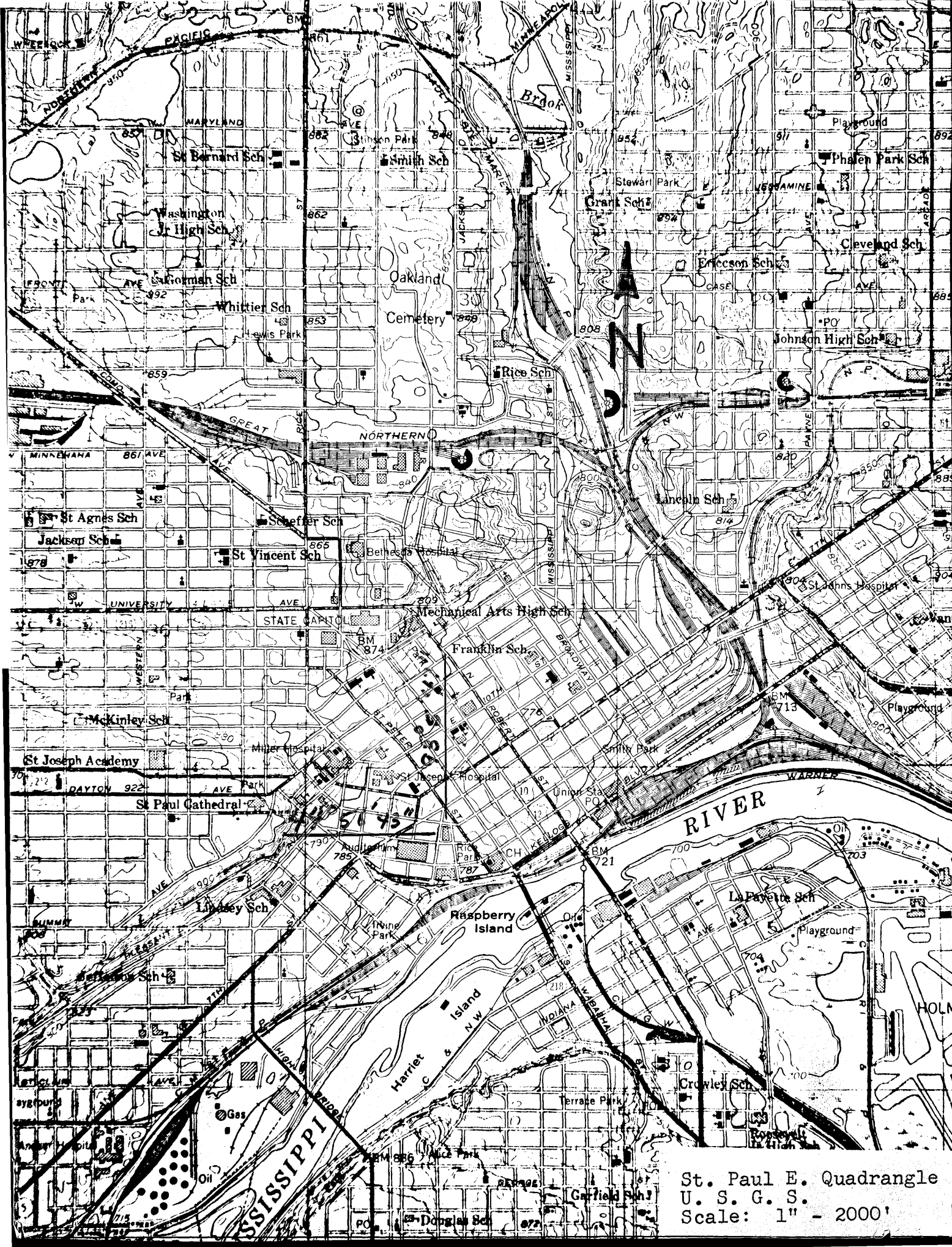
St. Paul E. Quadrangle U. S. G. S. Scale: 1" - 2000'