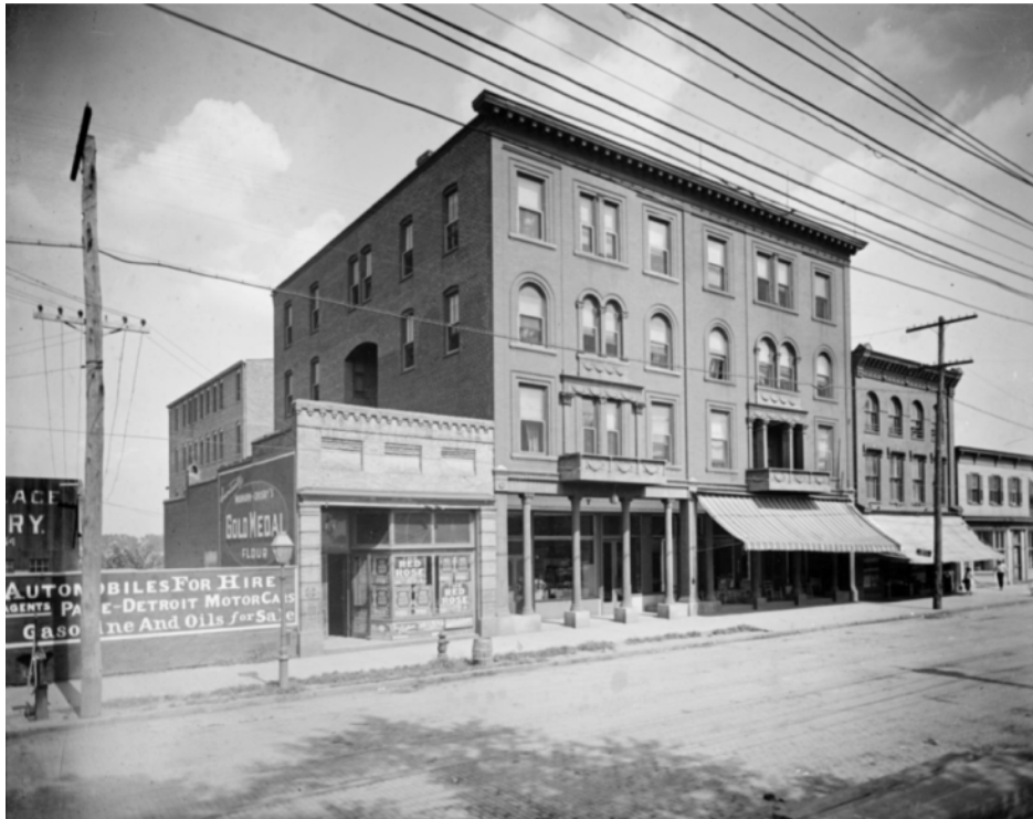
showing the Hotel Gleason/Albemarle Hotel (104-0374; 104-0083-0030).

City of Charlottesville, VA County and State