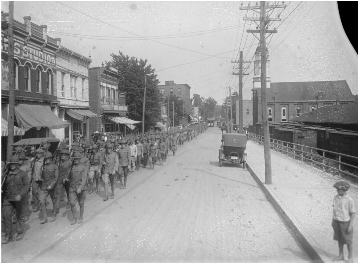
showing West Main Street with Monticello Guard, looking east. Delevan Church is on the right.

City of Charlottesville, VA County and State