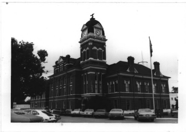
WASHINGTON COUNTY COURTHOUSE