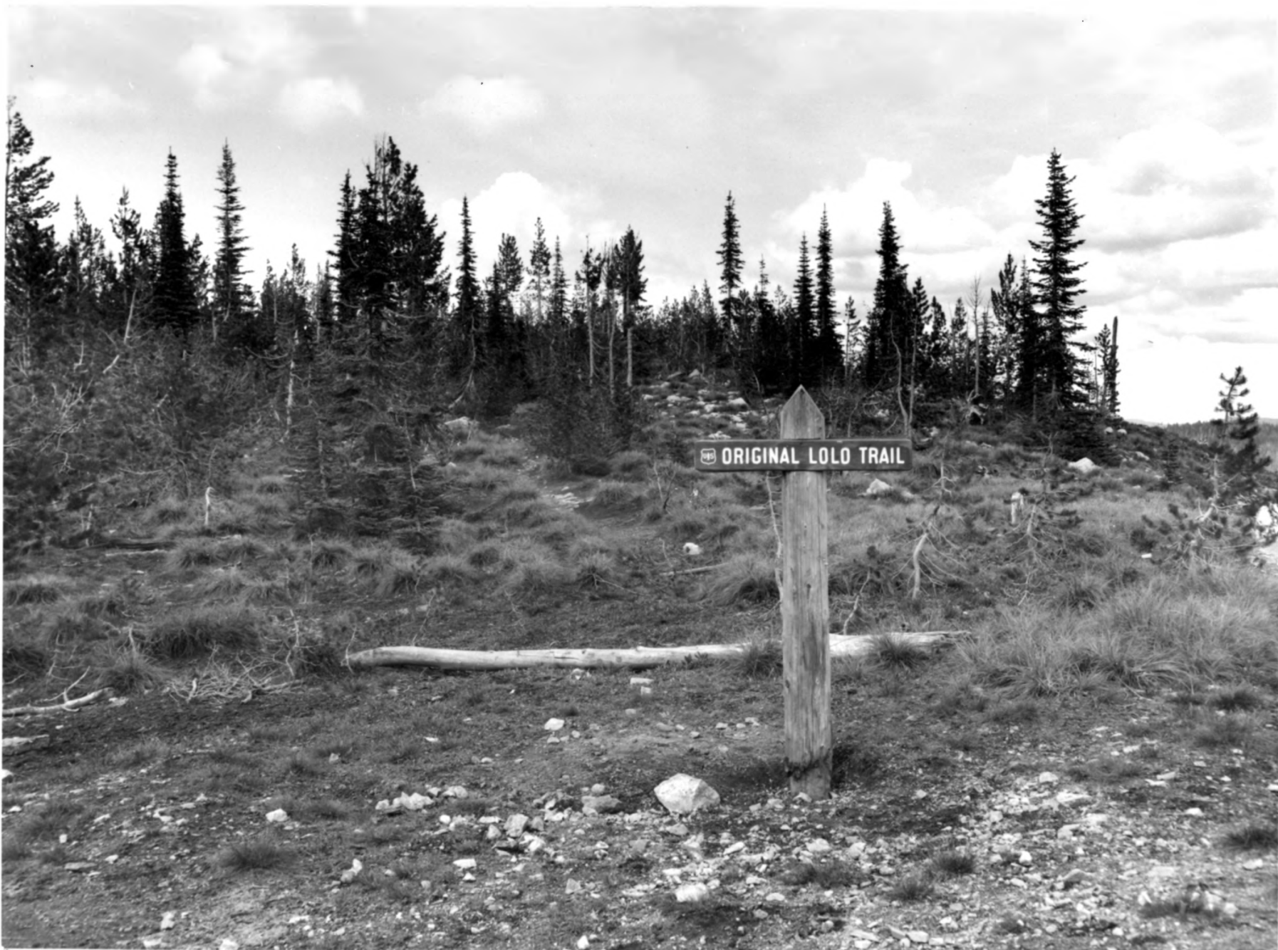
LOLO TRAIL, Idaho. This rugged Indian trail through the wilderness, followed by Lewis and Clark, was also used in 1877 during the Nez Perce War by Chief Joseph and General Howard's cavalry.