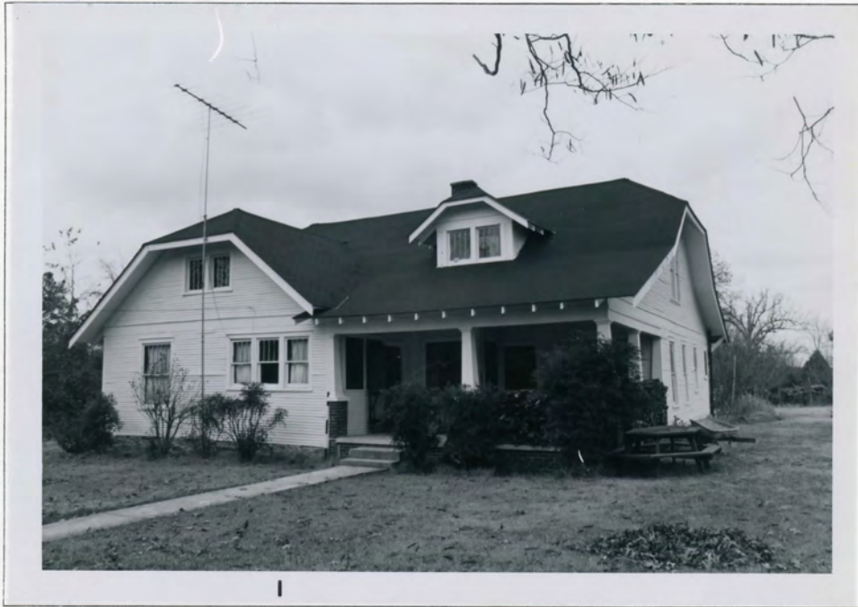
Historic Resources of Stone County John Bettis House, ST-43 Pleasant Grove 1983 Negative on file at the AHPP Viewed from the southwest