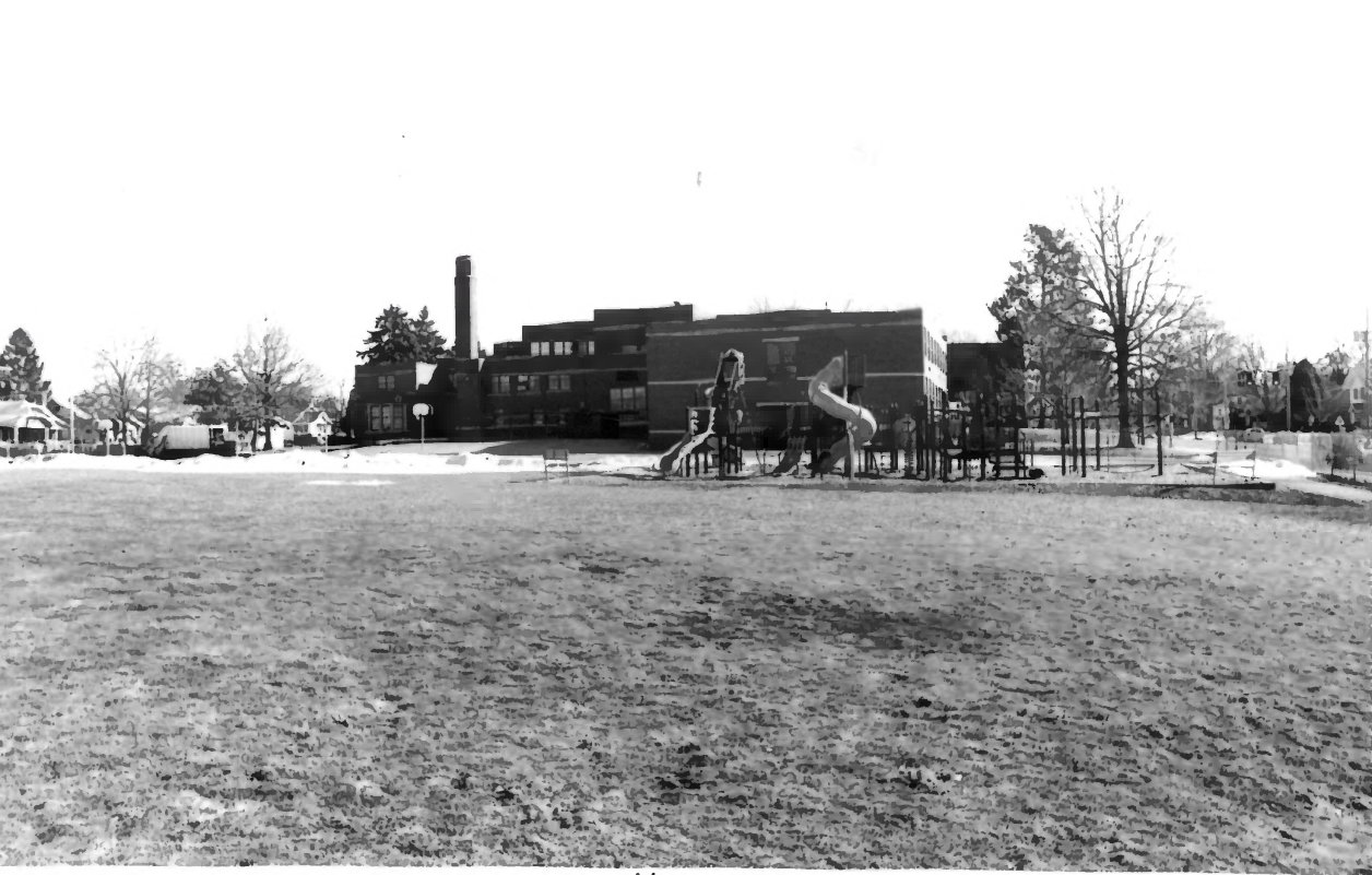
H. MCKINLEY ELEMENTARY: DAVENPORT, IOWA