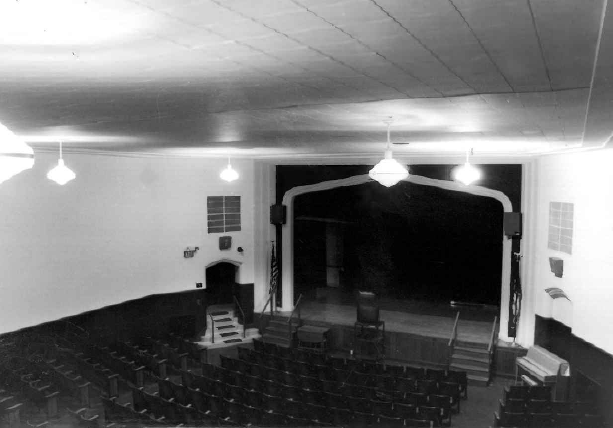
S. MCKINLEY ELEMENTARY: DAVENPORT, IOWA