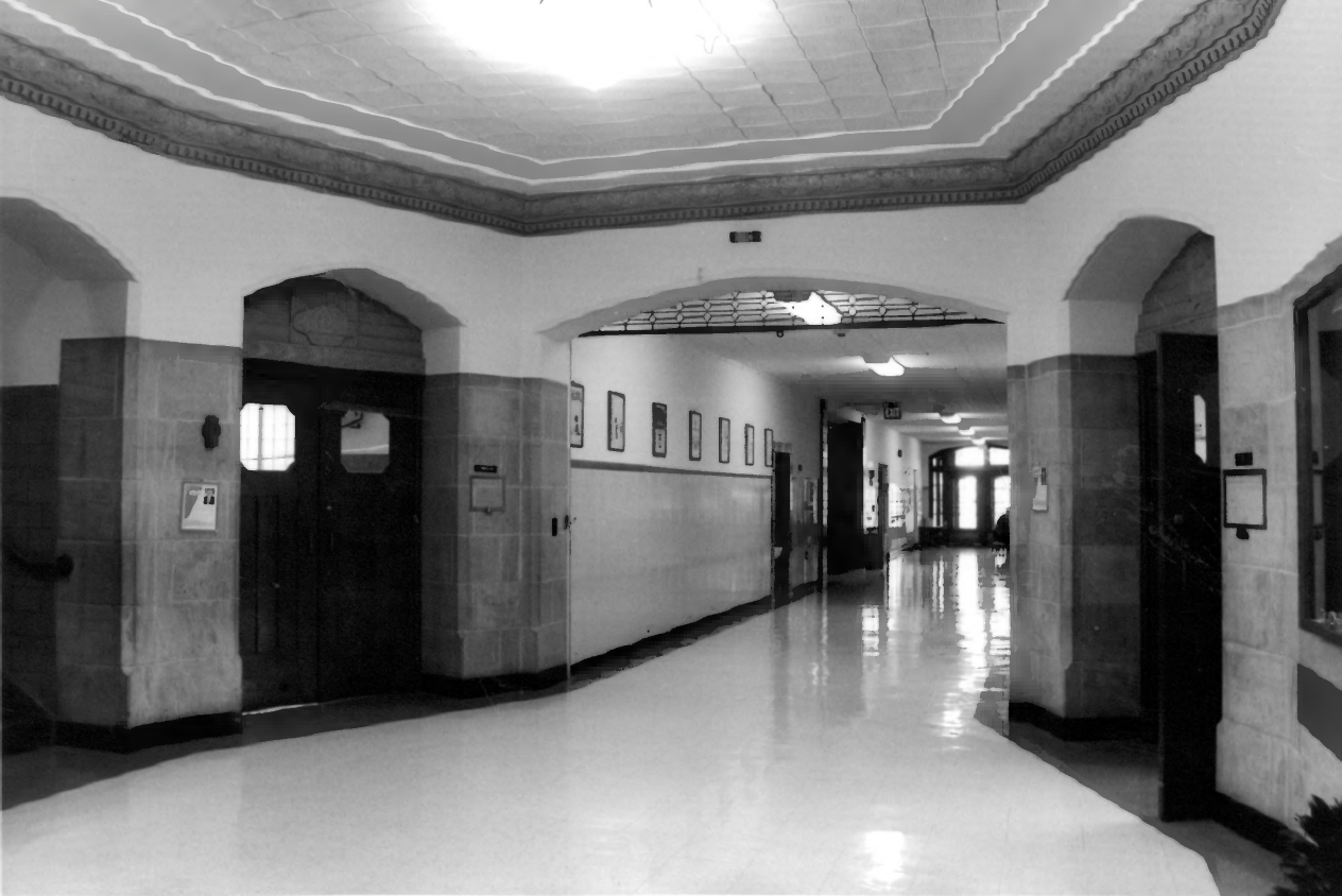
7. MCKINLEY ELEMENTARY: DAVENPORT, IOWA