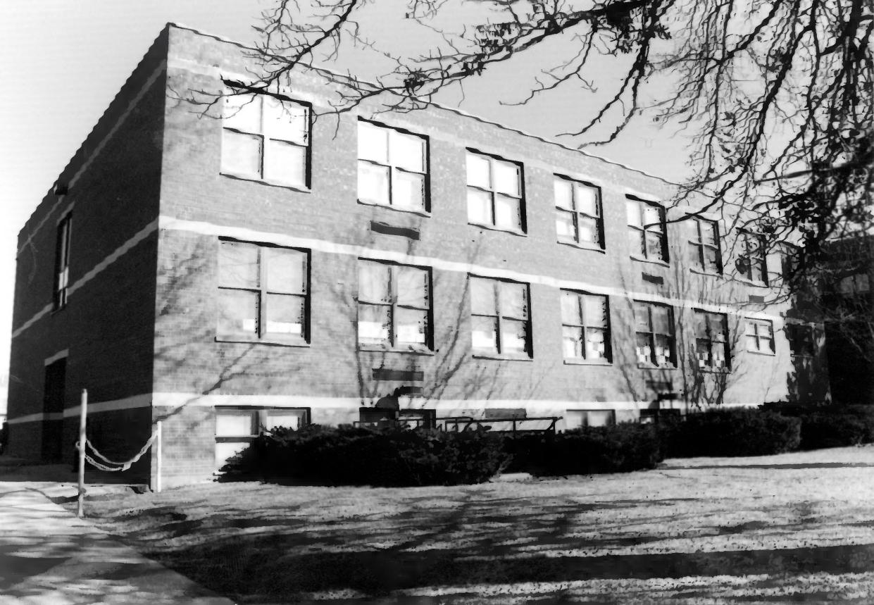
3. MCKINLEY ELEMENTARY: DAVENPORT, IOWA