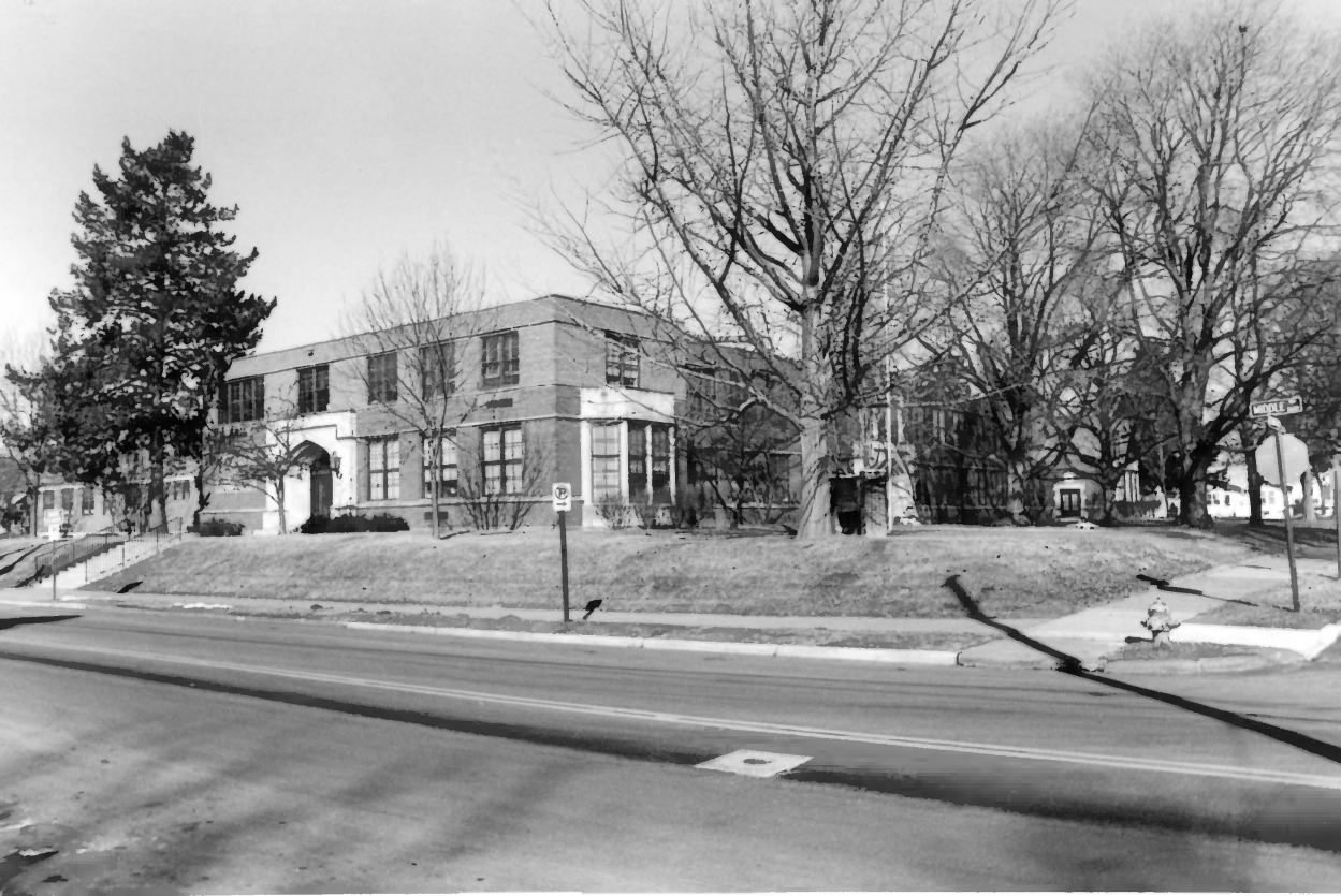
I. MCKINLEY ELEMENTARY: DAVENPORT, IOWA