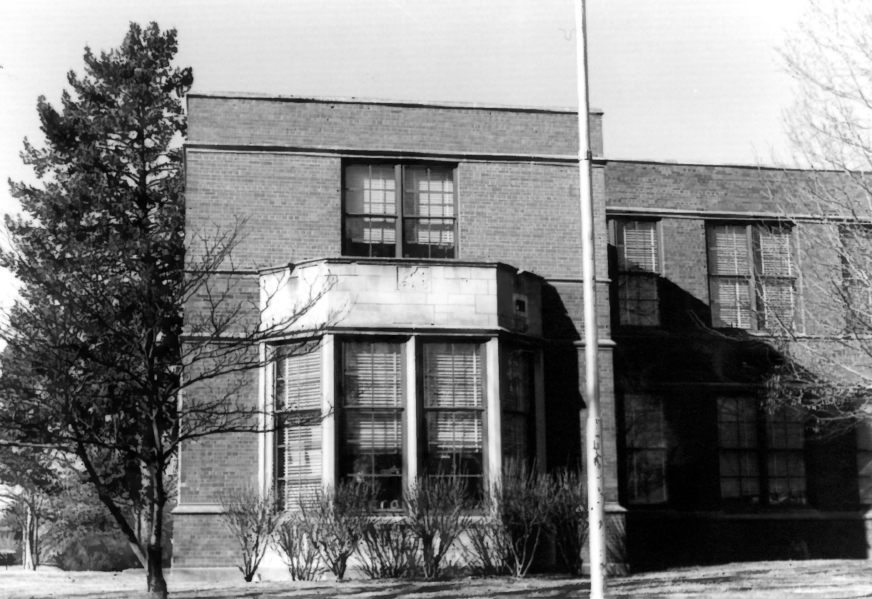
6. MCKINLEY ELEMENTARY : DAVENPORT, IOWA