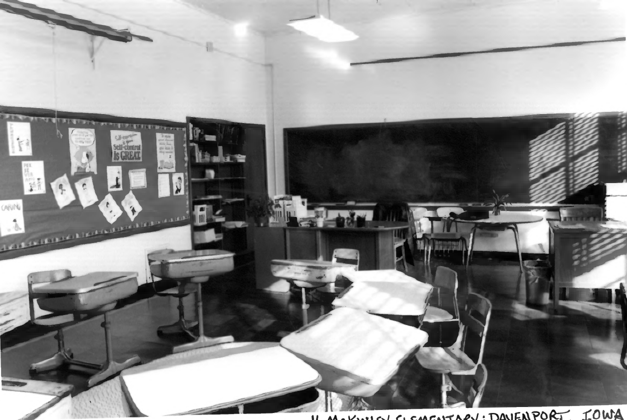
11. MCKINLEY ELEMENTARY: DANENPORT, IOWA