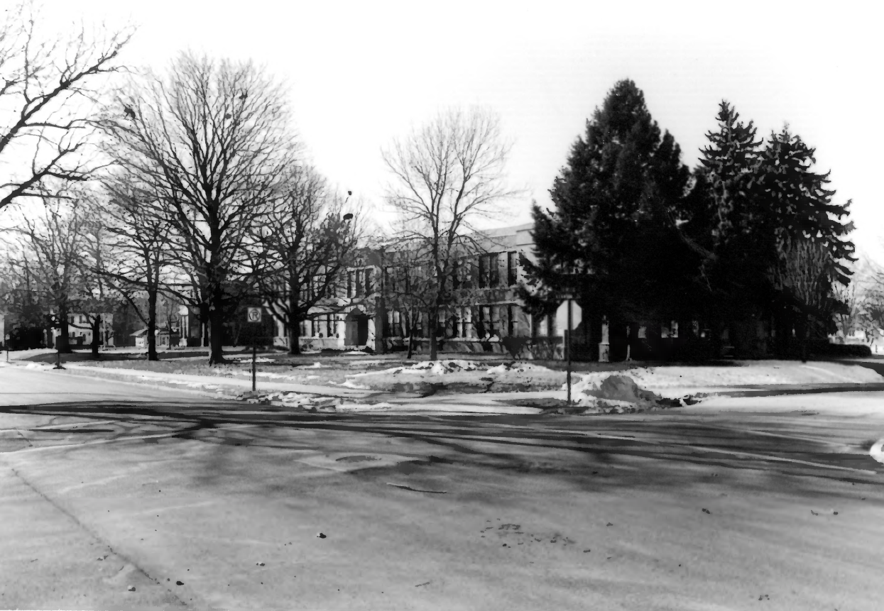
2. MCKINLEY ELEMENTARY : DAVENPORT, IOWA