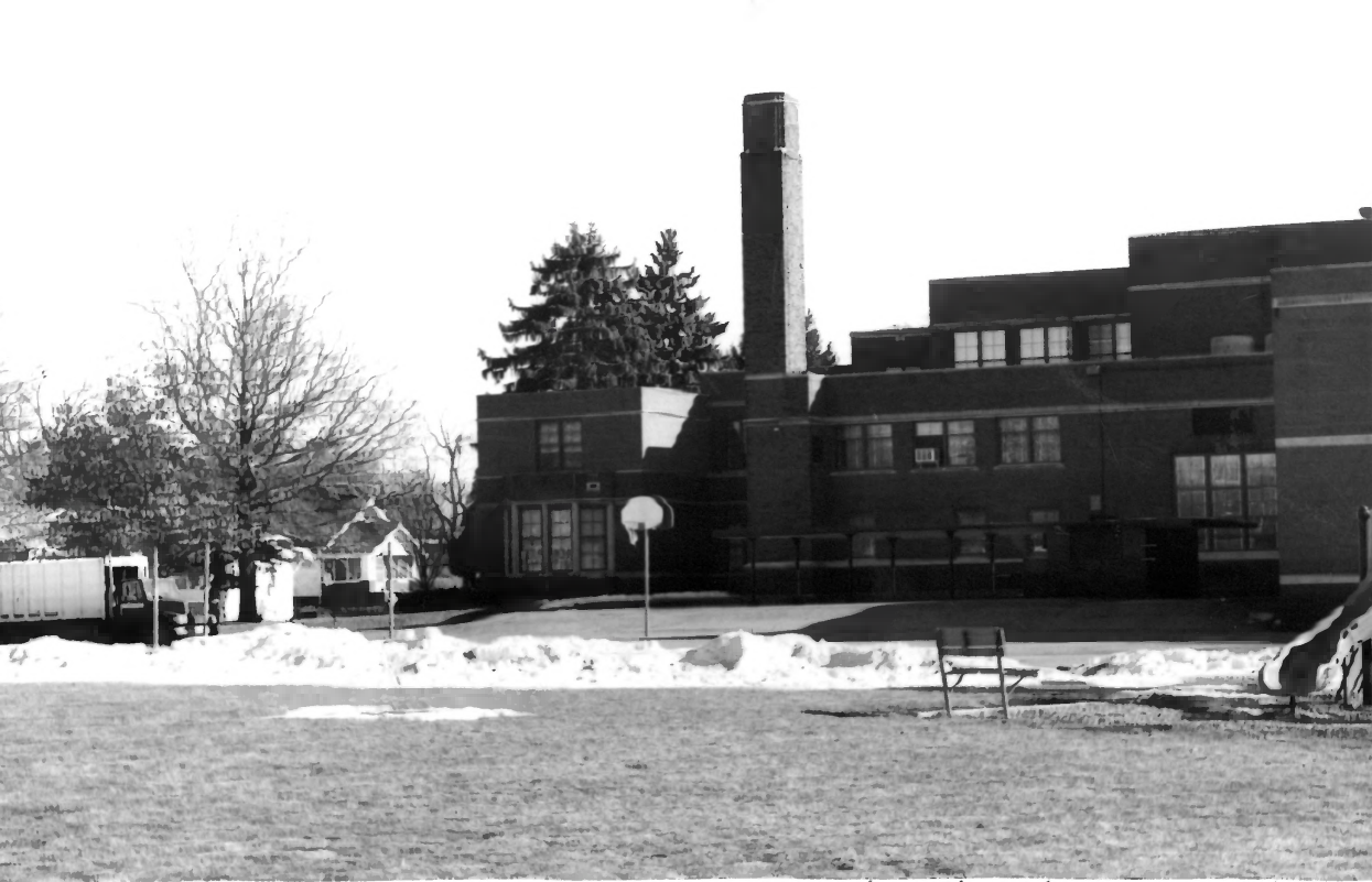
13. McKinley Elementary: Davenport, Iowa