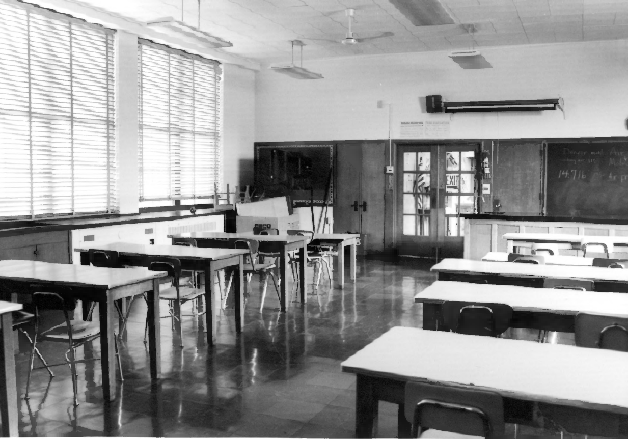
12. MCKINLEY ELEMENTARY: DAVENPORT, IOWA