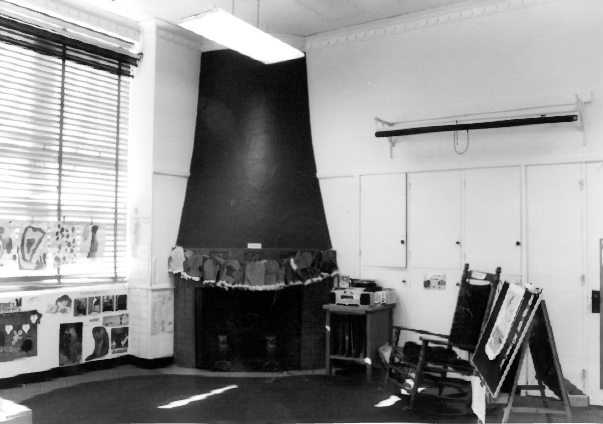
9. MCKINLEY ELEMENTARY : DAVENPORT, IOWA