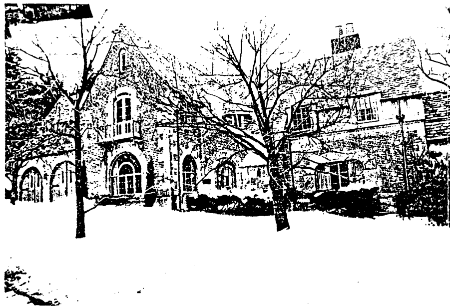
Negative File No. RC4, 5