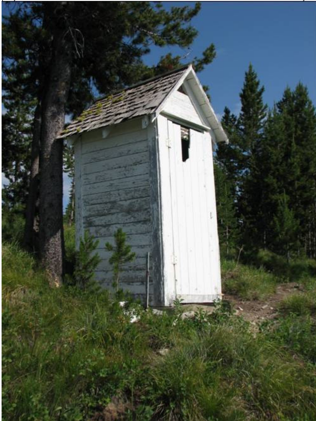
ID_IdahoCounty_GardinerPeakLookout_0009. Looking north-northwest to the southwest and southeast (front) walls of the outhouse.