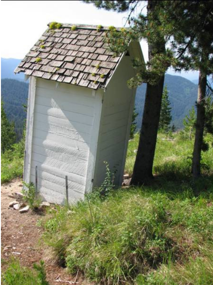
ID_IdahoCounty_GardinerPeakLookout_0010. Looking south-southeast to the northwest (rear) and northeast side of the outhouse.

Idaho County, Idaho County and State _____