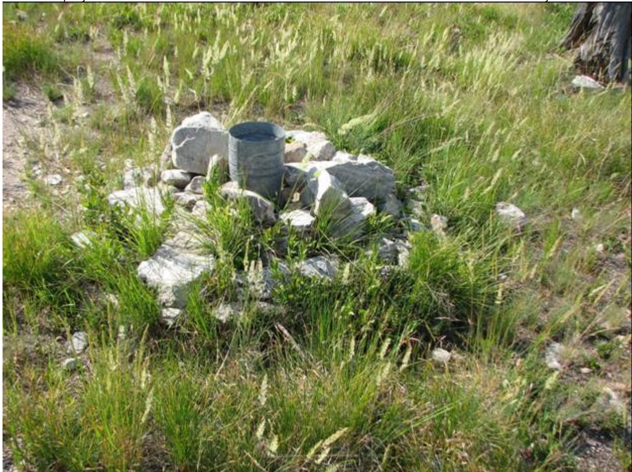
ID_IdahoCounty_GardinerPeakLookout_0011. Detail, rock pile possibly representing the former location of the flagpole.