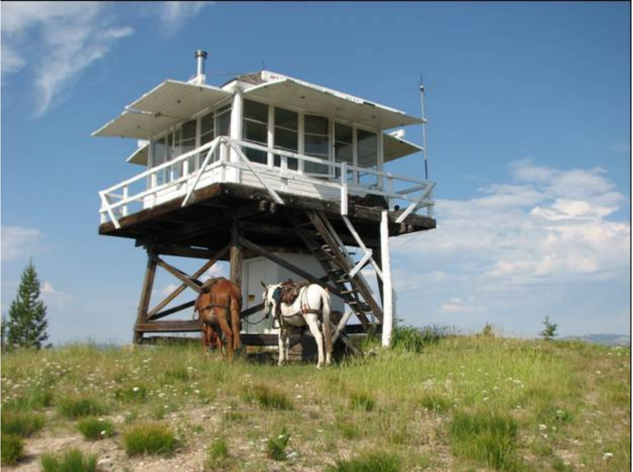
ID_IdahoCounty_GardinerPeakLookout_0001. Looking west-southwest to the southeast (front) and northeast walls of the lookout.