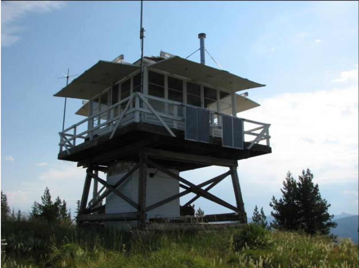
ID_IdahoCounty_GardinerPeakLookout_0002. Looking east-northeast to the northwest and southwest walls of the lookout.