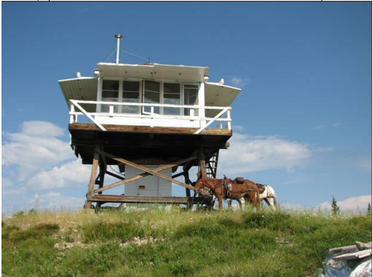
ID_IdahoCounty_GardinerPeakLookout_0003. Looking northwest to the southeast (front) wall of the lookout.