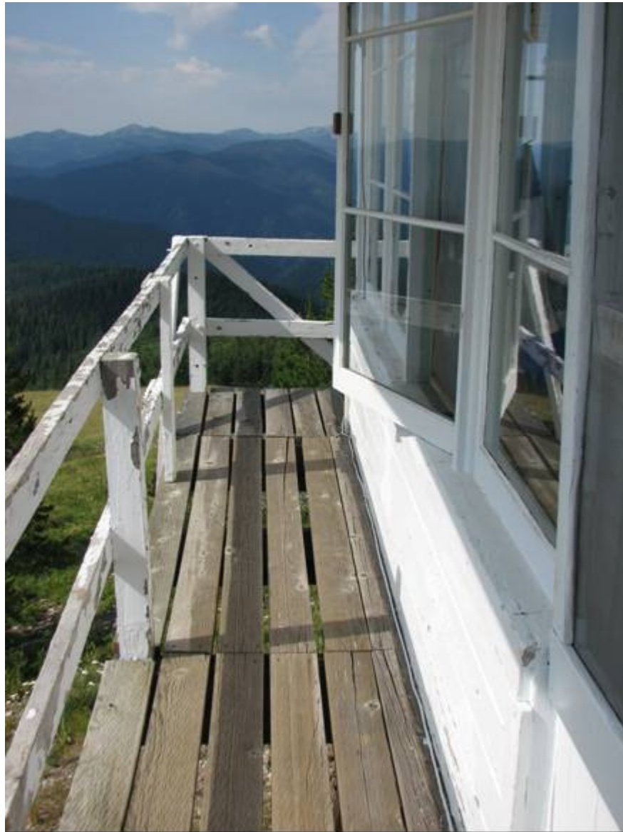
ID_IdahoCounty_GardinerPeakLookout_0006. Looking south along the catwalk.