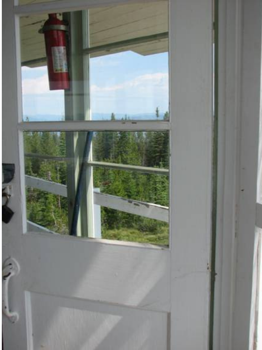
ID_IdahoCounty_GardinerPeakLookout_0005. Looking northwest: detail of the door.