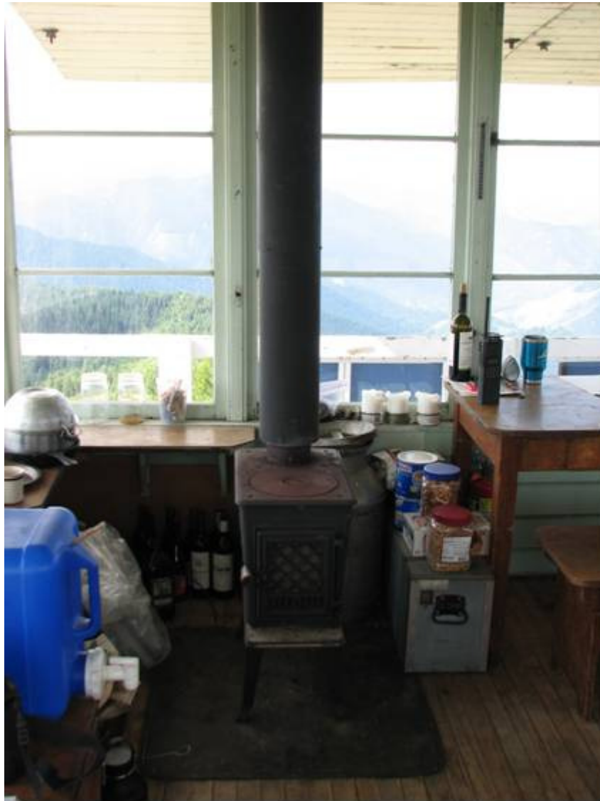
ID_IdahoCounty_GardinerPeakLookout_0008. Lookout interior: wood stove.