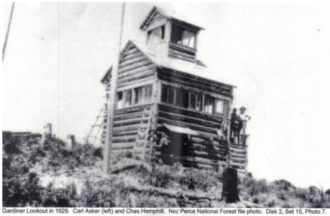
Figure 1. Photo of the 1925 log lookout with cupola. According to Kresek, Charles Hemphill served as the smoke-chaser. 2 Carl Asker may have been the lookout man, whose job it was to remain at the lookout and spot fires.

Although Koch was unimpressed with the location, five years later, the forest built a two-story log lookout on Gardiner Peak (Figure 1). An article in the June 12, 1925 edition of The Spokesman Review , indicated that three, 12 ft. by 12 ft. lookout buildings with a cupola for observation purposes were to be built on “Gardiner’s” Peak, Squaw Peak, and Corral Hill.