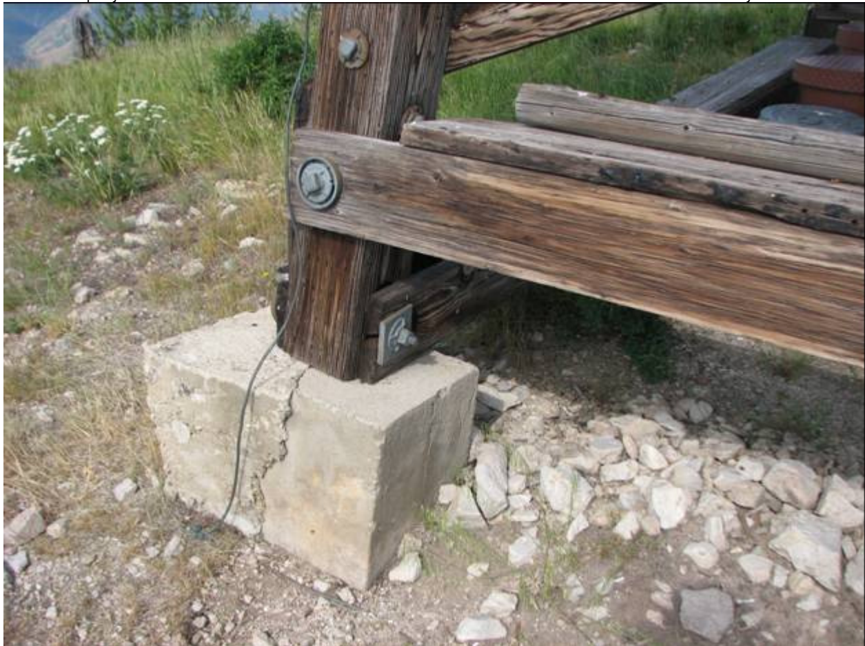
ID_IdahoCounty_GardinerPeakLookout_0004. Detail of the cast-in-place concrete footing.