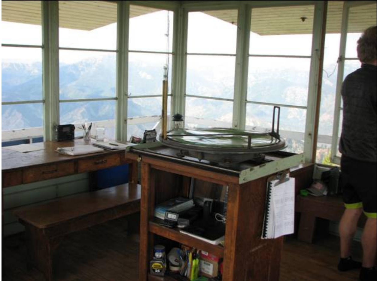
ID_IdahoCounty_GardinerPeakLookout_0007. Interior: stand with Osborne fire-finder.