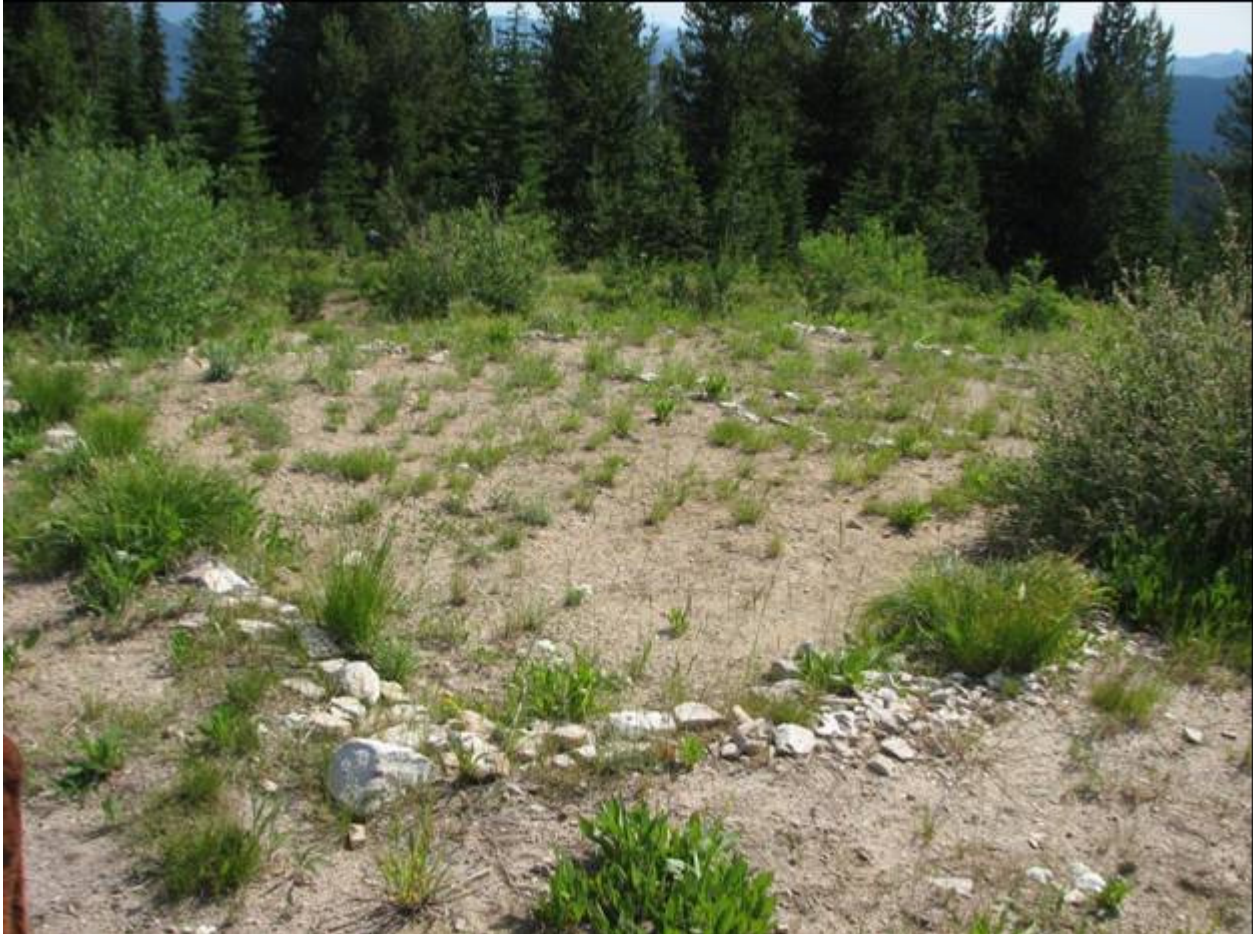
ID_IdahoCounty_GardinerPeakLookout_0012. Overview looking east over the rock-lined cleared area.