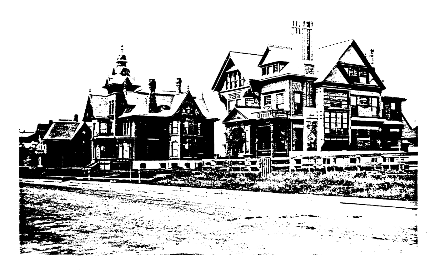
EXTERIOR, LOOKING NORTHWEST