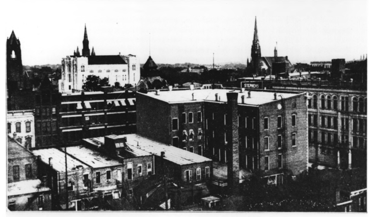
Birds-eye View Fort Wayne, Ind.