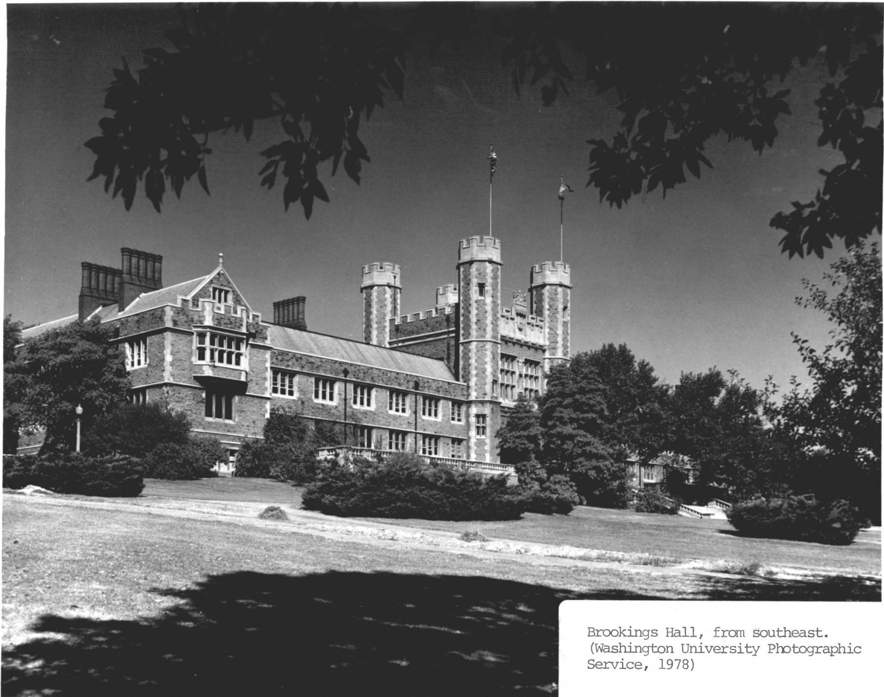
Brookings Hall, from southeast.