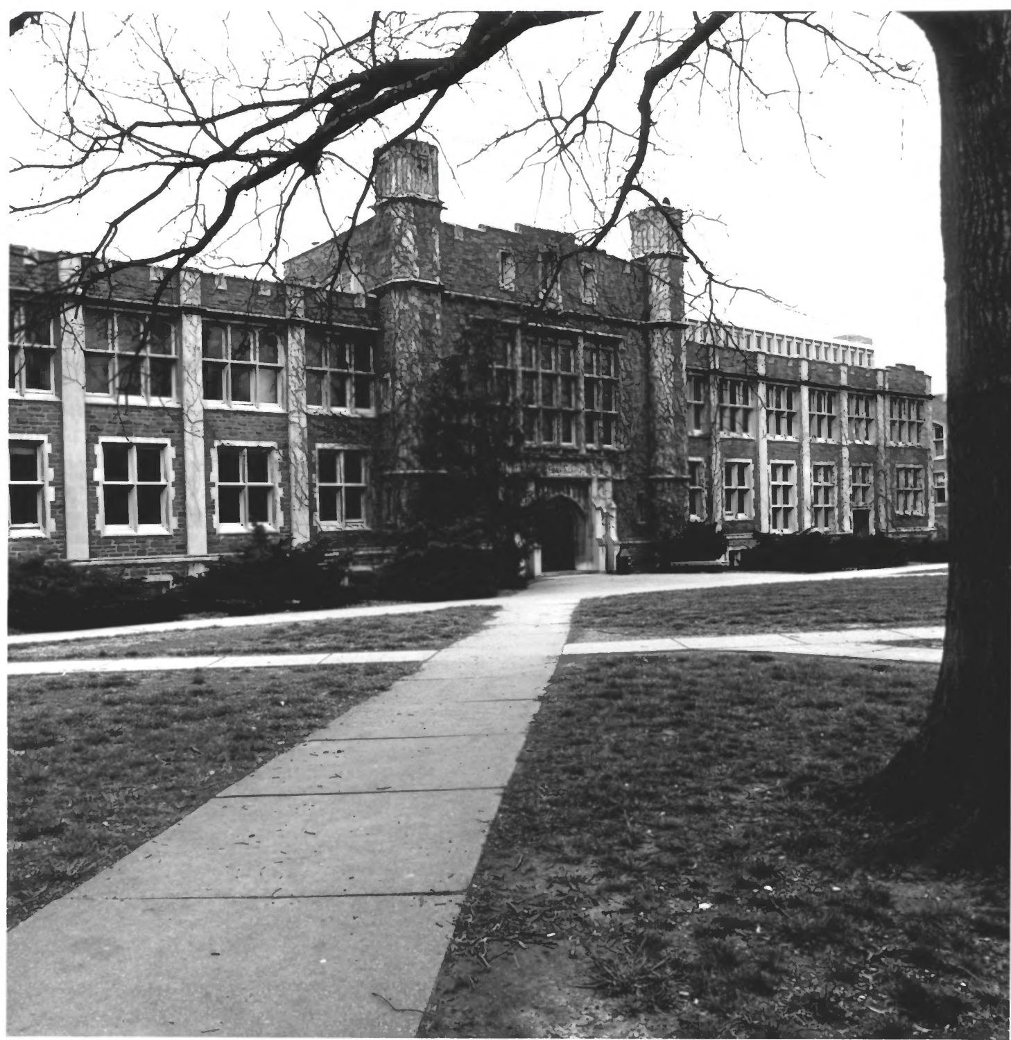
Wilson Hall from northeast.