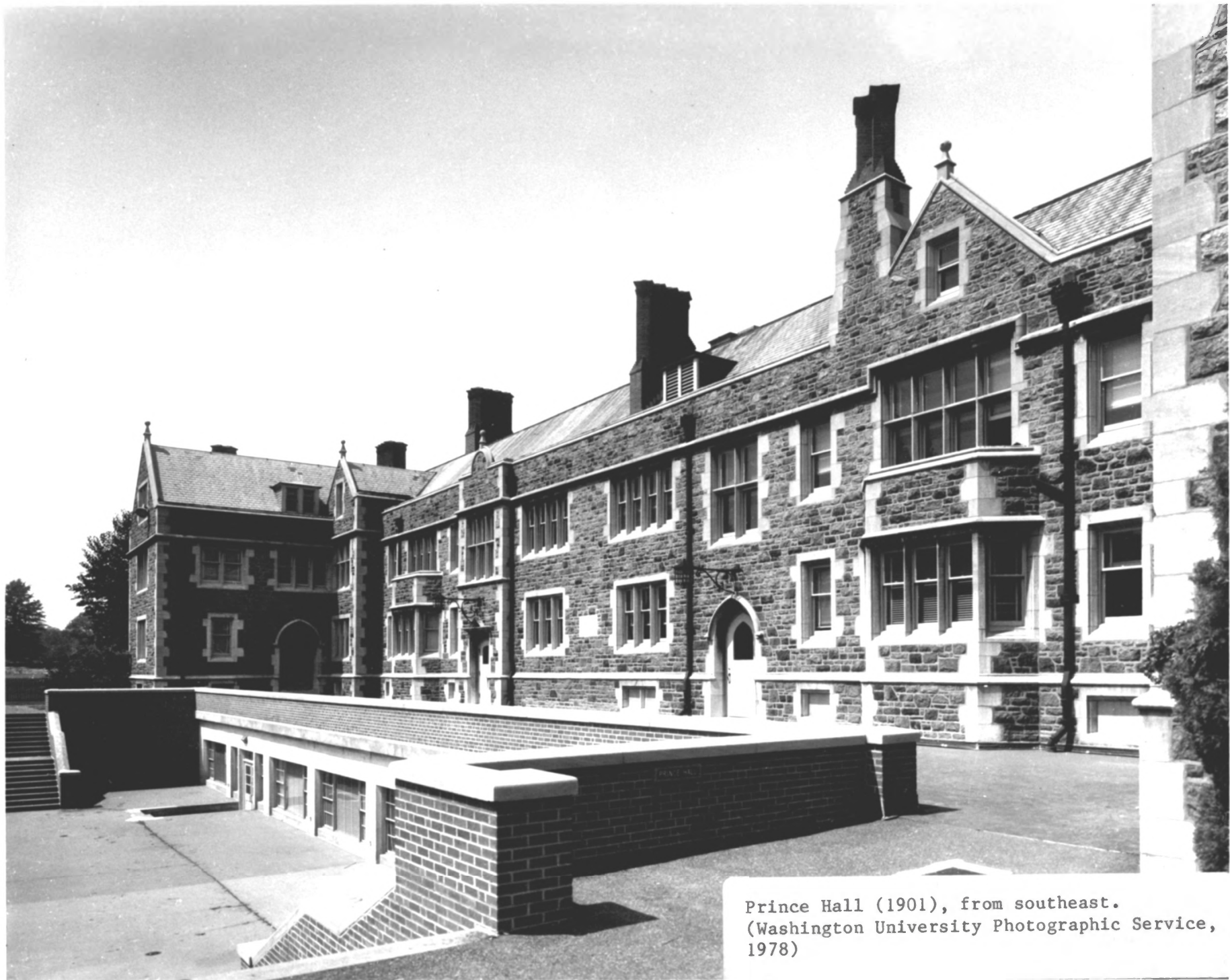
Prince Hall (1901), from southeast.