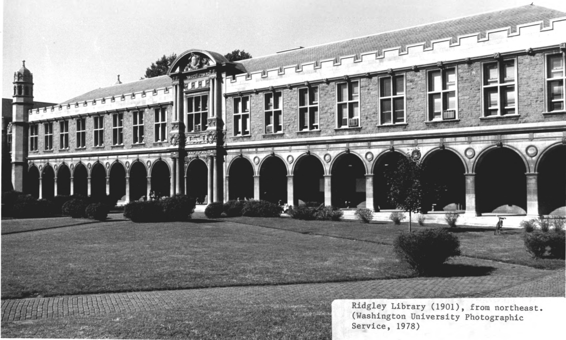
Ridgley Library (1901), from northeast.