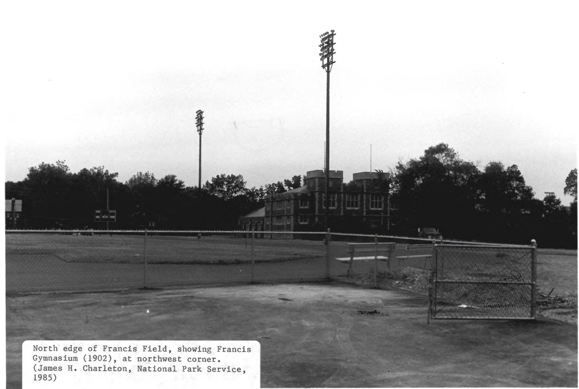
North edge of Francis Field, showing Francis Gymnasium (1902), at northwest corner.