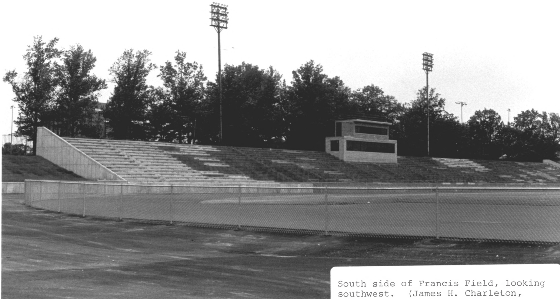
South side of Francis Field, looking southwest.