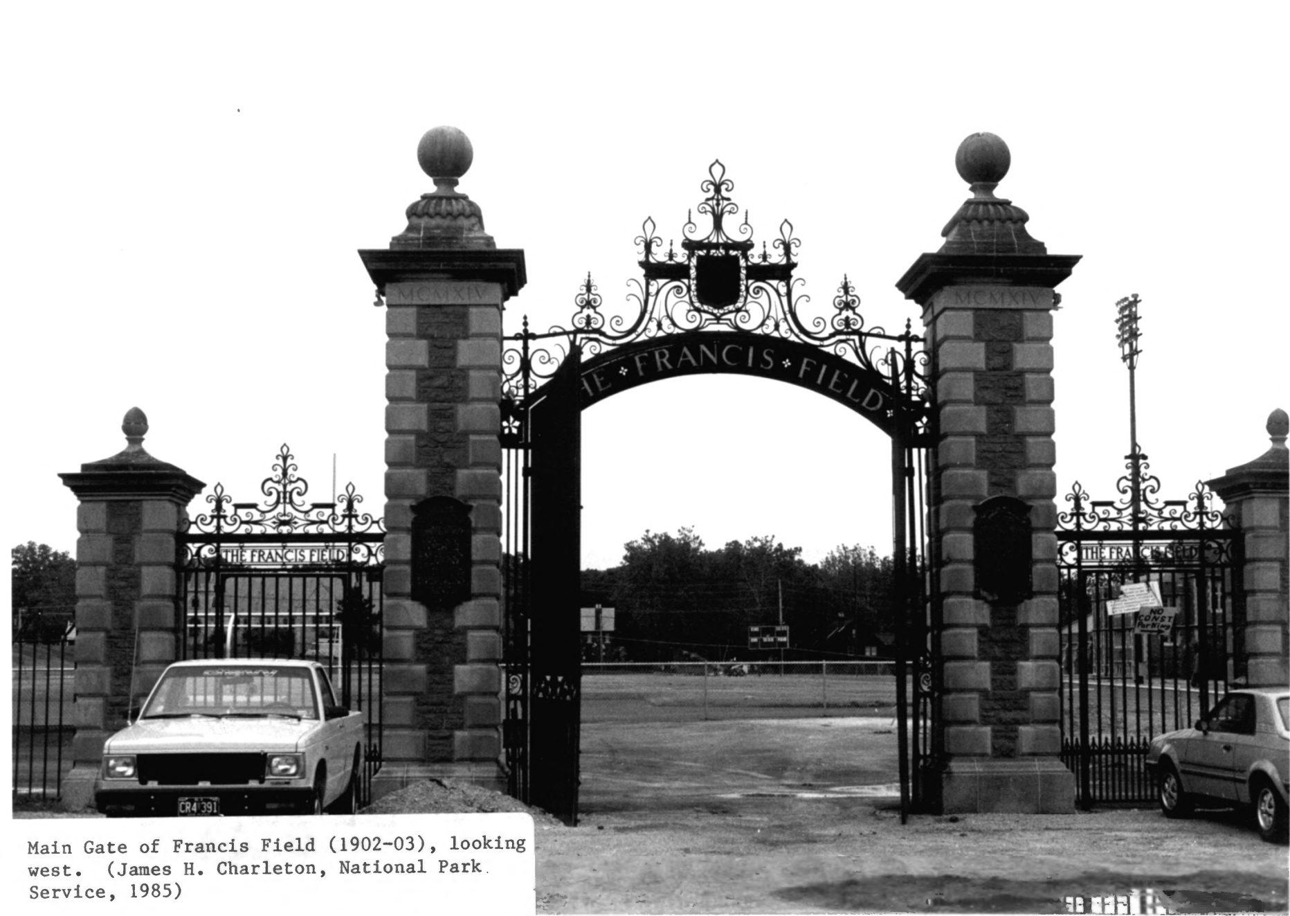
Main Gate of Francis Field (1902-03), looking west.