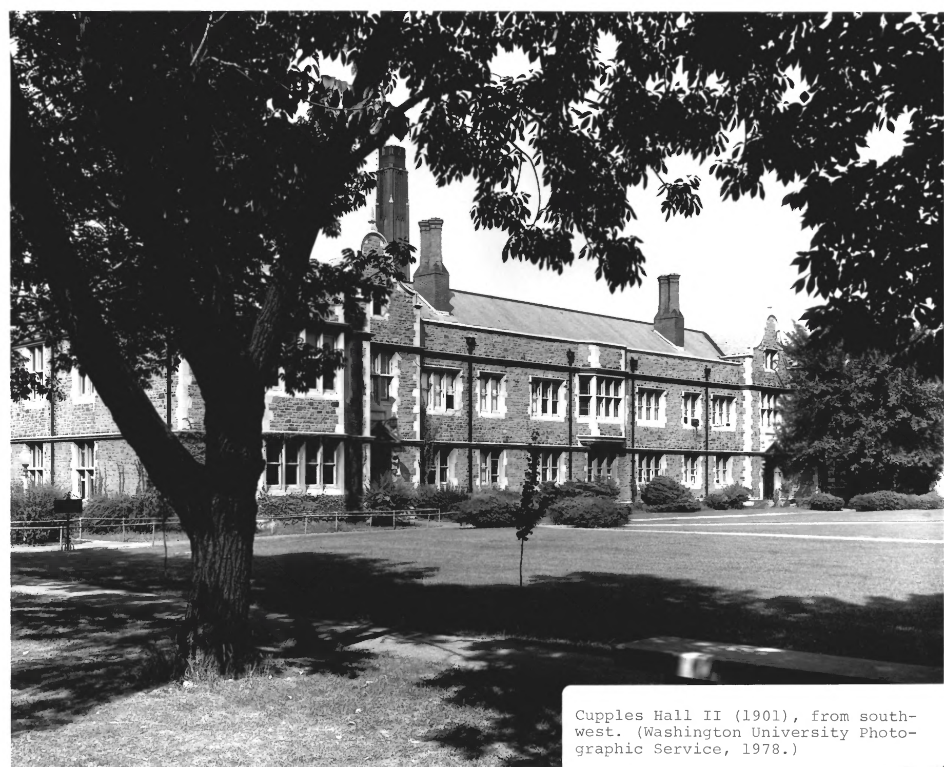
Cupples Hall II (1901), from southwest.