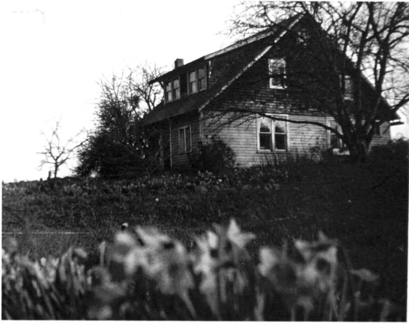
Macpherson farm home.