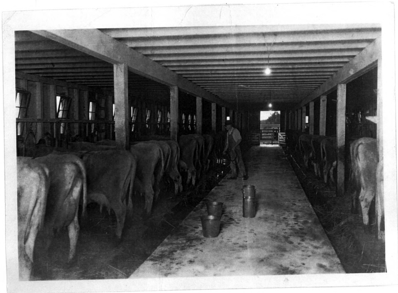
Hector Macpherson Sr. milking with a Surge milking machine. Cow udder wash buckets behind gutter. Tall "shotgun" buckets used to carry milk to the milk house stand in center of drive-through platform. Powdered lime was scattered on floor daily immediately before milking.