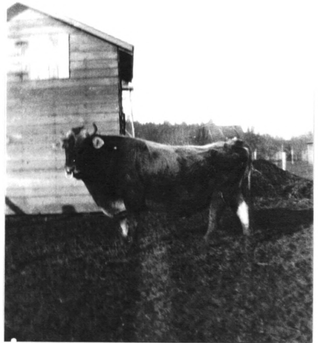
Prize bull "Holger" with his house