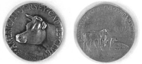
Holger gold and silver medals