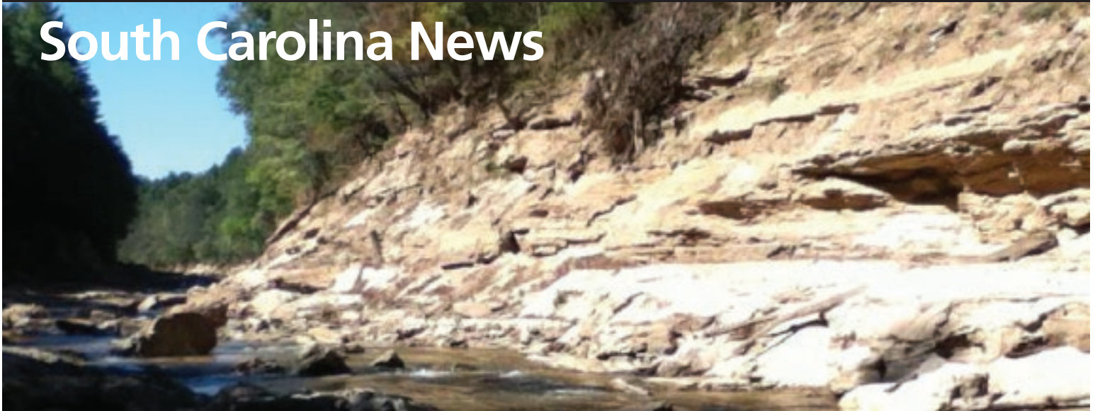
12-mile River Blueway.