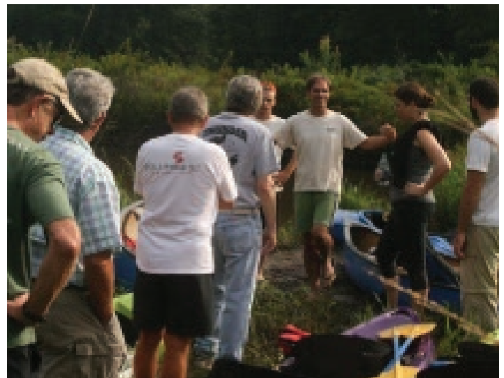
NPS Business Management Office Interns at the Three River Greenway.

Recently, selected as the Department of Interior's America's Great Outdoors Project for the state of South Carolina, the Three River Greenway continues to move forward in developing Congaree Creek Archaeological/Historical Park. Interns from the National Park Service's Business Management Office recently completed a strategic business plan for the historical park which includes a visitor center and 3.5 miles of interpretive trails.