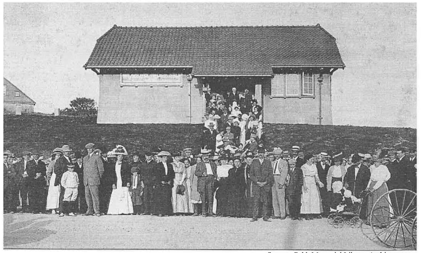
Figure 1: Cobb Memorial Library dedication, August 31, 1912 (looking east).