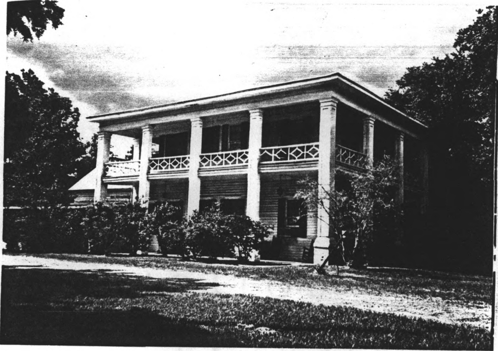
Photo showing column bottoms as they were prior to a recent rehabilitation project.